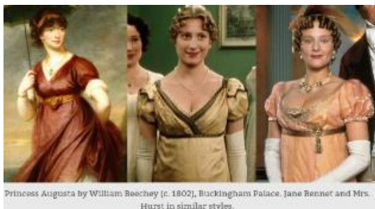
Figure 1. Costumes Pride and Prejudice.