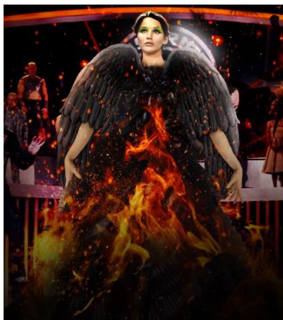
Figure 14. Katniss transformation dress.