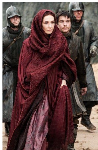
Figure 2. The Red Woman, GoT.