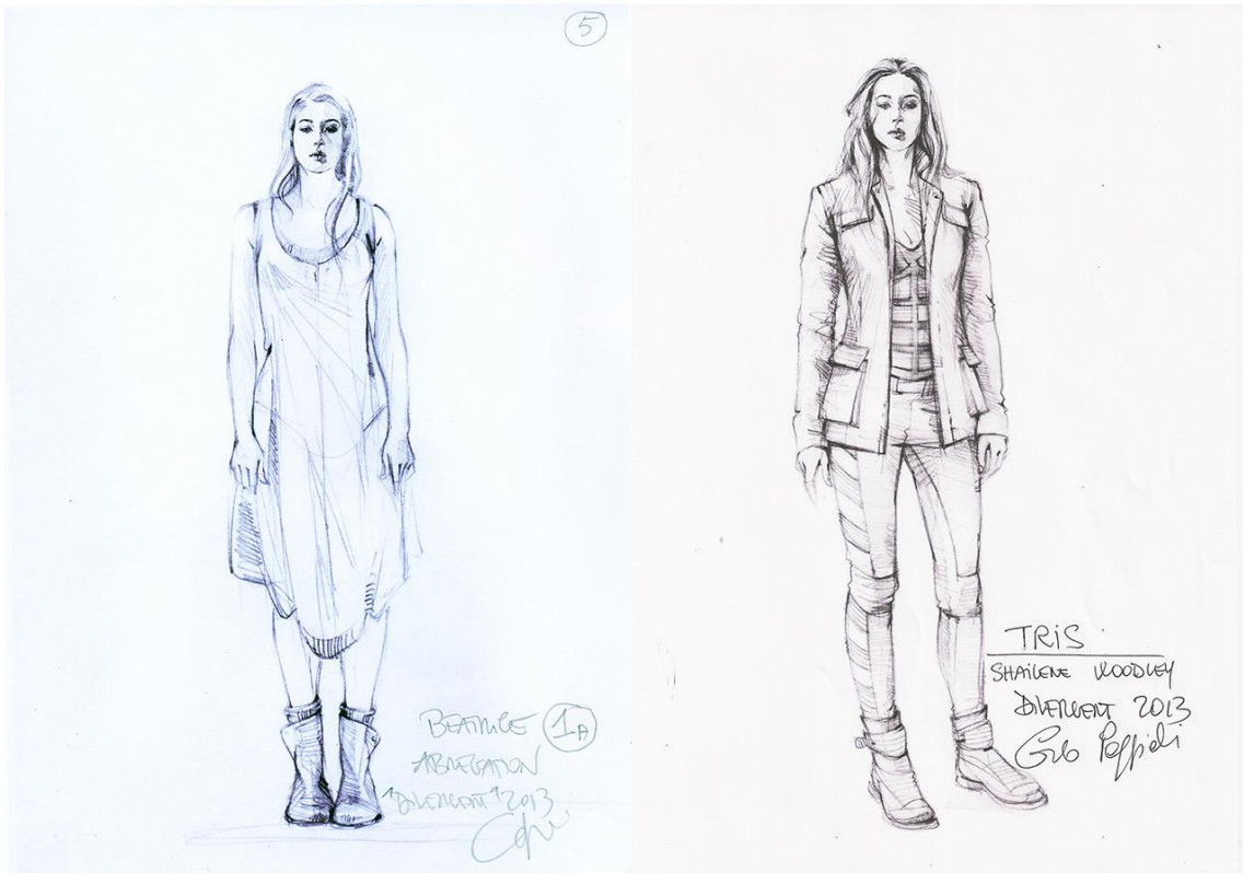
Figure 9. Poggioli costume sketches: Beatrice prior.