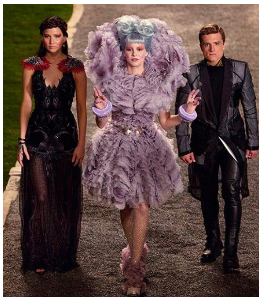
Figure 12. Capitol Couture.