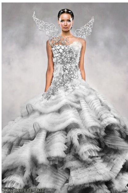
Figure 13. Katniss wedding dress.