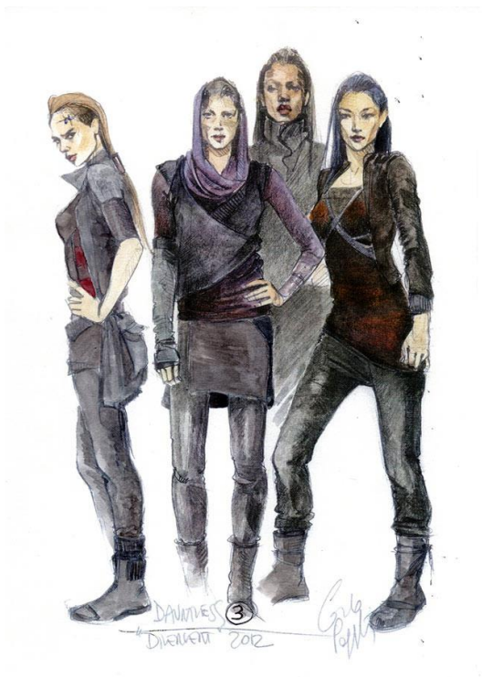
Figure 4. Poggioli costume sketches: Dauntless.