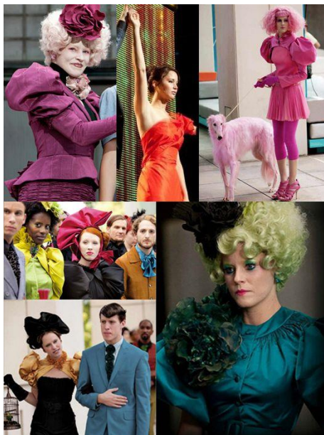
Figure 11. Collage Capitol Couture.