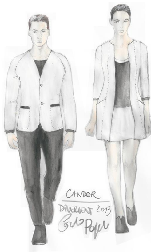
Figure 7. Poggioli costume sketches: Candor.