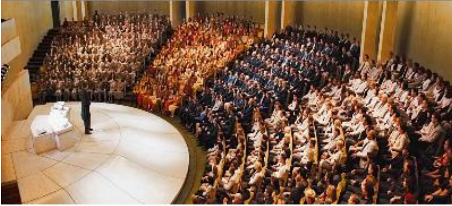
Figure 8: Poggioli costume design: the factions.