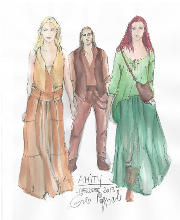
Figure 6. Poggioli costume sketches: Amity.