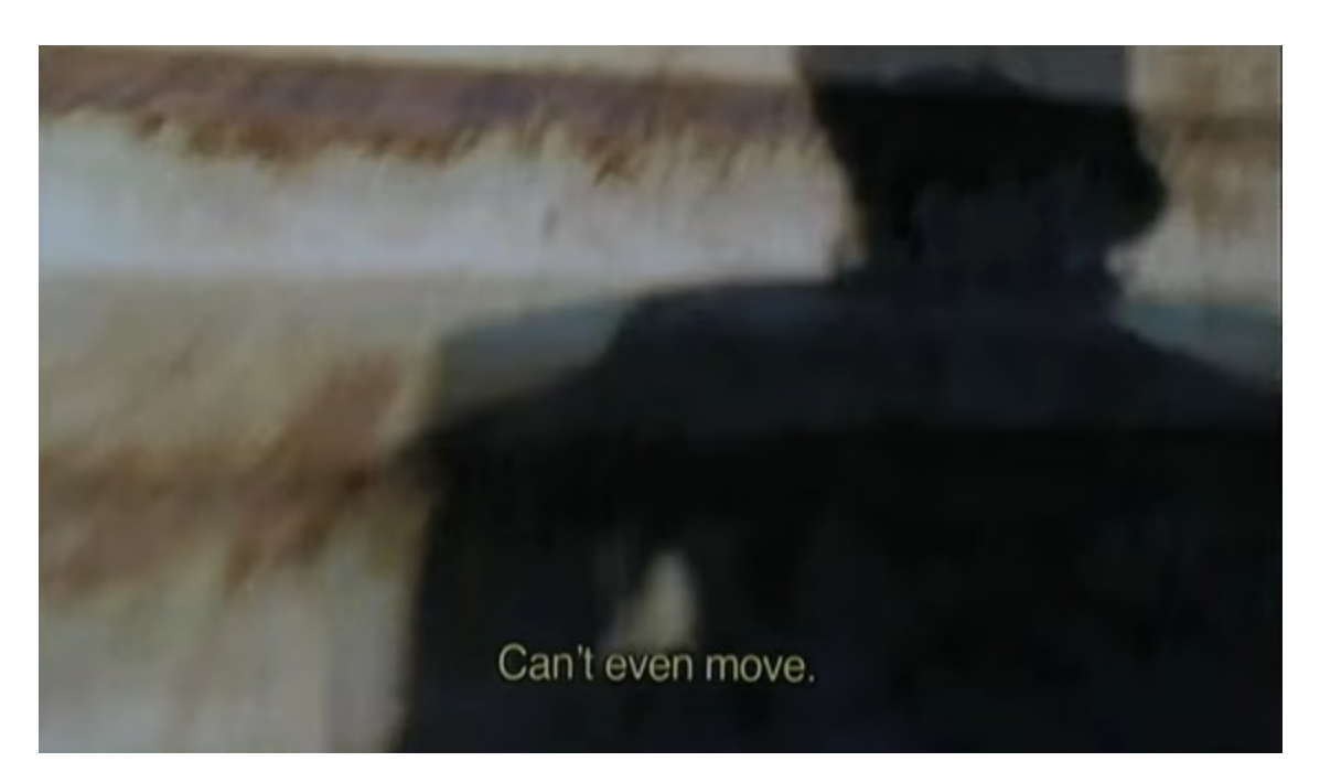
Figure 17. The narrator's silhouette is scene for the first time in the film.