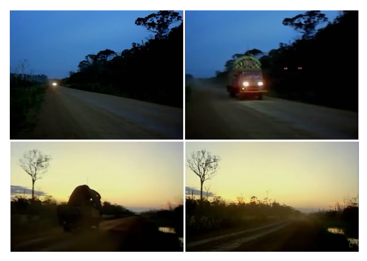
Figure 1. Quadriptych of the Caravana approaching the camera with the dark night sky behind the truck; the camera follows the truck driving past it and then captures the back end of the vehicle driving towards the morning light.

The Caravana approaches the camera head-on, its headlights give its presence away long before the actual truck can be seen. In this dark part of the shot, the truck and its details are visible due to the off screen morning light. When the truck passes the camera, the camera follows the movement of the vehicle – never breaking 'eye contact', but losing focus and fragmenting the image due to the sudden proximity of the moving object. For a moment solely the thundering truck can be seen; there is no background, only sound and motion. Then, in the second half of the shot, the camera concentrates on the complete vehicle once again; only the dark silhouette is discernible against the morning light, as it slowly and anonymously disappears in a cloud of dust. Given the linear trajectory of the road, and the position of this scene exactly in the middle of the narrative, it would seem that this scene can be seen as a representative analogy for the film as a whole – halfway on the nation's timeline with the future in front and the past behind the Caravana. The transition from one phase to another, from night into day, works as a mise en abyme for the movement from tradition to modernity. The present, in this analogy, is blurry and out of focus; the now is a very short, confusing moment but can soon be put into perspective with a look in the rear-view mirror. The times of tradition that mark the beginning of the film and the journey are portrayed as dark and dim;