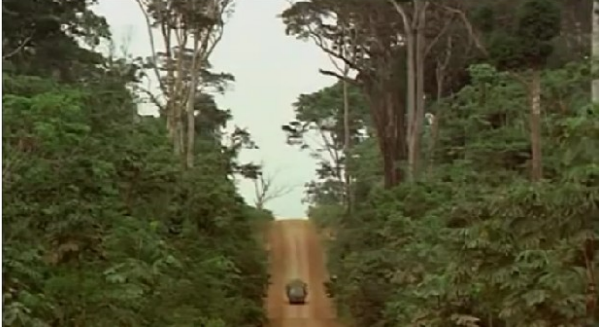
Figure 8. In the image on the left, a mirage denaturizes the concrete nature of the road in Andarilho; it loses its solidity and structure. In the image on the right taken from Bye bye Brasil , the road has a more absolute presence.