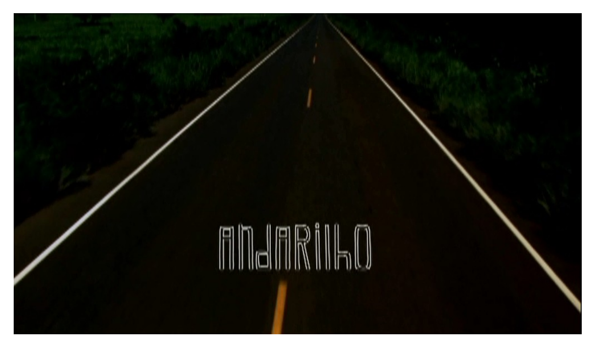
Figure 5. Title superimposed over the surface of the road.

this scene, but the camera simultaneously takes away the signification of that movement by framing it in a vacuum of connotations of progress – the movement is marked to be bare movement .