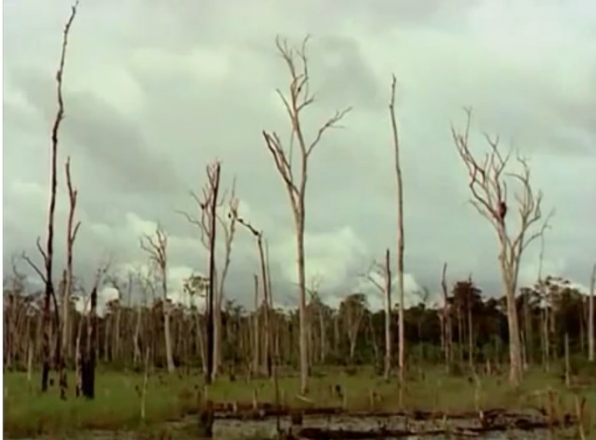
Figure 4. Two shots of barren trees.