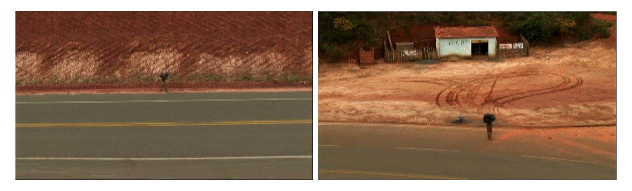
Figure 11. Shot of Valdemar walking on the side of the road (left) and him crossing the road (right).

By becoming an inhabitable space and by having an existence that is independent from mobility, the boundaries between the road and its verges become less fixed. The dichotomy of the mobile perspective that distinguishes between the spaces through which one can move and through which one cannot move does not serve to differentiate between the road and its verges when one can move just as easily in both spaces like the drifters do. When regarded as a consolidated space, the side of the road becomes an integral part of the road's total concept; they are not separated by their significance or purpose – the only contrast is their difference in materiality, like the grass also differs from the water. The sides of the road and its natural surroundings are able to assimilate the road in their realm of existence. As a consequence, mobility's monopoly over the road as an exclusive agent for meaningful displacement is discontinued and the road, depending on the context and representation, can be conceptualized as a part of the landscape as well.