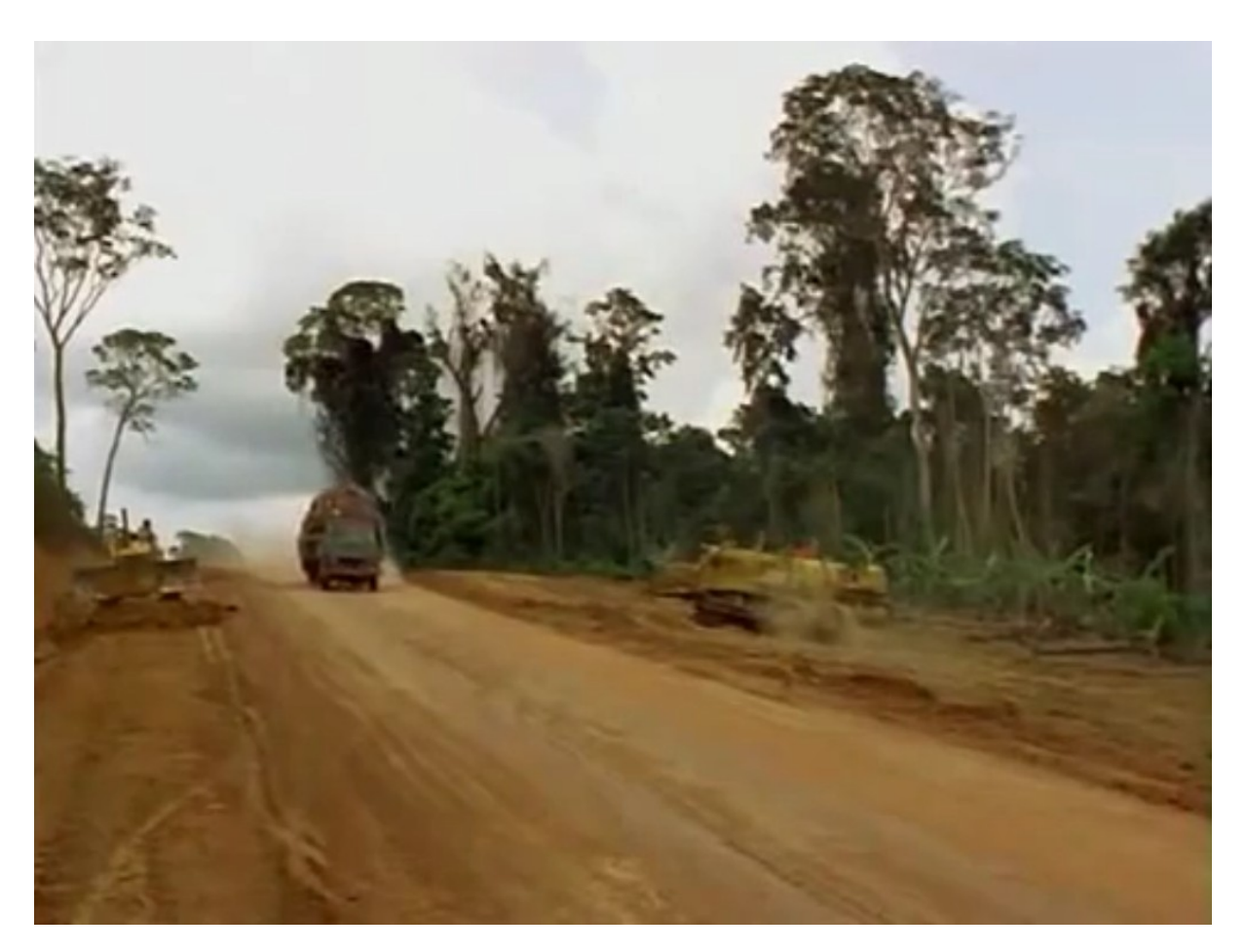
Figure 3. The Caravana and the Caterpillar bulldozers.

The objective of the large infrastructure projects like the Trans-Amazonian Highway was to colonize the interior of Brazil by integrating the Amazonian regions with the rest of the country. Land had to become country. The journey of the Caravana is set to a background of the nation's expansion of the road network; bringing order to the capricious jungle, creating an infrastructure of progress for the whole country. The heavy machines that are there to pave the way towards the interior for the modern Brazilian are at once a monument of man's dominion over nature and an image of the need to progress with abandon. There is an uncomfortable sensation of prestige given to the construction vehicles as their appearance (fig. 3) is a part of a series of shots of the journey that mark the progress the Caravana is making on their way to Altamira, accompanied by Chico Buarque's uplifting soundtrack for the film.