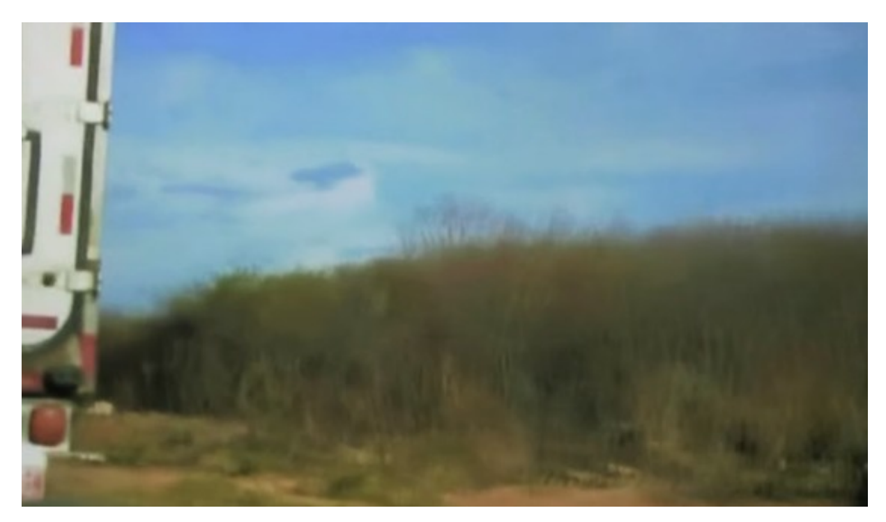
Figure 14. Renato's disengaged perspective.

Indeed, the film's beginning can be considered somewhat slow-paced; the first scene is filmed by a slow rocking, unfocussed camera that can see a few meters ahead in the dark of night and is accompanied by a soothing musical melody. Then the scene cuts to a daytime view of the road and Renato's voice is audible for the first time. Without much enthusiasm he starts listing the equipment he brought along for the trip in a drawling tone. In general, enumerations are by definition not very exciting as they are narrations without a plot or suspense; in this case the slow listing of the inventory and the emotionally detached voice seem to suggest that this is a routine trip, one that leads through prior visited territory. At the beginning of the film the camera mimics Renato's apathy to the surroundings and to the road as it keeps losing focus; the disengaged gaze of Renato, camera and – by extension – the viewer often drifts to the bottom corner of the windscreen of the car (fig. 14). As a consequence, the road is imagined as a non-place that has is marked by the transitory nature of in-betweenness; it is there only to accommodate the traffic's movement and has no meaning of its own other than the meaning that is being assigned to it by Renato's displacement. The geologist's perspective is marked by mobility and renders the road space instrumental setting.