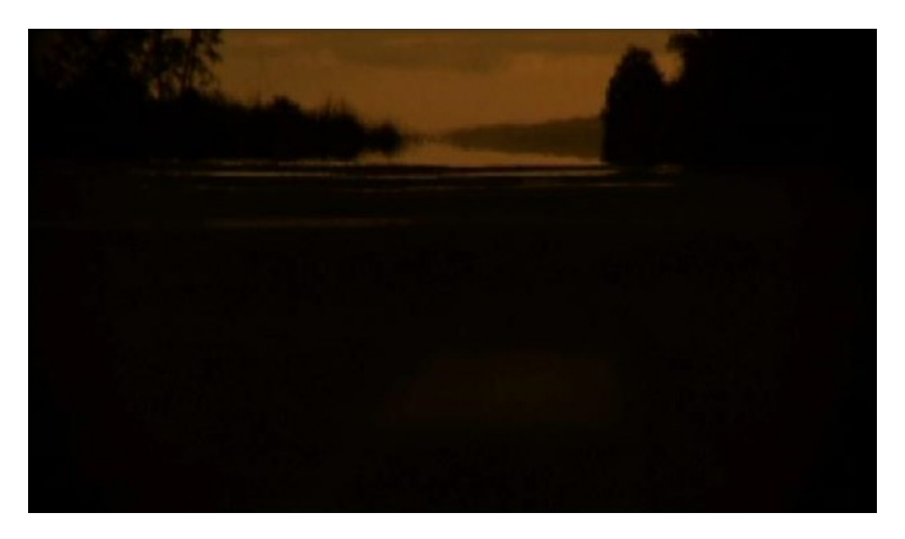
Figure 7. A distorted horizon and hints of asphalt. Despite the surrealist and fluid qualities of the shot, the colour palette gives the scene an earthy undertone. The camera is positioned close to the road and looks into the undistinguishable distance.