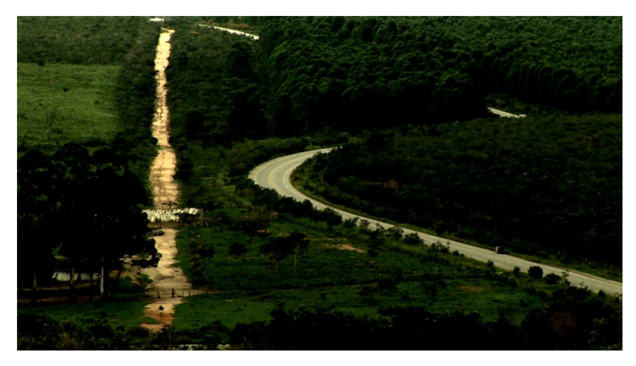
Figure 12. The final shot of Andarilho; the road flows like a river through the landscape and does not cut violently through it.

flows through it – organically, not imposed on the landscape but following it. In the next chapter the exact mechanism between both axles will be analysed in Viajo porque preciso, volto porque te amo .