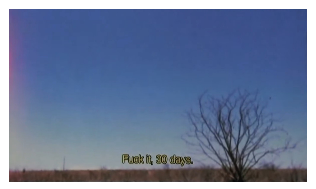
Figure 16. The narrator vocalizes his opinion on the length of his journey.