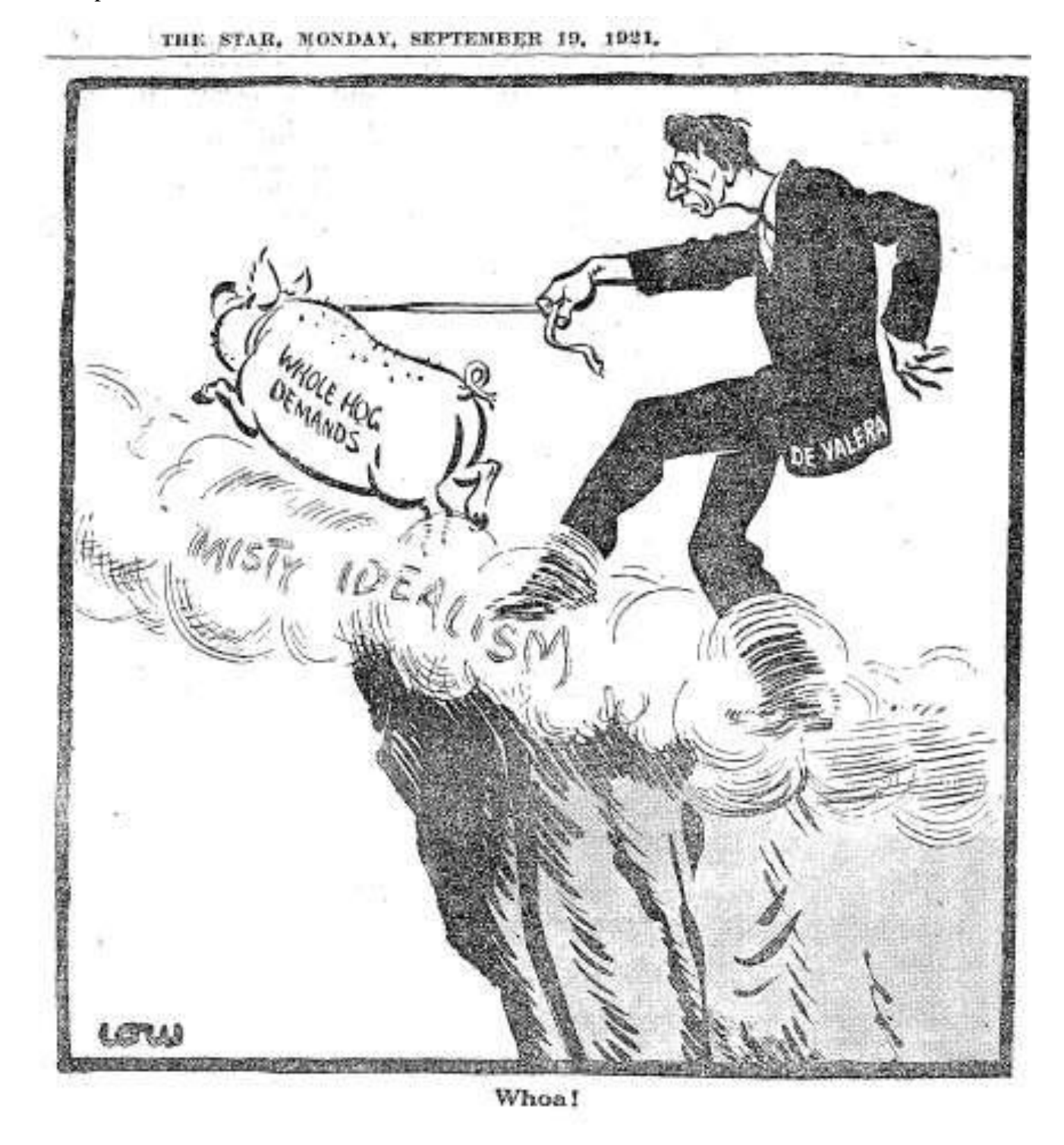
Figure 1: David Low, The Star, 19 September 1921

covered by this paper) was encapsulated by the famous cartoonist David Low in a piece from September 1921: