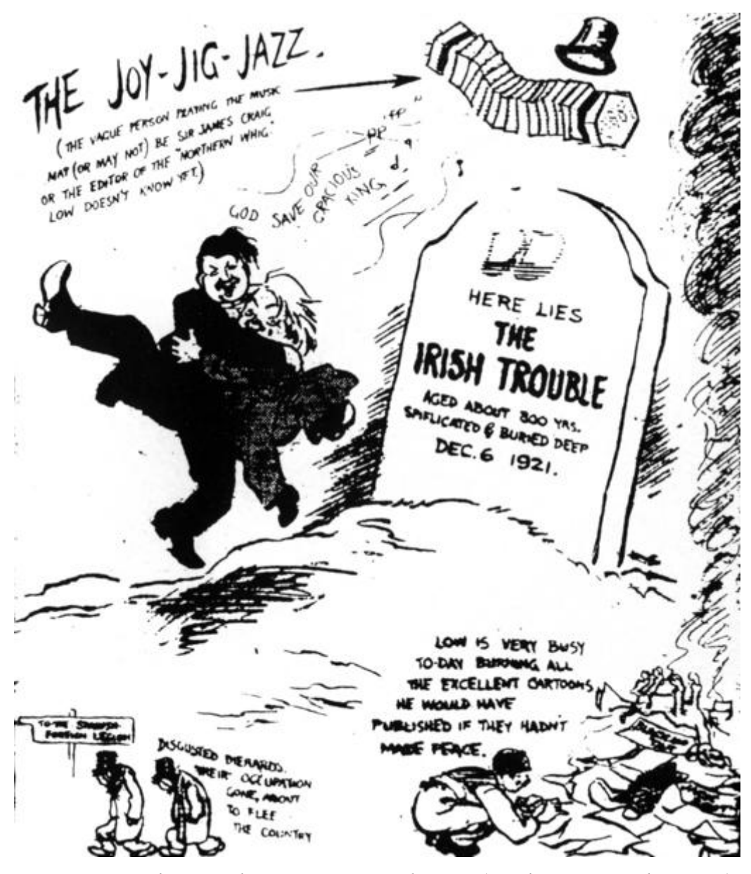
Figure 2: David Low, 'The Joy-Jig-Jazz', The Star (London, 8 December 1921).

Although the journalist's findings may have been slightly exaggerated, it is still clear that those opposed to the Treaty constituted the minority rather than the majority. Aside from written articles, attitudes towards the Treaty and the four politicians were also encapsulated in satirical cartoons, on both side of the Irish Sea: