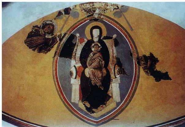
‘an almond-shaped panel’: a mandorla in the Byzantine Church of Panagia Kanakaria, Cyprus.

for his shadow on a wall. This he does in order to disentangle the various threads of his life, his story. 5 After the first pages we shift back in time as we enter an undefined past under the guidance of the first-person narrator in the second chapter. He recalls how he has seen a nameless ‘passing gleam’, ‘in the form of a woman – or an angel’, but he has lost her from sight and now he spends his days painting the same motif over and again: an Indian fakir with a turban wrapped around his head at the foot of a cypress tree, before him a girl in a long black dress, who offers him a flower of morning glory over a little stream between them. He remarks: ‘I was certain that she wished to leap across the stream which separated her from the old man but that she was unable to do so.’ 6 Suddenly a man steps into his room who claims to be his uncle, ‘a bent old man with an Indian turban on his head’. 7 No opium or wine left, he searches the shelf for a bottle of wine, which contains some cobra-venom, to offer as a drink to his uncle. There, glancing through a ventilation hole, a Persian miniature pierces itself in his eyes, a motif identical to the one he paints by day in an almond-shaped panel. With her pale, moon-shaped face and her harmonious grace of movement she reminds him of a ‘vision seen in an opium sleep’, while the bent old man bursts into ‘a hollow, grating laugh’, without moving his face. 8