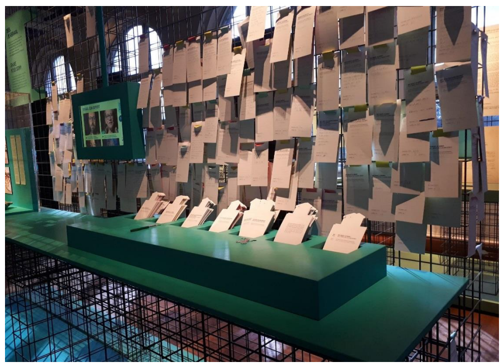
Figure 4.3: Comment section display.

There is a large display at the centre of the exhibition dedicated to visitor comments. The questions asked within the displays, as described above, are printed on little pieces of paper, and two more are added, namely: 'What does the history of slavery have to do with you?' and 'What are you missing in the exhibition?' Visitors can write answers or comments on these pieces of paper and hang them up on the display (figure 4.3).