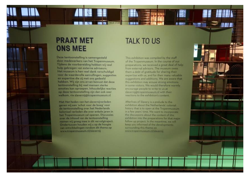
Figure 4.2 Talk to us display.

"Very often in debates in the Netherlands arguments are used like 'it is not our history, it is your history, it is from there, and not from here'. There are so many people who are just not conscious of the way this history lives on, and the way that that has an impact on this system in which they operate. So I think that that was the biggest goal." (Lelijveld, appendix 2)