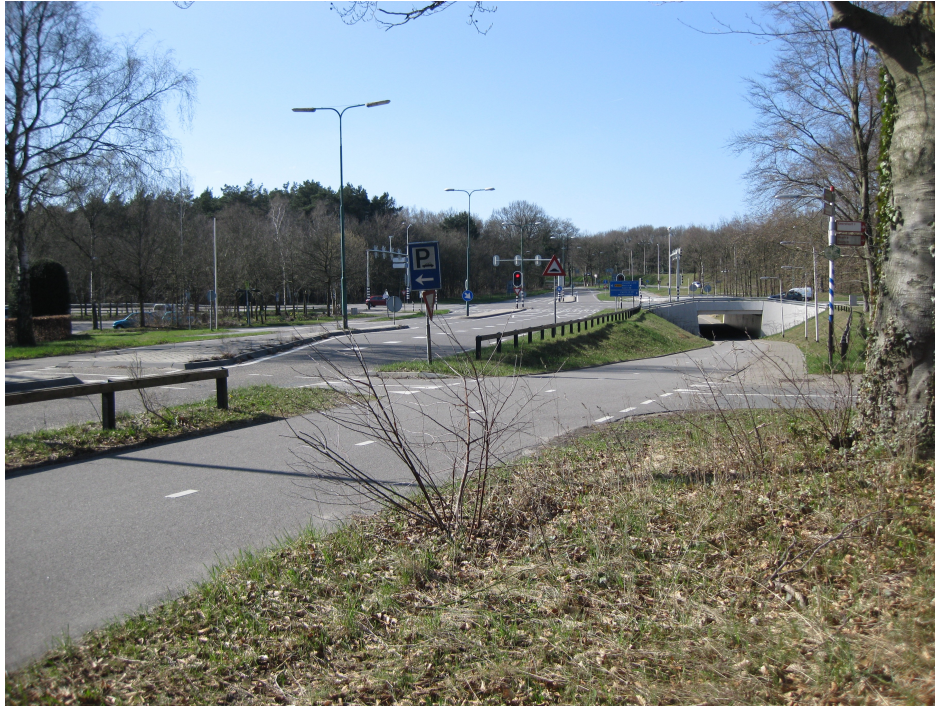
Figure 4: The intersection of the Doornseweg, Laan 1914 and Dodeweg, the place where camp Amsvorde used to be located.