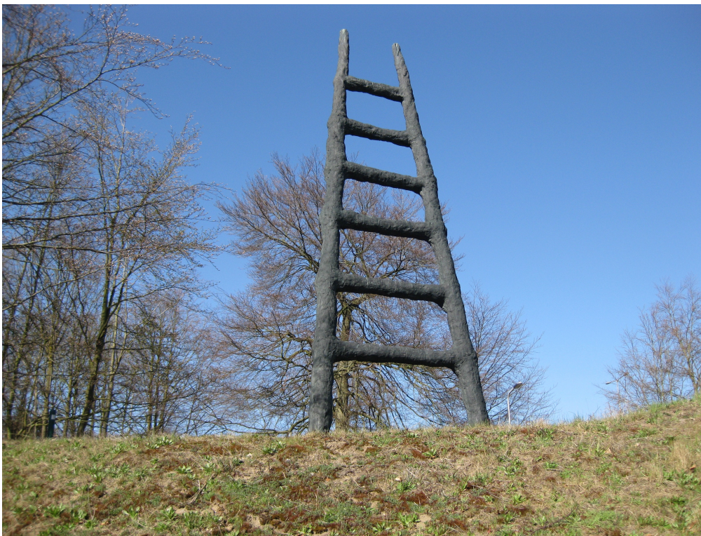
Figure 1: The ladder, symbol for comfort and escape.