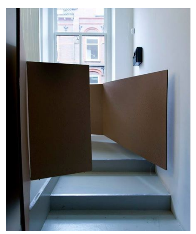
Figure 1.1 Figure 1.2