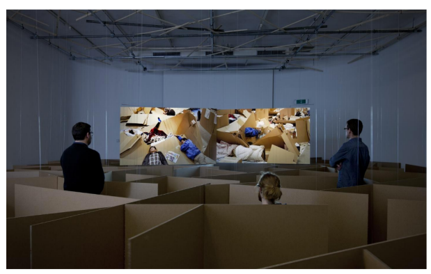
Aernout Mik, Cardboard Walls, 2013, installation view.

a video installation by <u>Aernout Mik</u> BAK, Utrecht (NL)