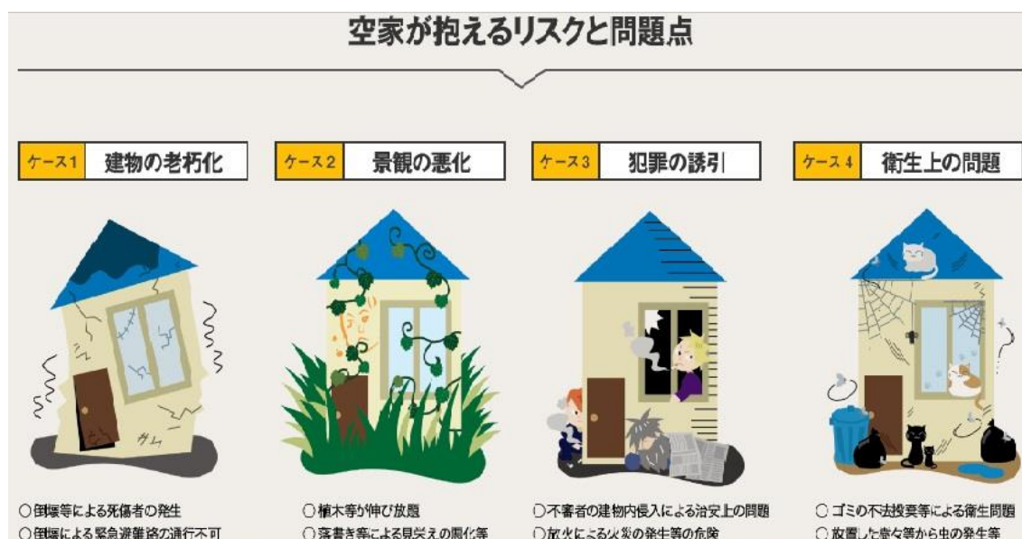
Figure 1. Problems associated with empty houses depicted on the Hankyu Real Estate website.

Much like apartment buildings that are at risk of a lack of management and maintenance, the possibility that standalone houses are not taken care of after becoming vacant is even larger. In figure 1, the dangers of houses becoming deserted and unmanaged are illustrated. The problems associated with empty houses can be divided into four categories. First, deterioration of the house can lead to the possibility of collapse or fire. In the city of Kama in the Fukuoka prefecture, an old and deserted wooden warehouse suddenly collapsed. Although there were no casualties, shortly before a child was playing nearby (Hokao 2014). Another factor contributing to the possibility of collapse in some prefectures is snowfall. In 2006, heavy snowfall in the city of Daisen in the Akita prefecture caused