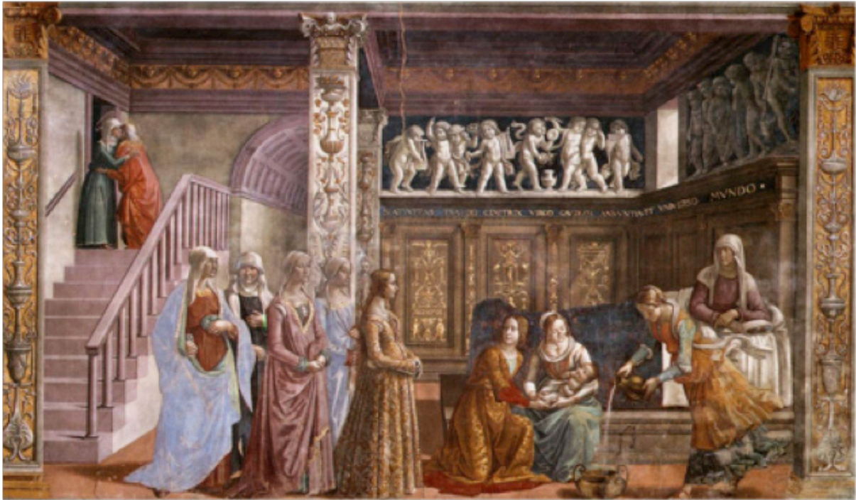
Figure 17. Domenico Ghirlandaio, Birth of Saint Mary , c. 1486-90, fresco, Tornabuoni Chapel, Santa Maria Novella, Florence.