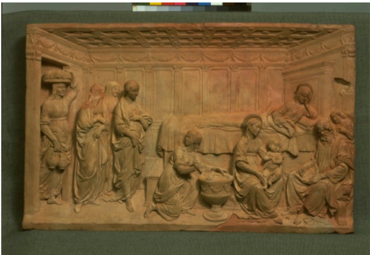
Figure 18. Benedetto da Maiano, The birth of Saint John the Baptist , c. 1477, terracotta relief, 30.5 x 45.7 cm, Victoria and Albert Museum, London.