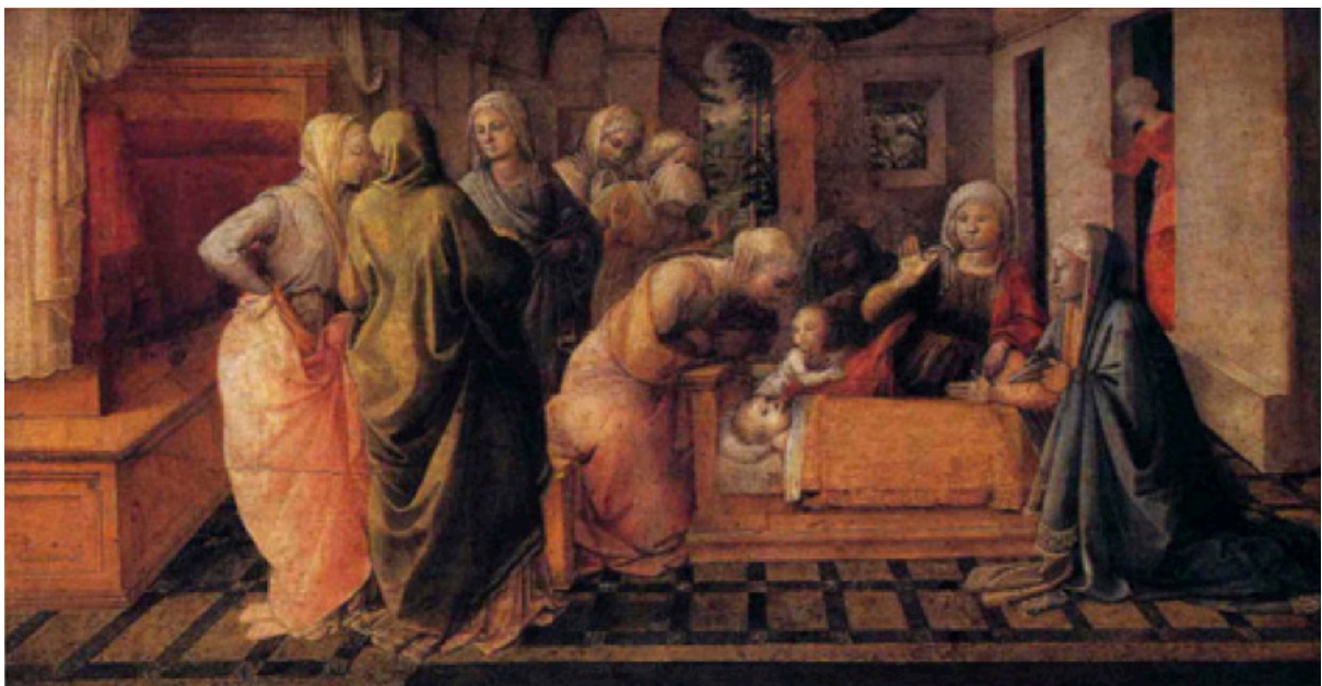
Figure 20. Filippo Lippi, The Miracle of Saint Ambrose , c. 1439-47, oil on panel, 28 x 52.5 cm, Gemaeldegalerie, Staatliche Museen Preussischer Kulturbesitz, Berlin.