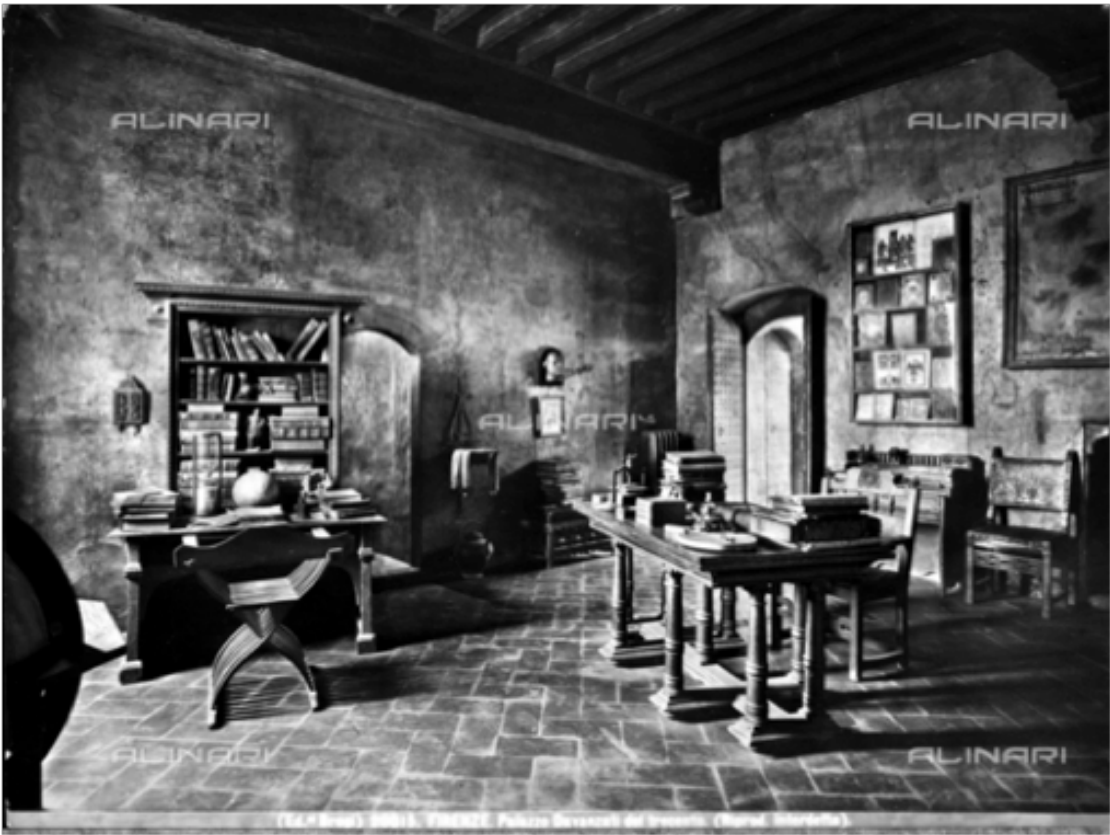
Figure 10. Anonymous, Detail of the fresco cycle Chatelaine de Vergy , c. 1350-59, fresco, Florence, Palazzo Davanzati.