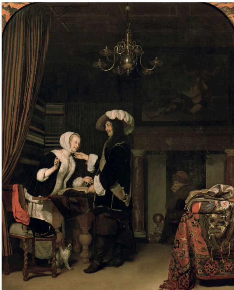
Figure 14. Frans van Mieris I, Cavalier in the shop , 1660, panel, 54,5 x 42,7 cm, Vienna, Kunsthistorisches Museum.