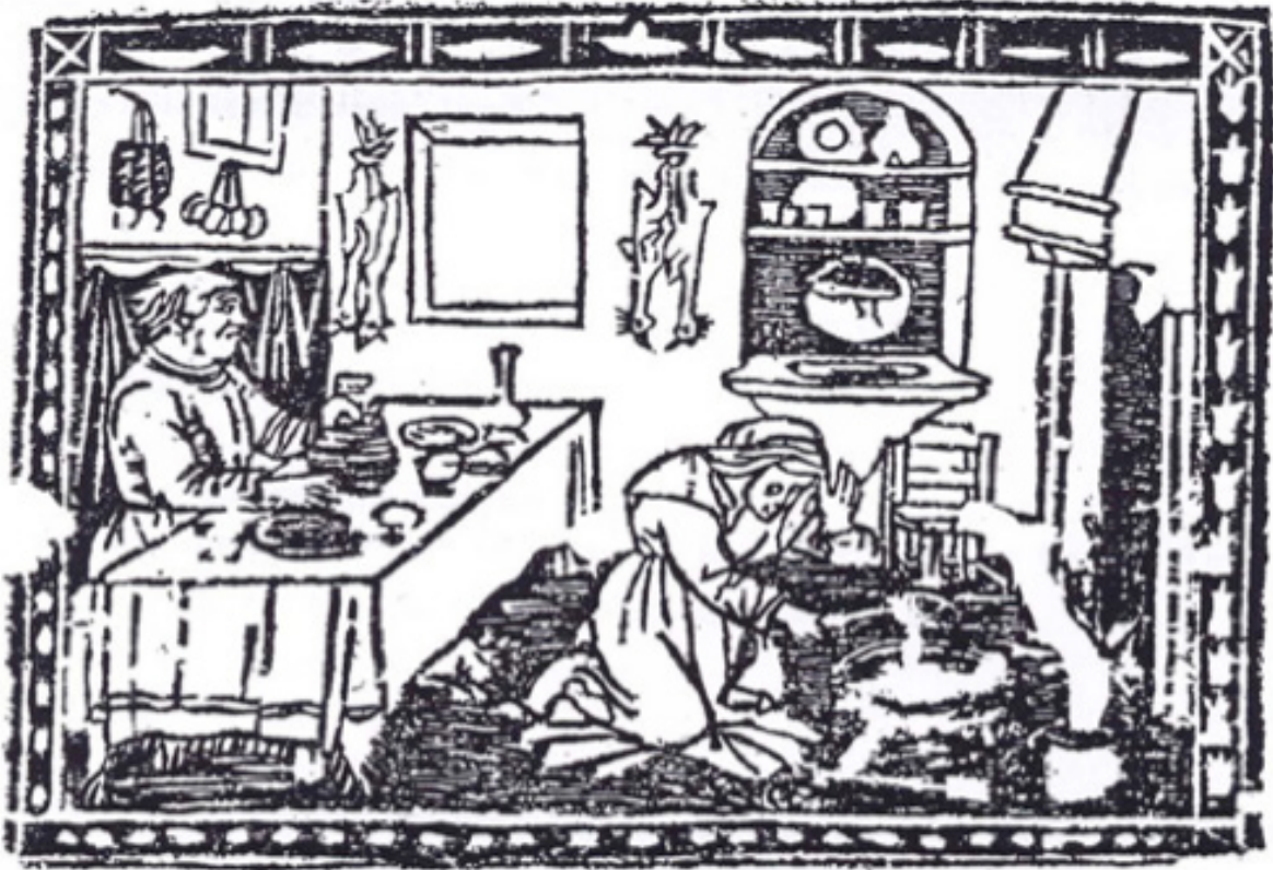
Figure 23. Anonymous, Contrasto di carnesciale et della quaresima , c. 1495, woodcut, 18 x 12.4 cm, Publication Gianni Baleni, British Library, IA.27918.