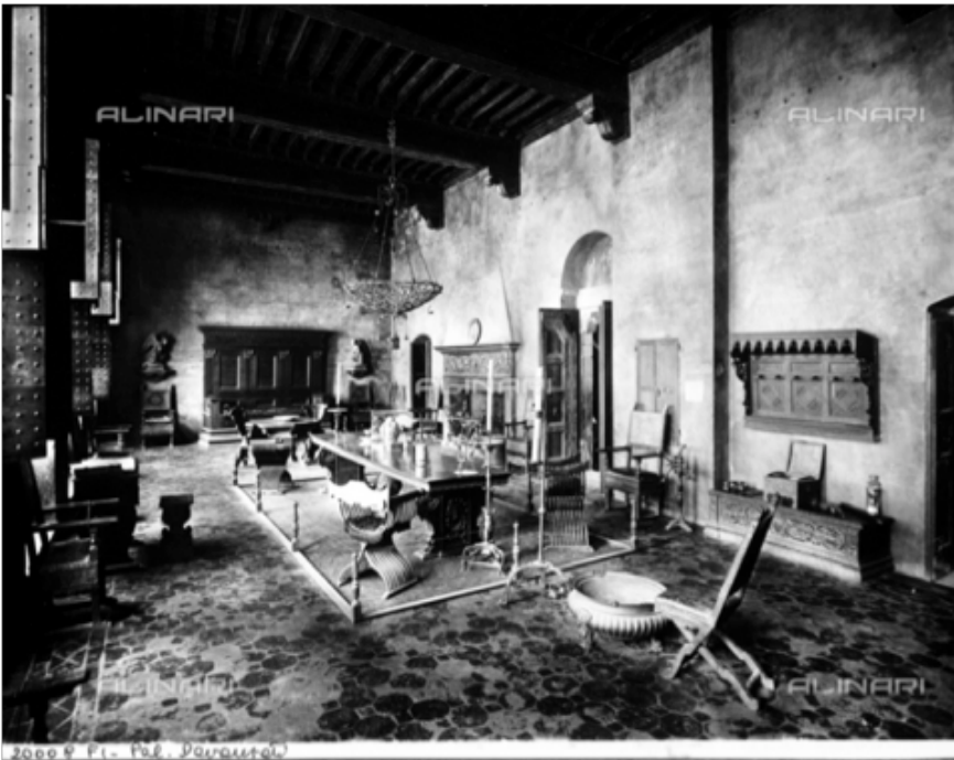
Figure 8. Giacomo Brogi, Sala Madornale , c. 1920-30, photograph, 20 x 15 cm.