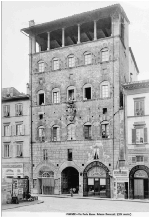
Figure 1. Fratelli Alinari, Facade of the Palazzo Davanzati in Florence , c. 1900, photograph, 36 x 50 cm, Alinari Archive.