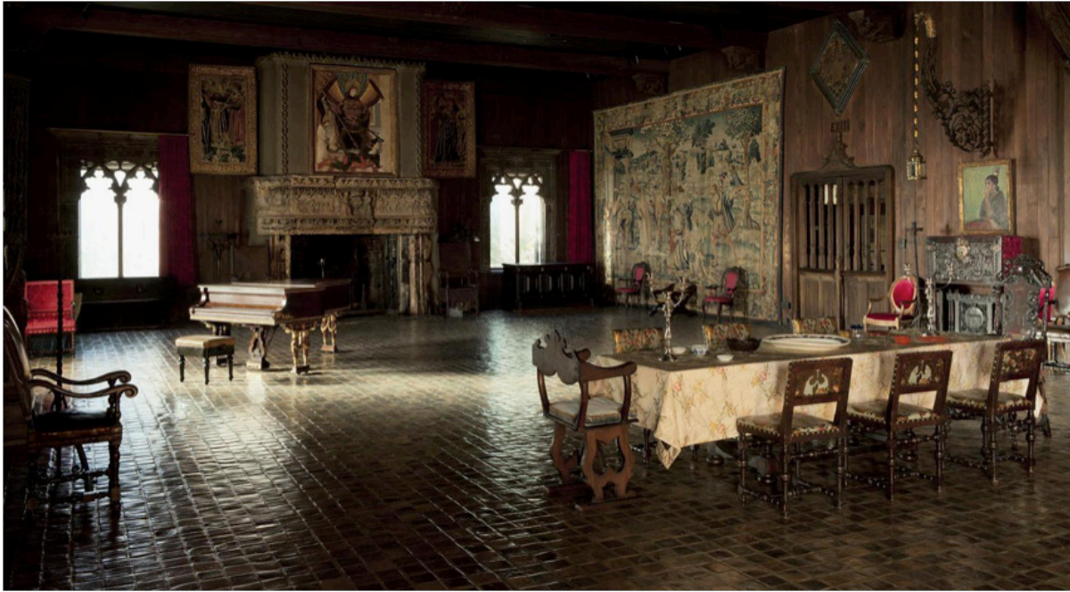
Figure 5. Willard Sears, Isabella Stewart Gardner Museum, Tapestry Room , 25 Evans Way, Boston, photograph.