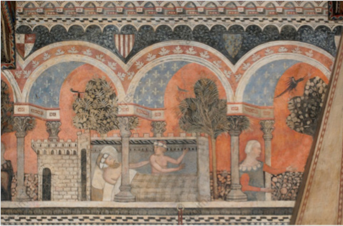
Figure 9. Giacomo Brogi, Study , c. 1920-30, photograph, 20 x 15 cm, Alinari Archive.