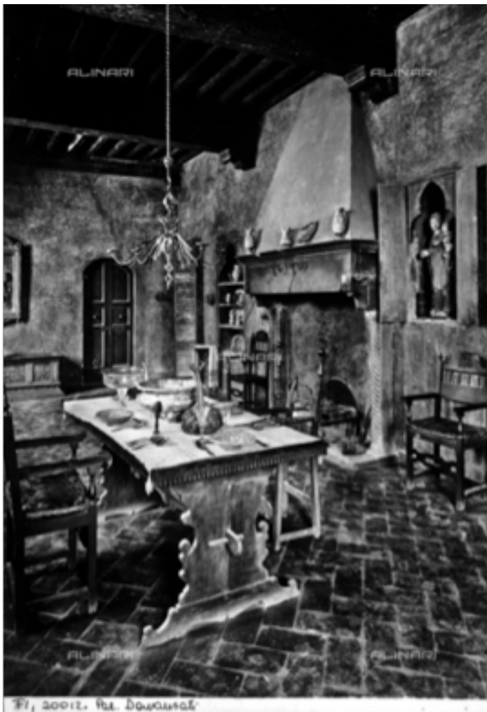
Figure 12. Giacomo Brogi, Kitchen , c. 1920-30, photograph, 15 x 20 cm, Alinari Archive.