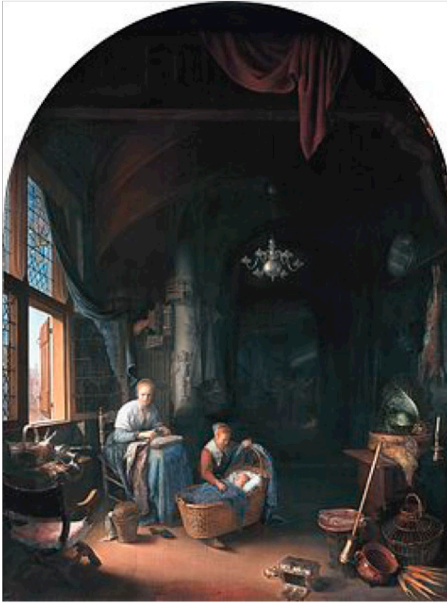
Figure 15. Gerard Dou, The Young Mother , 1658, panel, 73,5 x 55,5 cm, The Hague, Mauritshuis.