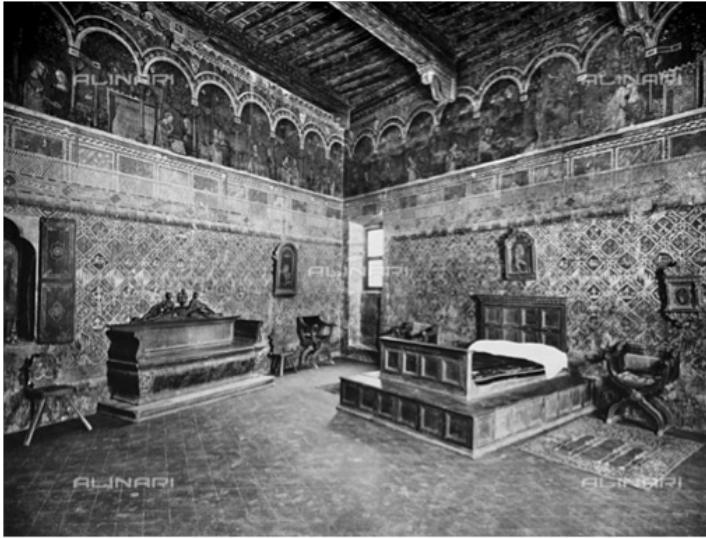
Figure 11. Fratelli Alinari, Camera della Castellana de Vergy , c. 1920-30, photograph, 20 x 15 cm, Alinari Archive.