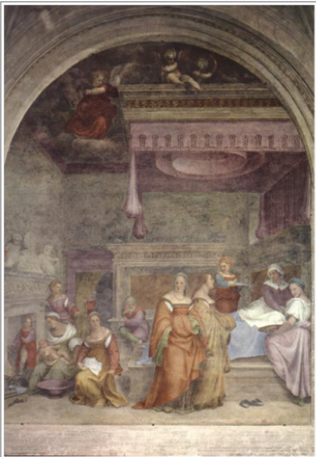
Figure 16. Andrea del Sarto, Birth of the Virgin , 1514, fresco, 413 x 345 cm, Santissima Annunziata, Florence.