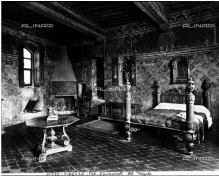
Figure 13. Giacomo Brogi, Camera della Impannate , c. 1920-30, photograph, 20 x 15 cm, Alinari Archive.