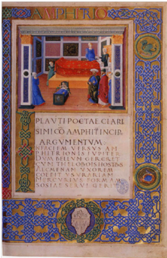
Figure 21. Guglielmo Giraldi, Illumination from Comedies, Plautus , c. 1460-70, on parchment, 35.9 x 23.8 cm, Biblioteca Nacional, Madrid.