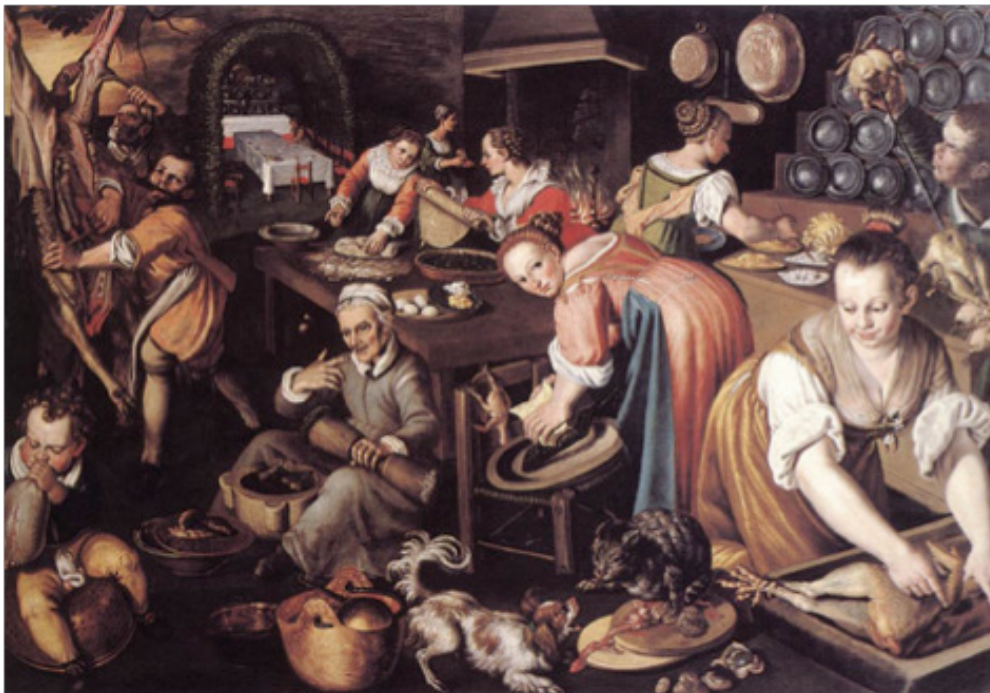
Figure 22. Vincenzo Campi, Kitchen , 1575-85, oil on canvas, 145 x 220 cm, Accademia di Brera, Milan.