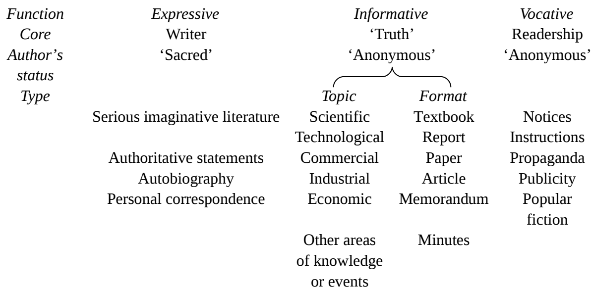
Figure 2. Language function, textual-categories and text-types ( A Textbook of Translation 40)

He also includes a figure to illustrate the relationship between linguistic functions, textual-categories and text-types.