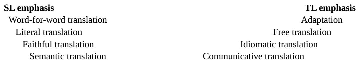
Figure 3. Translation Methods ( A Textbook of Translation 45)

Following up on this thought, Newmark proposes a V diagram to illustrate his own classification of translation methods: