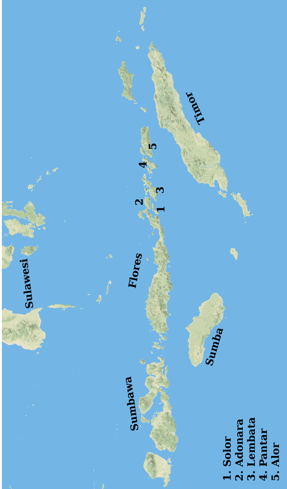
Figure 1: A part of Eastern Indonesia. Lamaholot can be found on the eastern tip of Flores and on the smaller islands marked with the numbers 1 to 5.