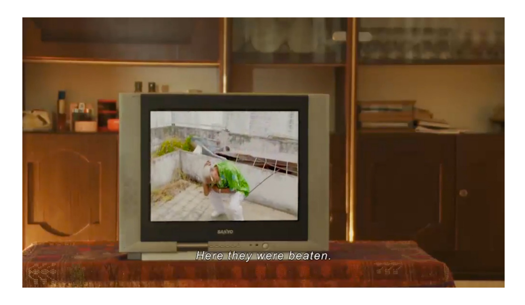
Fig. 3, Re-watching 'first roof top scene,' TAOK 00:27:38

Shortly after, we see the above scene again. This time, we watch it as mise-en-abîme on a TV, and simultaneously see Anwar, Herman, another man and Anwar's grandchild watching it. The camera jumps between the scenes on TV (see fig. 3) and Anwar and the others. The shots switch between wide and medium close-ups, allowing for an insight of both Anwar's body language and facial expression. In the mise-en-scène, Anwar now takes the position of the spectator, according to Arendt the position allowing for impartial judgment. The object of judgment - Anwar's deeds - is now represented and for him as spectator and removed into distance. As such, this situation partly provides the conditions for critical judgment for Anwar.