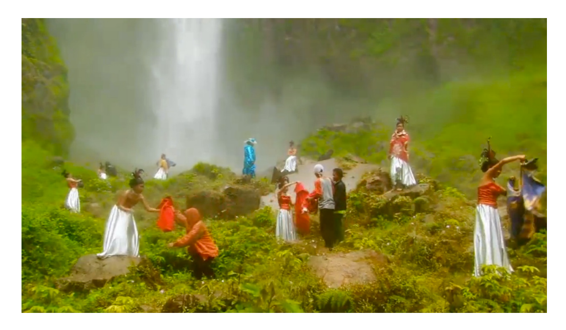
Fig. 1, "This isn't fake!," TAOK 00:01:56

In contrast to this visual impression stands the audio, which breaks with the illusion: from the off, we hear a man shouting the above stage directions. After the 'cut,' we see men running in the frame, giving out towels and blankets to the dancers in their thin dresses – emphasising the contradiction of the statement "[t]his isn't fake" (see fig. 1). Screened before the title and the introductory comments as I have described at the beginning of this chapter, this scene appears as a form of prologue or even audio-visual epigraph, setting the theme for what is to come. To make aware of the mise-en-scène both within the film and the film-in-film, the mise-en-abîme, is one of the most dominant stylistic devices of the film. It questions a clear separation of what we deem 'real' and what we deem 'fictional' or stage-played, making aware of the sliding passage between these conditions and of the narratives that construct what might believed to be a irrevocable truth.