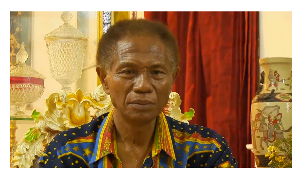
Fig. 6, Astonishment No.2, TAOK 2:28:32