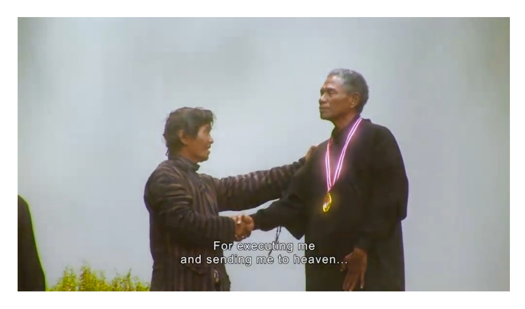
Fig. 7, 'Judgment Day', TAOK 2:24:02