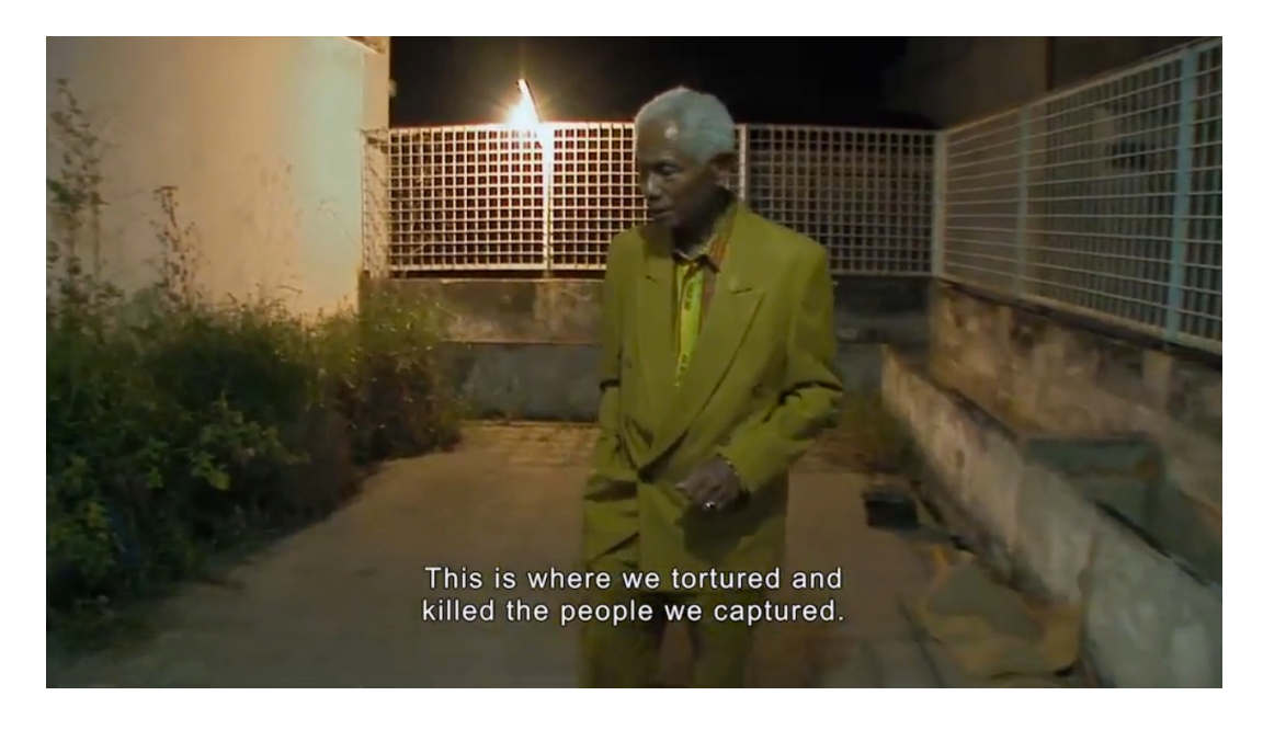
Fig. 9, "A haunted space," TAOK 2:31:34

A 'reparative' reading can account for affect by allowing viewers to "remain conscious of textual hostilities and be hurt, scared, scarred and angry in relation to them" (Edward 112). Following this, a possible sense of frustration about not knowing whether Anwar's vomiting is 'real' or not, can be assessed as an impulse to question the possibility of clear categories, of knowing what is 'true,' and to reflect on possible implications of this. This uncertainty highlights again the difficulty or impossibility of stable moral judgment. In contrast to focusing on Anwar and the question whether his performance is 'real' or not, remaining conscious or being perceptive towards this scene without asking for its meaning might enable us to gain further insights.