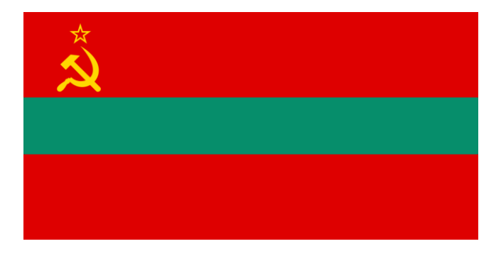
Flag of the Republic of Transnistria