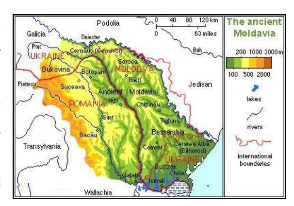
Map of the Historical Region of Moldavia ©New World Encyclopedia

and Bessarabia. Unlike Transylvania, which was acquired from the defeated Austro-Hungarian Empire, Bukovina and Bessarabia where occupied the Romanian armv whilst Russia was preoccupied with the Russian Civil War. from these Representatives occupied territories decided to go ahead with unifying with Romania in 1918.