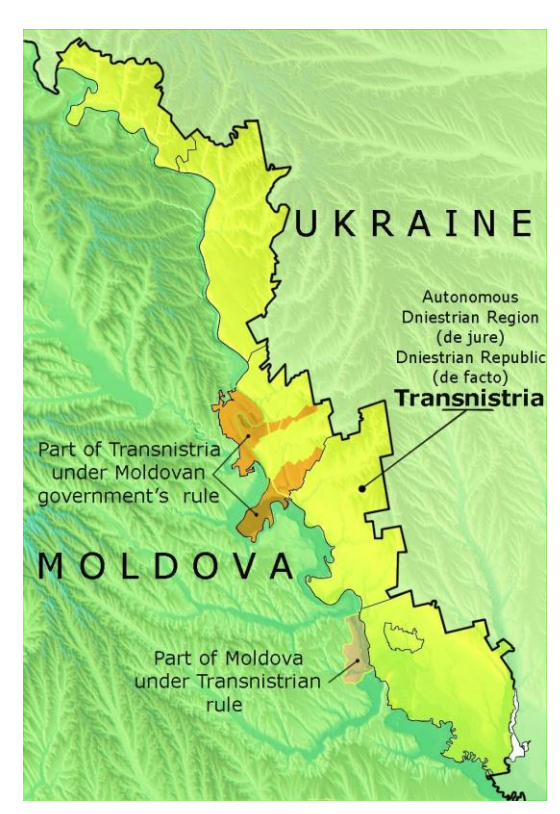
Map of Transnistria

The research design falls mainly under the direction of the thesis' nature as a historical piece. The fundamental requirements of this paper is an accurate rendering of the events that lead to and occurred during the war. This is made difficult by the fact that the war has become heavily politicized issue in Moldova, Romania, and Russia. As such, participants in any debate on the topic of the conflict may be split into three major categories: those who hold a Western and/or pro-Romanian bias, those who hold a Transnistrian and/or pro-Russian bias, and those who maintain some level of neutrality (albeit this neutrality is