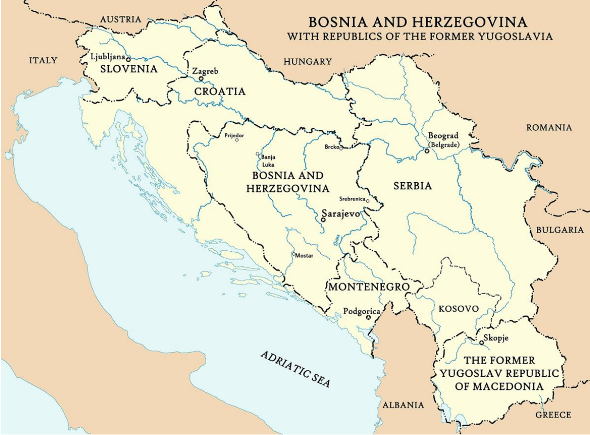
Map of Bosnia and Herzegovina