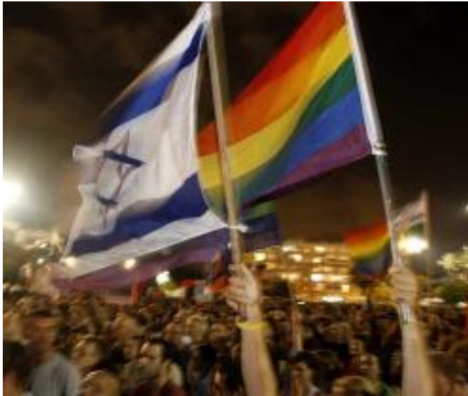
Figure 6: An LGBTQ flag and an Israeli national flag side-by-side at the memorial event for two teenagers killed at an LGBTQ centre in Tel Aviv, 2009.