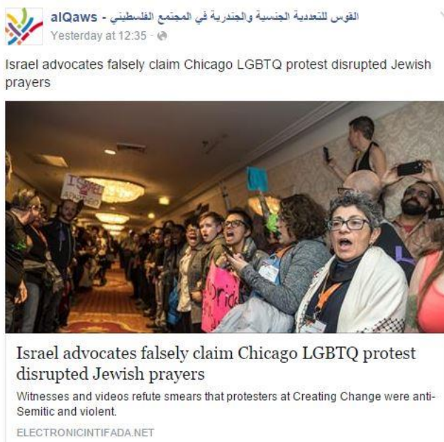
Figure 9: Al Qaws Facebook post sharing The Electronic Intifada 's article on allegations about the protestors.

JOH then launched a petition calling on the Taskforce to “uphold its inclusive values” and reinstate the event. 202 A Wider Bridge accused its critics of being “anti-Israel extremists,” guilty of “censorship.” 203 The Taskforce reinstated the event, but the reception came to an abrupt end when it was stormed by anti-‘pinkwashing’ protestors. These protestors were later accused of anti-Semitism, for example because they chanted “Palestine will be free from the river to the sea.” 204 Others said that this was just an example of critics of “a Jewish ethnocratic state that treats Jews differently than its other inhabitants” being falsely labelled as anti-Semitic. 205 Meanwhile, Palestinian activists criticised the Jewish Telegraphic Agency and StandWithUs for claiming that the protestors had disrupted a Jewish prayer service rather than “a reception held for Israel lobby groups.” 206