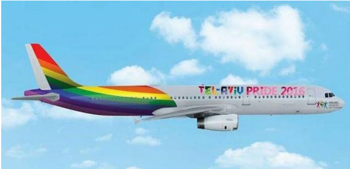
Figure 7: A Tourism Ministry drawing of the plane it planned to decorate for the Tel Aviv Pride Parade 2016.

of hasbara, 182 meaning that the LGBTQ community should stop collaborating with the Israeli state's efforts to promote a positive image of Israel abroad. 183 The Israeli government's response appears to have been to cut the international promotion budget, rather than increase the money given to LGBTQ organisations. 184