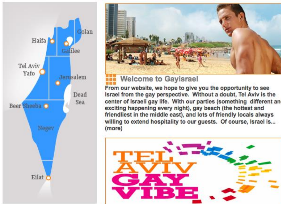
Figure 3: Advert for ‘Gay Israel’ taken from a website run by the Israeli Tourism Ministry and the Israeli National LGBT Taskforce (HaAguda). The Electronic Intifada criticised the advert because the map fails to show the distinction between the State of Israel on the one hand and the Palestinian territories and the Golan on the other hand.