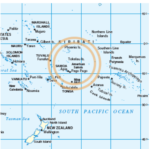
Figure 1: Map of Tokelau

Tokelau is one of the seventeen non self-governing territories recognized by the UN and the second smallest territory on list. The administering country of Tokelau is New Zealand, which is also the administering country of the Cook Islands and Niue. However, the Cook Islands and Niue are already in free association with New Zealand and not on the UN list any more. Tokelau is part of New Zealand since 1926, administered under the Tokelau Act in 1948. In 1949, Tokelauans became official citizens of New Zealand, which meant that they were free to move there if they wanted to do so. <sup>50</sup> The development of Tokelau has not been very remarkable and for the most part non-interventionist.