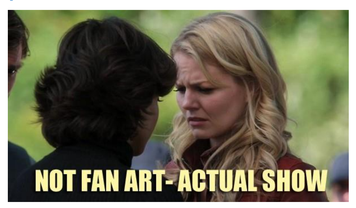
Figure 7: <sup>131</sup>