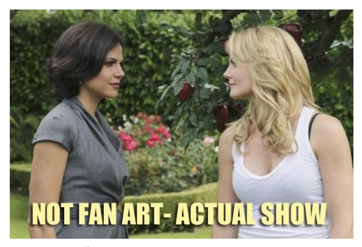
Figure 6: Source: TV.com<sup>130</sup>