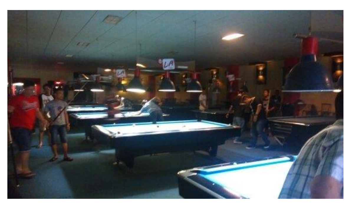
Figure 2 The rear part of Pool Worlds' ground floor on a rather quiet afternoon

The ground floor contains fifteen pool tables, that are numbered accordingly, and one carom table, on which another form of cue sport is being practiced (Figure 2). The owner of the club was often to be found at that table because he enjoys the game. Of these fifteen tables, fourteen are perfectly lined up next to each other, seven on each side of the room. The first pool table that could be found on the right (table number two), after the carom table, is the most difficult table in the room because it has very tight pockets, they are a lot smaller than all other tables. The fifteenth pool table was located across from the cashier and was separated from the other tables. This was the practice and match table where most gambling took place. It can be considered to be the main stage. So, the first thing I always did during fieldwork was checking table fifteen to see what was going on that day. All regular players would play on the tables closest to the cashier.