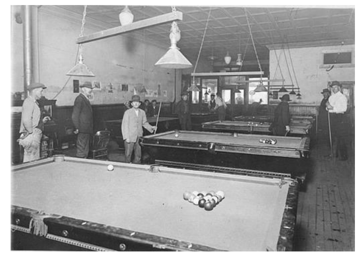
Figure 4 A poolroom with pocket billiard tables (Burch 2016)

Pocket billiard games were "after World War II largely consigned to seedy gambling joints" (Ibid.). Pool used to mean a collective bet, or ante (Shamos 2005: 3). Other games such as poker and horse racing were involved with 'pool betting'. A poolroom was a place where people would bet and were mainly known as "a betting parlor for horse racing" where often pocket billiards tables were present to play on in between the races. It was later that pocket billiards was attached to the word pool or poolroom.