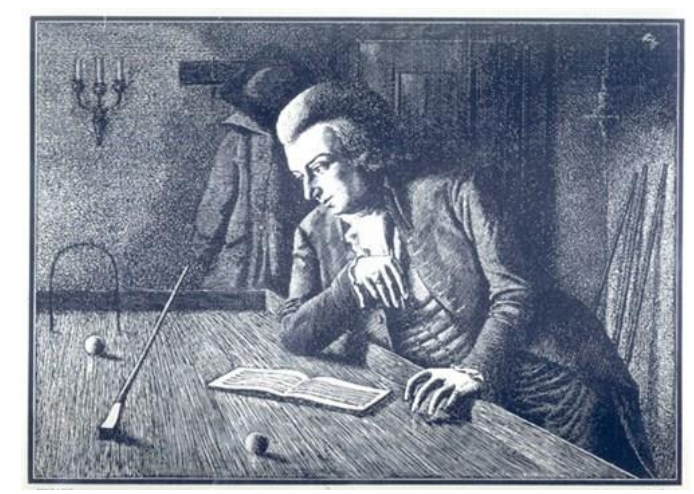
Figure 3 Indoor ground billiards table (Burch 2016)

The game spread from France to Germany, England, Italy and Spain. It gained great popularity in England and even made Shakespeare refer to it in his play of Anthony and Cleopatra in the second act, scene 5, where Cleopatra proclaims "Let us Billiards" (Phelan 1850: 6). Via France and England the game passed over to America and became the