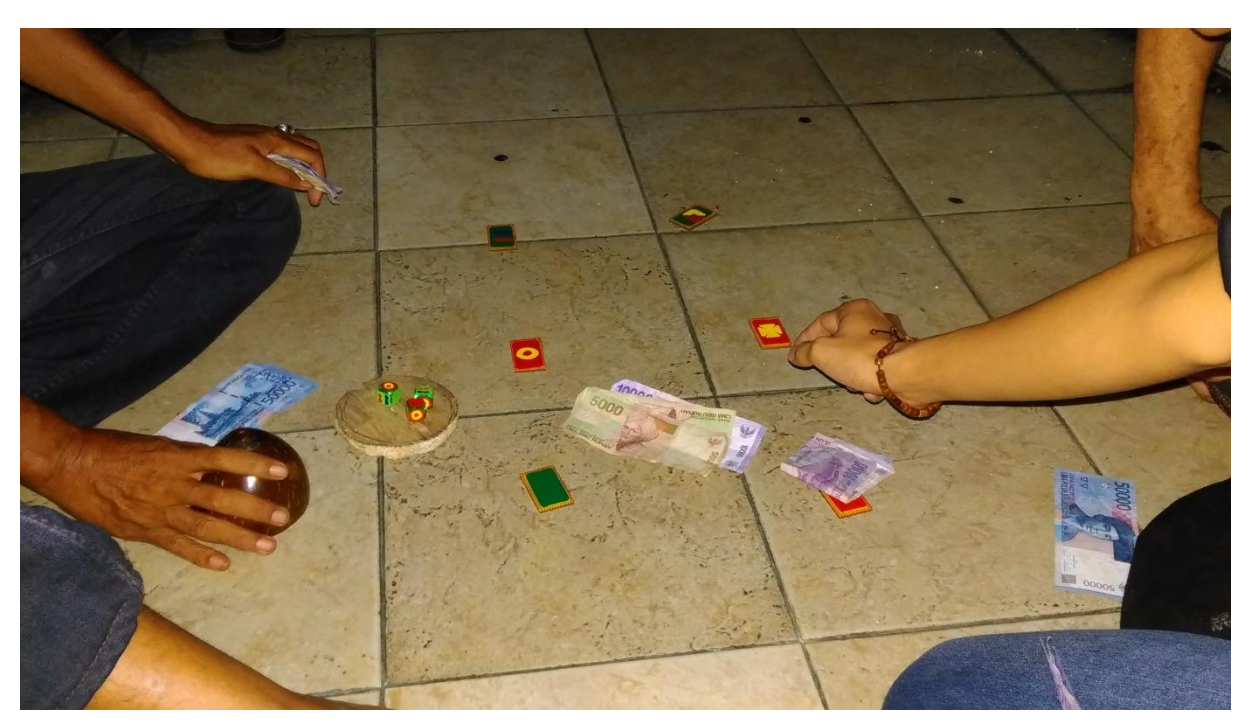
Figure 5 Outside on the balcony of the top floor of Pool World the dice game was explained to me

where they went. I assumed they just went home but they would often sit on the top floor in the locker room of the staff to play dice. They would also sometimes sit on the balcony outside the locker room (Figure 5) but when the third floor was open to public in the weekend to play pool they would sometimes go to the balcony to smoke or to go to the toilet. In the weekends they therefore play inside the locker room where others cannot see them play. They did not want other people, from outside, to know that such games were being played upstairs. This meant I became a trusted member of the regular pool players in Pool World. The owner knows about the small casino and is fine with it as long as it does not creates problems.