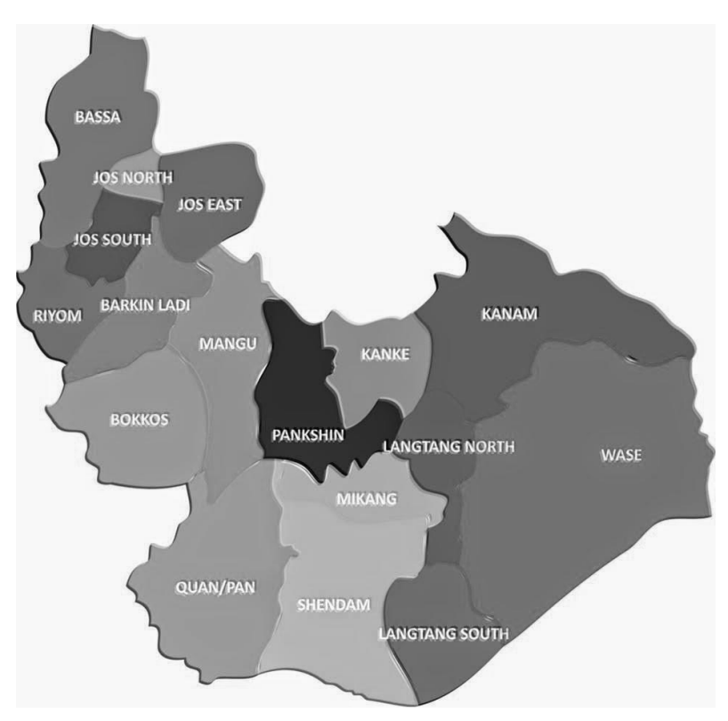
Figure 1.1: Local Government Areas in Plateau State, Middle Belt, Nigeria (Viewpoint Nigeria, 2017). Accessed June 28, 2018, [Online] https://viewpointnigeria.com/plateau-local-government-commission-plans-mass-redeployment-staff/