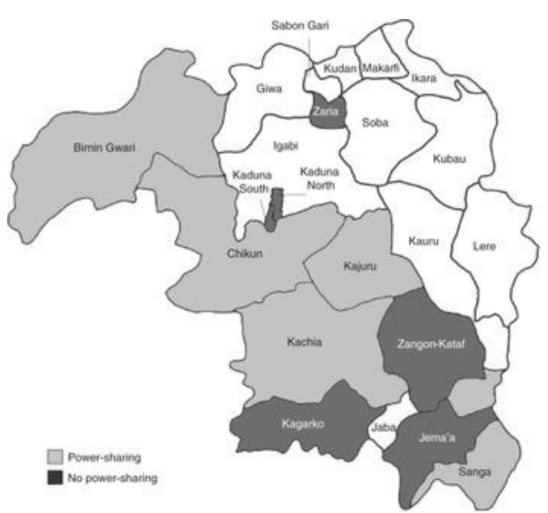
Figure 1.2: Local Government Areas in Kaduna State, Middle Belt, Nigeria, (Vinson, 2017). Accessed June 28, 2018, [Online] https://www.cambridge.org/core/books/religion-violence-and-local-powersharing-in-nigeria.