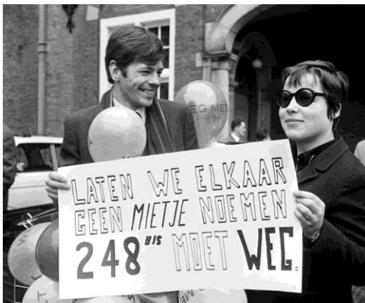
Figure 1 - A protest against Article 248bis on 21 January 1969.