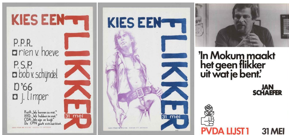
Figure 2 - Three posters calling for the election of homosexuals in Dutch elections in 1979.

The period started with the economic crisis of the early 1970s, which also led the Dutch government to restrict labour migration in 1974. 225 The governments of this period consisted mainly of confessional parties, but several coalitions were made with the liberal VVD and the progressive liberal D66. These parties were clearly more progressive on social issues.