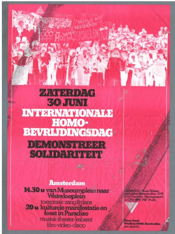
Figure 4 - A call for joining the International Gay Solidarity Day in 1979.

information in the article was -not surprisingly- from the Pink Front. 330 However, the presence of a large group of specifically homosexual refugees from Iran is not confirmed in other sources. The newspaper Trouw ran an article which mentioned five homosexual men who requested refugee status in September 1979. 331