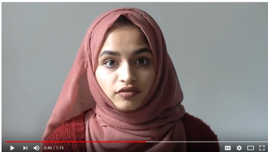
Vote remain for their future

The OB Facebook page also has limited SA Muslim diasporic representation with only 16 images showing individuals of presumable SA Muslim heritage, equating to only 7% of the 227 images. In a similar way to the VL campaign, most of these images are collages containing photos of campaigners throughout the country, meaning that the Muslim individual is often represented as a token ethnic minority among a sea of white Brits. However, the OB campaign includes definitively more Muslim individuals in these collages than the opposition campaign. Moreover, 2 of these 16 photos exclusively show members of the SA Muslim diasporas. The first presents a young Muslim woman with two males,