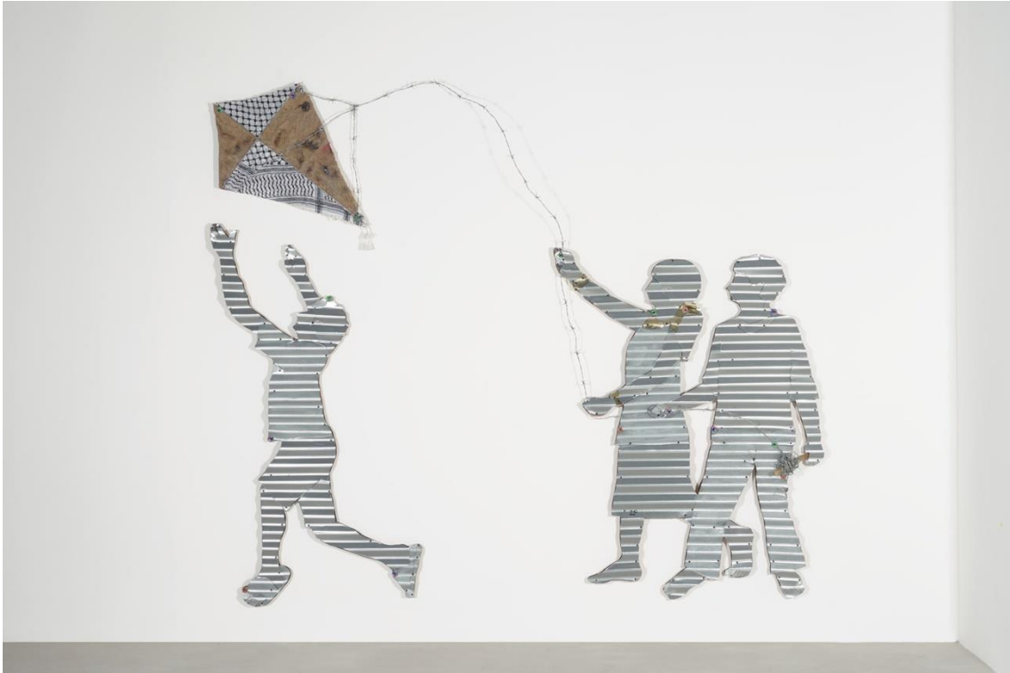
Katanani, A. 2012 Zinc, barbed wire and freedom . Beirut: Agial Gallery