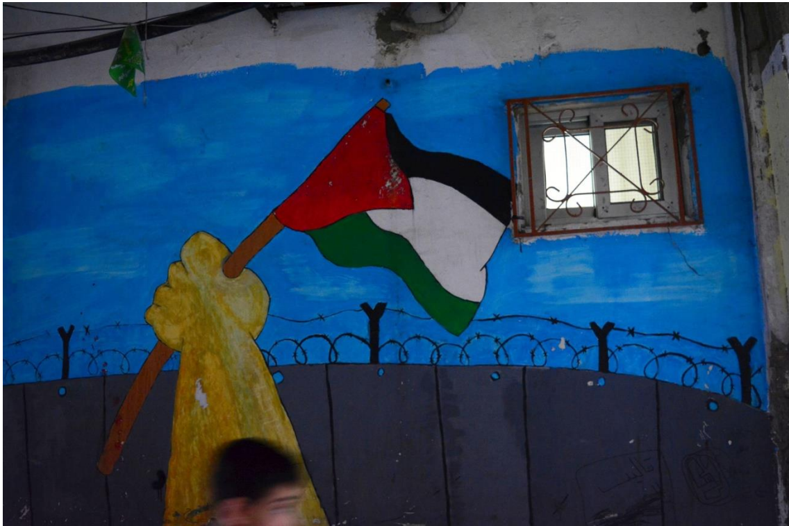
Vidal, M.arta 2017. A wall painted on the wall: a mural in Burj al-Barajneh depicts the separation wall in the West Bank. Beirut.

As we will see next, however, their actions are not unique: the walls of Palestinian camps across Lebanon are full of graffiti and murals with various messages and claims. The next chapter will focus on the different symbols and meanings of street art in the Palestinian refugee camps of Burj al-Barajneh, Shatila and Beddawi. By examining the most common imagery on the walls of the refugee camps, it will be shown how street art can be both a demand for public space and an assertion of collective identity.