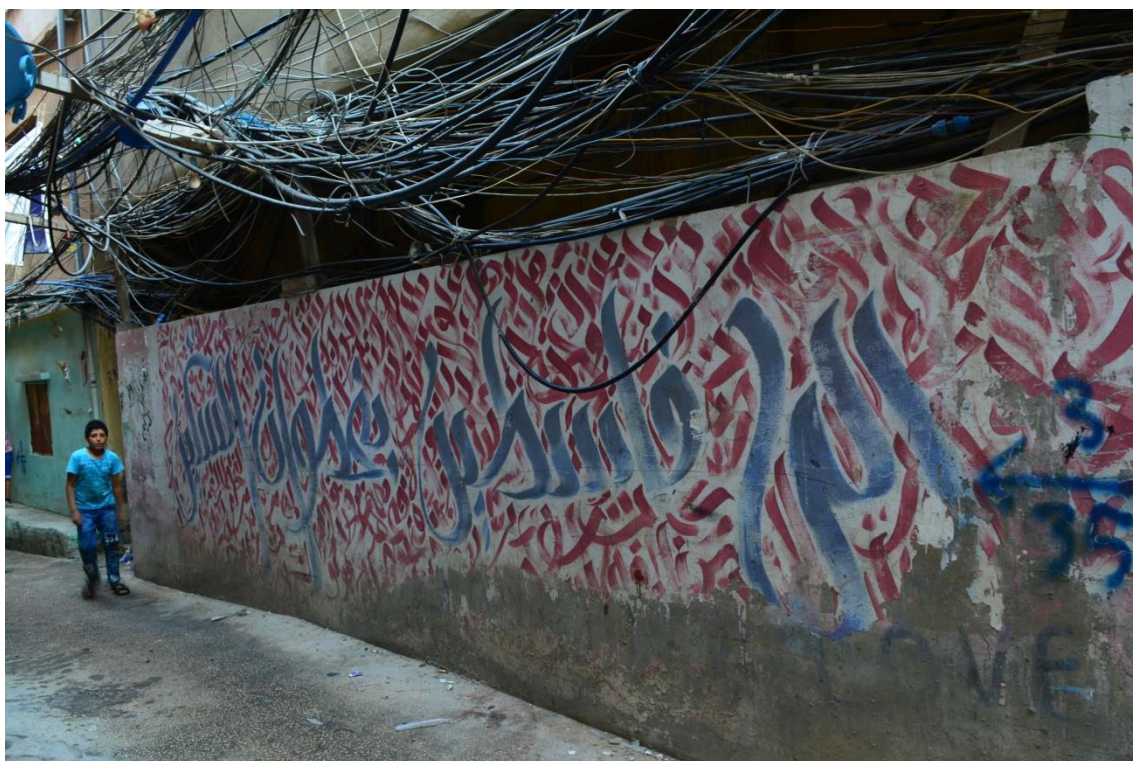
Vidal, Marta. 2017 "Calligraffiti" mural painted on the walls of Burj al-Barajneh. Beirut : Middle East Eye