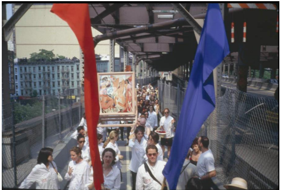
Figure 8: Francis Alÿs and the MoMA, The Modern Procession crossing the Queensboro Bridge, 2002.

a socially engaging performance. Alÿs believes the procession 'for its reverent nature and collective power' could be 'a relevant vehicle' to mourn and reflect on the terrorist attack on the Twin Towers; however, I have found no proof that the Modern Procession has a function like this. There is the possibility that the participants of the procession could have seen the missing Twin Towers while crossing the