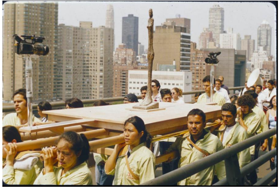
Figure 7: Francis Alÿs and the MoMA, The Modern Procession , (Focus: Brancusi's Standing Woman ), 2002

The other volunteers were invited by members of the museum through word of mouth. However, Alÿs, Eccles, and Montgomery did wish to keep the group diverse. The first concept for the group of volunteers consisted of 95% white women, and to the team, that group did not represent the city in any form. 68 Where the procession itself was an illustration of the museum's modern collection, it should also be an embodiment of New York's diverse