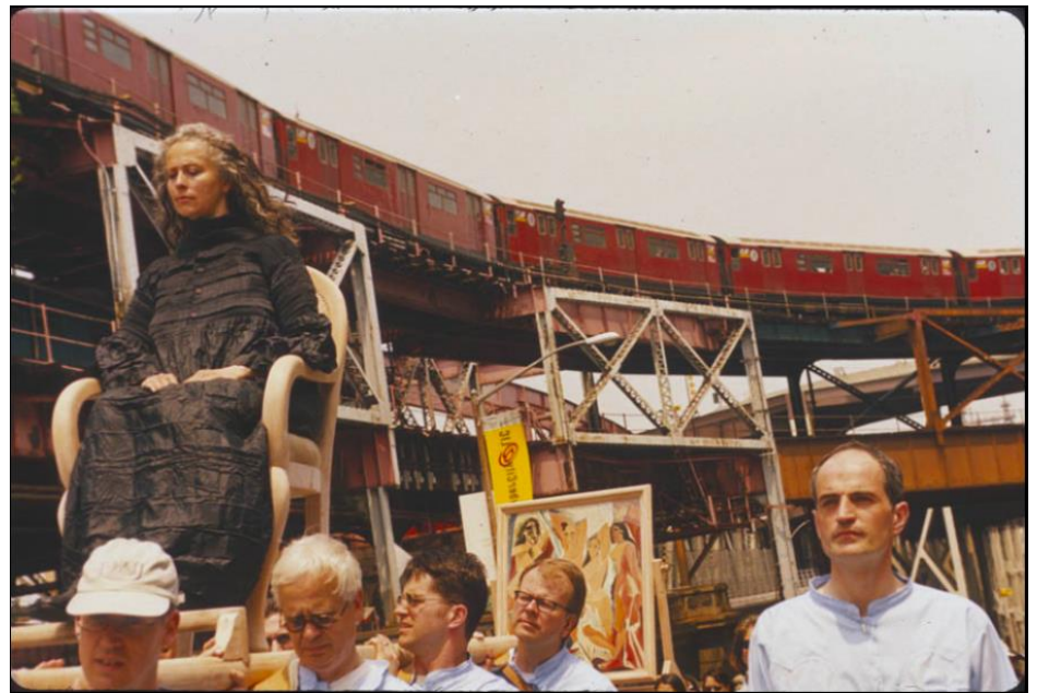
Figure 6: Francis Alÿs and the MoMA, The Modern Procession , (Focus: artist Kiki Smith and Les Demoiselles d'Avignon ), 2002.

The choice for Bicycle Wheel was because Duchamp as an artist was strongly connected to