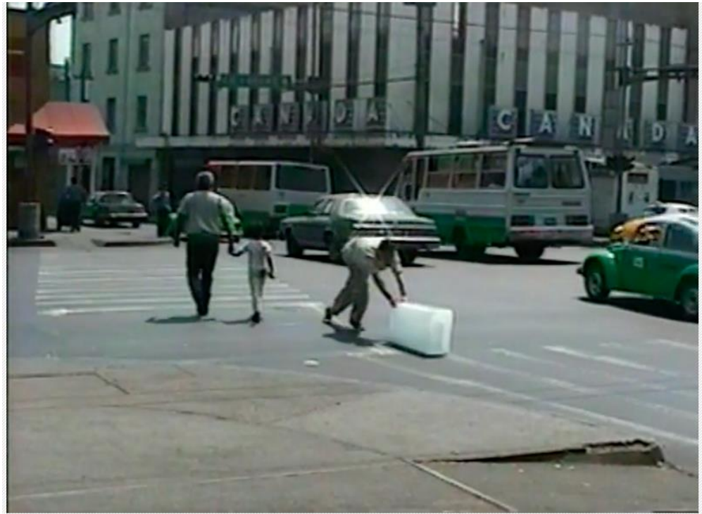
Figure 5: Francis Alÿs, Sometimes Making Something Leads to Nothing , 1997.

ice for nine hours through the streets of Mexico City. 29 At the end, the block has melted to the size of a little ball that he can kick through the street. In Re-enactments (2000), Francis Alÿs walked the streets of Mexico City visibly carrying a gun, while he is being filmed. 30 After eleven minutes of the performance, people come to arrest the artist. The next day, Alÿs repeated the action, now with permission of the police. Of course, one person can