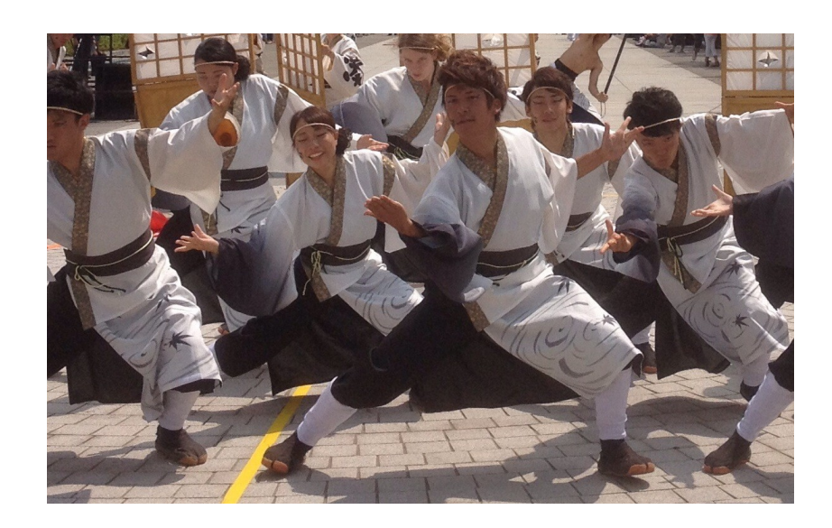
Figure 1.1: The opening move of yomihana's otoko-furi.

In the first picture the opening move is visible. From the moment it starts the dancer pulls in his limbs and then strikes this pose. The dancer has his weight on his left foot while the right foot is stretched. The right arm is bent and stuck out in front of the upper body. The left arm is in the same position in the side. The upper body is slightly tilting towards the front. The chin is lowered and the eyes are glaring towards the audience.