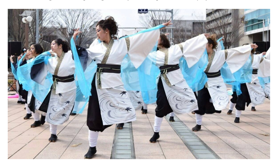
Figure 3.1: Opening move of the veil part.

Within yomihana there is an extra selection part for onna-furi . This is a part that not all dancers dance. For every performance a new selection is being chosen. Again, I have isolated three different movements.