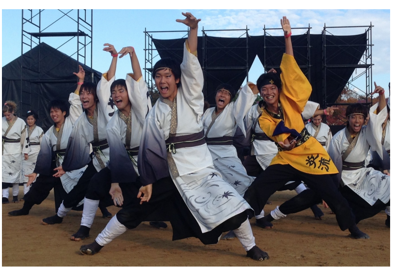
Figure 1.2: The middle-move of otoko-furi.

In the first picture the opening move is visible. From the moment it starts the dancer pulls in his limbs and then strikes this pose. The dancer has his weight on his left foot while the right foot is stretched. The right arm is bent and stuck out in front of the upper body. The left arm is in the same position in the side. The upper body is slightly tilting towards the front. The chin is lowered and the eyes are glaring towards the audience.