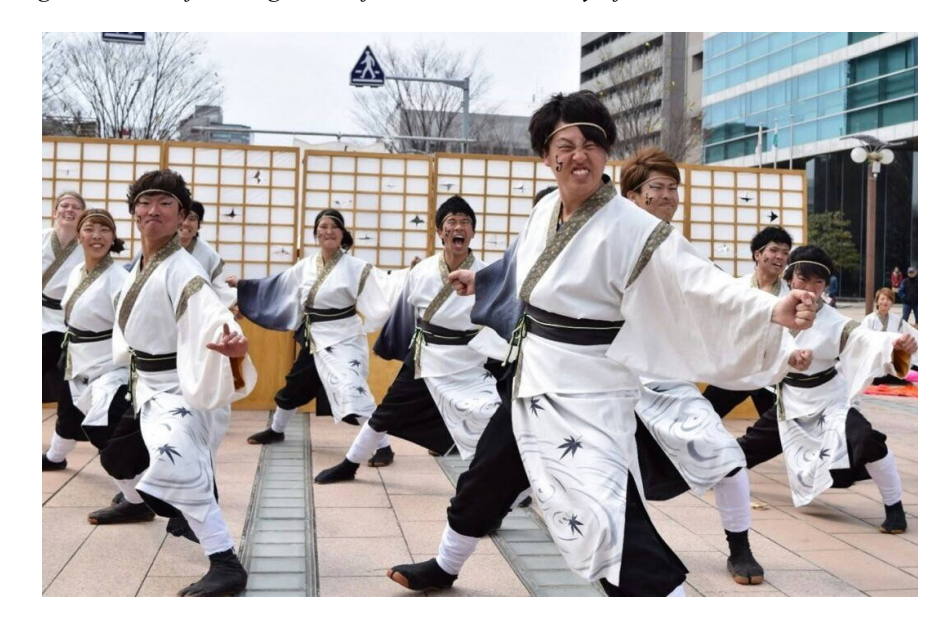
Figure 1.3: The finishing move of otoko-furi.

In the third the finishing move is pictured. The dancer jumps in the air and then lands on this position. The body weight is again put on the left leg. The hips are lowered. Both arms have strength within them, and the feet are flat. The hands are balled to fists. In addition the dancer's jaw is aggressively heightened while looking with the face held straight towards the audience.