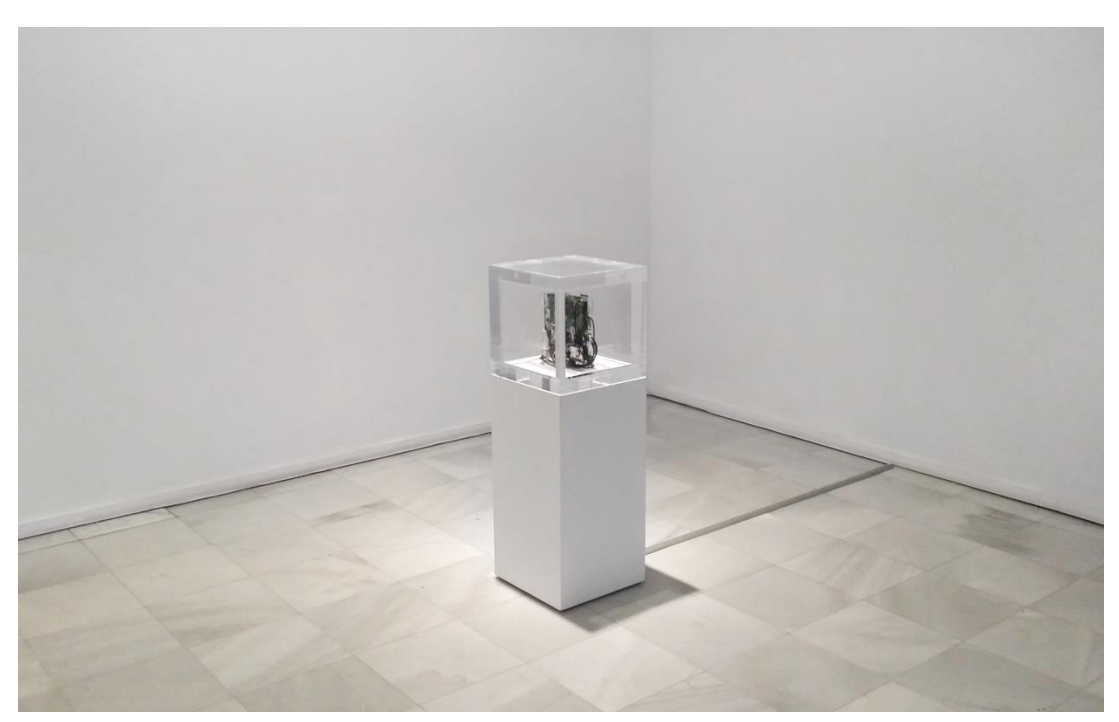
Fig. 2: Trevor Paglen, Jacob Appelbaum, Autonomy Cube, 2014, Plexiglas box with computer components. Photo: <<u>http://paglen.com/img/madrid1.jpg</u>> (accessed 26 June 2017).