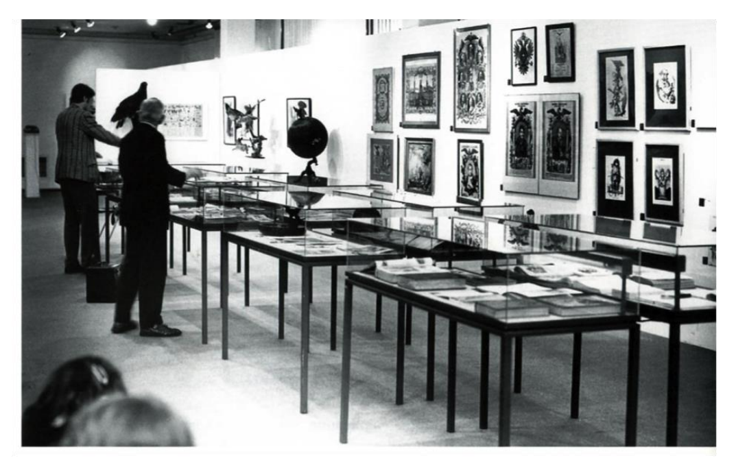
Fig. 3: Marcel Broodthaers, Musée d'Art Moderne, Département des Aigles, Section des Figures , 1972, mixed media, Brussels, © Marcel Broodthaers. Photo: <<u>http://laboratoirefig.fr/wp-</u> <u>content/uploads/2016/04/Imagen3.png</u>> (accessed 26 June 2017).