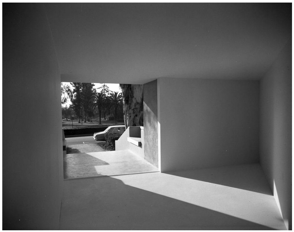
Fig. 4: Michael Asher, Installation , 1970, viewing out of gallery toward street from small triangular area, Pomona College Museum of Art, © Michael Asher, photograph courtesy of the Frank J. Thomas Archives. Photo: <<u>https://www.pomona.edu/museum/sites/museum.pomona.edu/files/images/exhibitions/hal-glicksman-ss-4.jpg</u>> (accessed 26 June 2017).