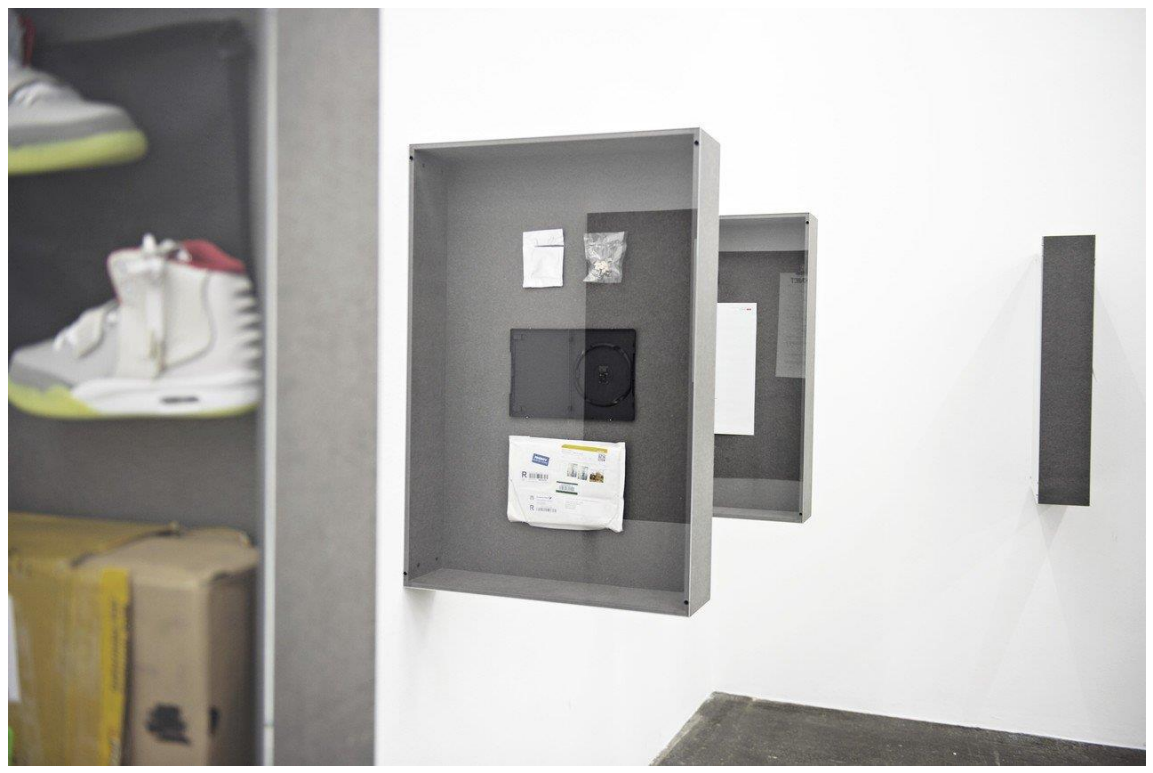
Fig. 6: !Mediengruppe Bitnik, Random Darknet Shopper , 2014, mixed media, Kunst Halle Sankt Gallen, St. Gallen, © !Mediengruppe Bitnik. Photo: