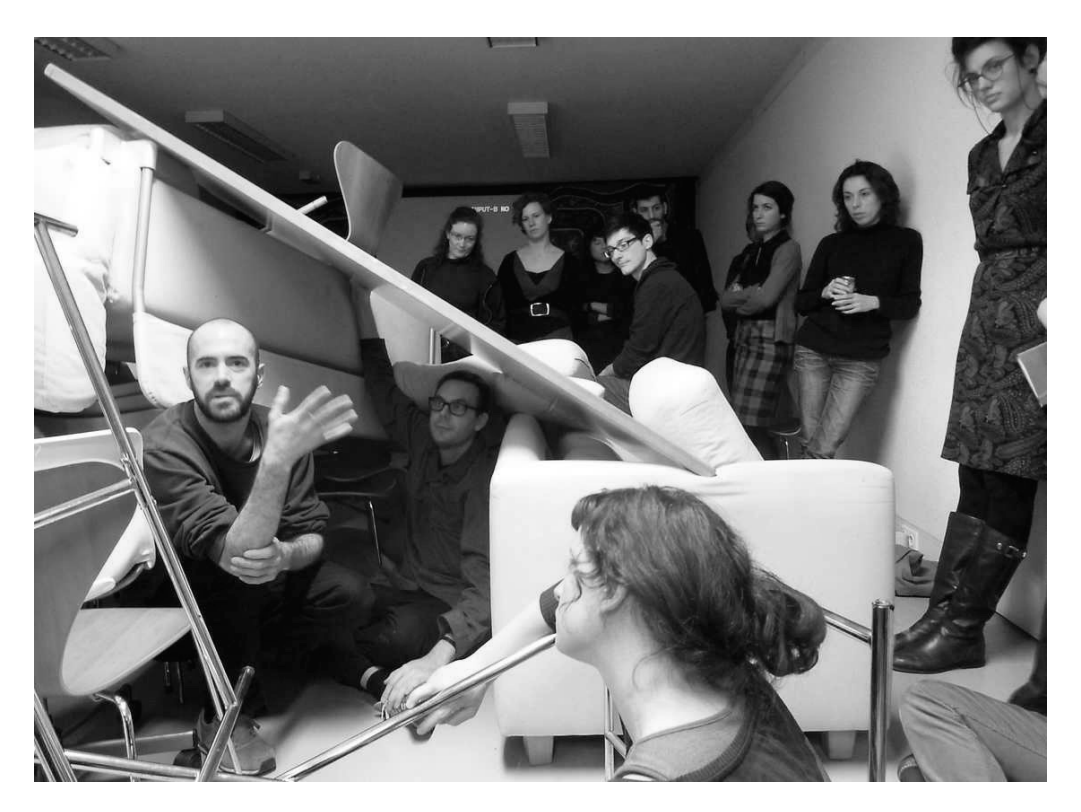
Noise and Capitalism: Zombies at DAI

Does He Cut it? Accordingly Mattin's pursuit of subject-less-ness in his mission to redistribute labour equally in a performance follows Brassier's argument in that he too precludes noise as a vehicle to reach a subject-less state. For both, th idealistic person who is not invested in capitalising on their role (in a noise performance) is perhaps less prone to commodification or closer to Brassier's "communist subject".<sup>135</sup>