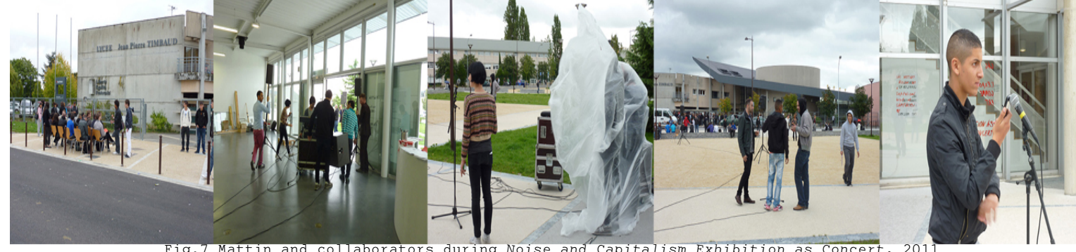
Fig.7 Mattin and collaborators during Noise and Capitalism Exhibition as Concert, 2011 (brief caption).

The Noise and Capitalism Exhibition as Concert project at CAC Brétigny is based on a publication of the same title, edited by Mattin and writer Antony Isles. The concert exhibition aimed to act out the book's content or ideals