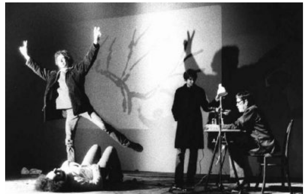
The Pursuit of Anti-Harmonic Structures

As the current global state of financial crisis ensues, next to unions, we are each cast as agents of the regimes. It remains up to us, as engagers of art, and our ability to self-organise, through unions in Deleuze's case, but perhaps also through the forms of resistance conceived of within artistic practice, and in this instance particularly, through subversive music practices.