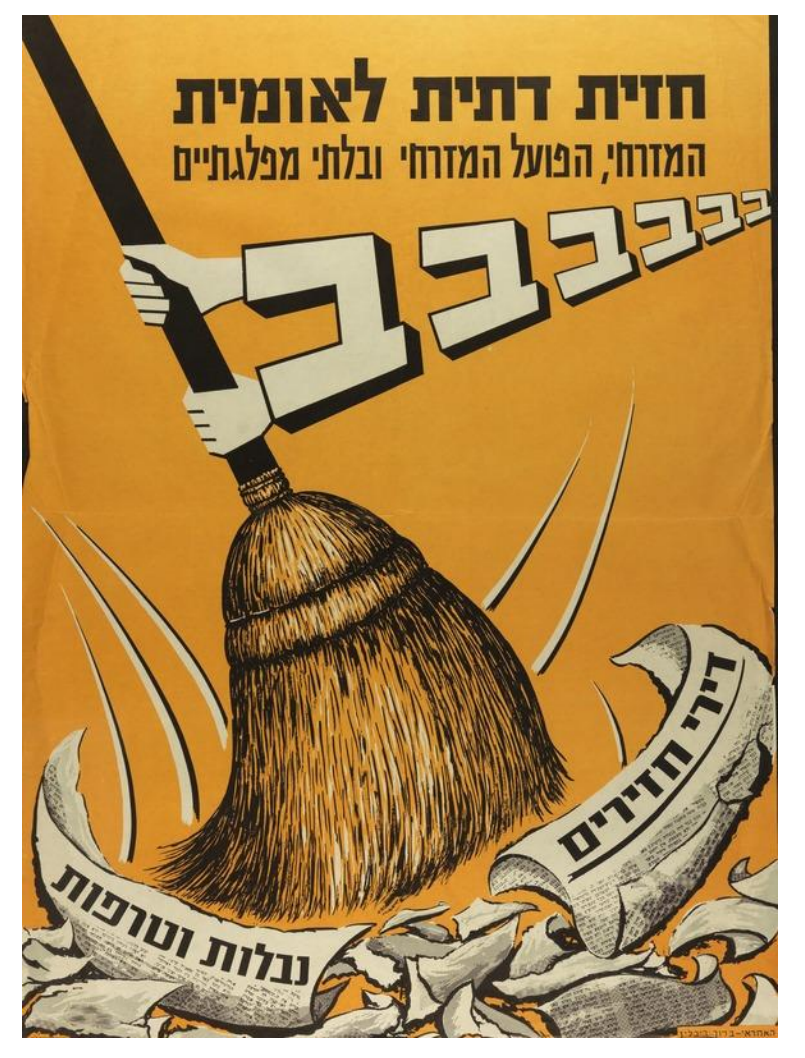
National Religious Party

HaMizrahi, HaPo'el HaMizrahi, and unaffiliated<sup>5</sup>