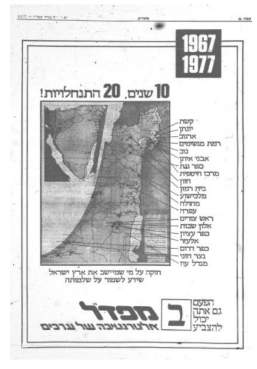
Image 3: 10 Years. 20 Settlements! [Advertisement]. (National Religious Party, 1977b)