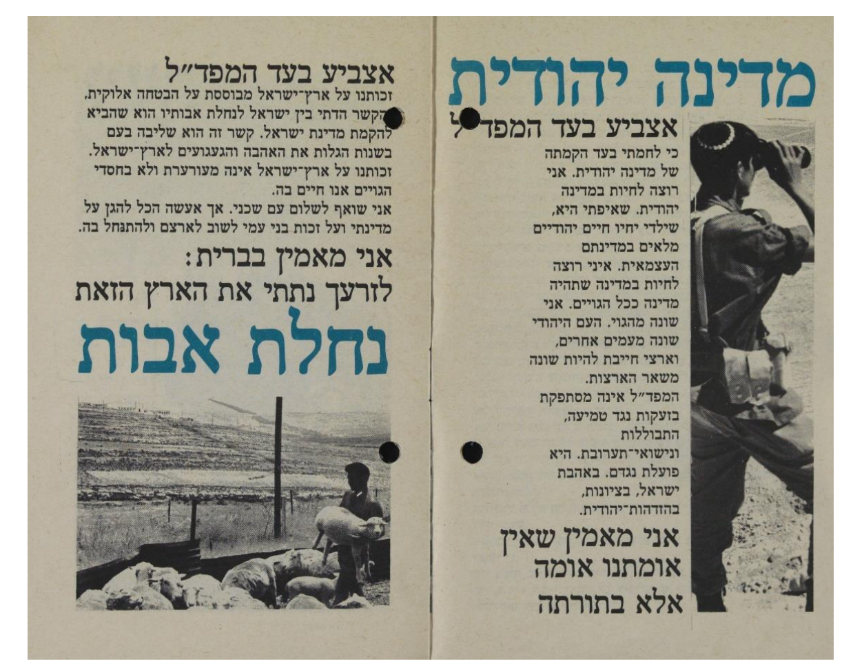
Image 2: A Jewish State [Advertisement] (National Religious Party, 1977a)

[scrap left:] Villainy and Non-kosher [food]