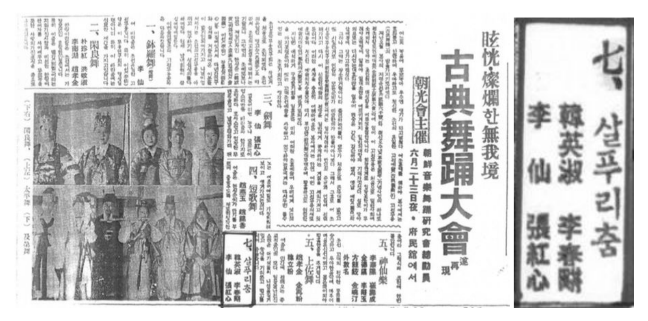
Figure 1.1. First appearance of salpuri-chum , performed by Han Sung-Jun; detail of outlined text - right side from top to bottom "살平리춤" ( salpuri-chum ).<sup>3</sup>