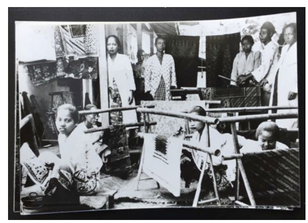
Fig. 16: Recto: First of three photographs glued on each other. All of them: b&w photographs, paper, 12.9 x 8.8 cm, without further information.

Descriptive information on the photograph's backside: "Neg. 23/74, Pembuatan Batik di Yogya" (English: Batik Making in Yogya).