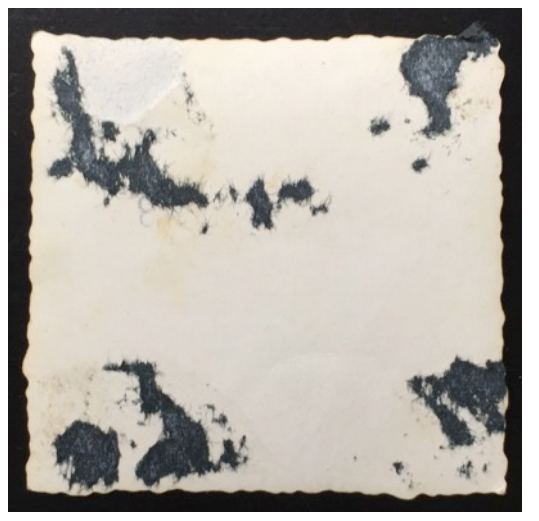
Fig. 6: Verso: Portrait of sleeping Person, b&w photograph, 5.5 x 5.5 cm, glue residues in every corner, without further information.