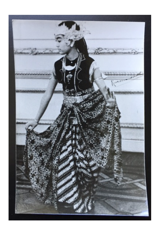
Fig.41: Photograph from the perfume box

Recto: Full Body Portrait of a Dancer, b&w photograph, paper, 12.9 \times 8.8 \text{ cm} , without further information. Verso: Full Body Portrait of a Dancer, b&w photograph, paper, 12.9 \times 8.8 \text{ cm} , without further information. Descriptive information on the photograph's backside: