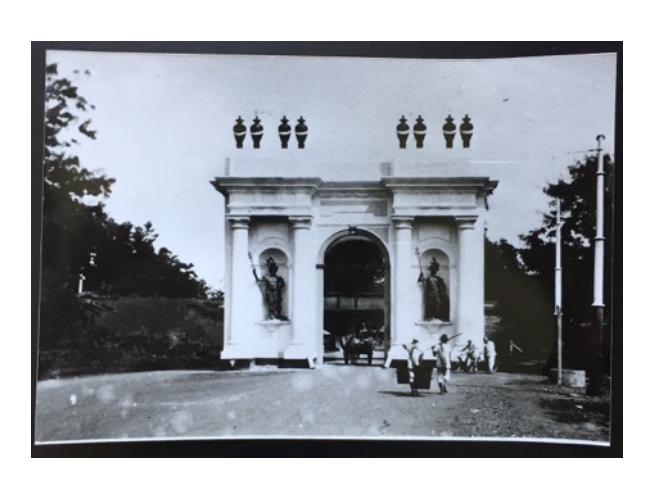
Fig. 24: Recto: View on an entrance, b&w photograph, paper, 12.9 x 8.8 cm, without further information.

Verso: Landscape, b&w photograph, paper, 12.9 x 8.8 cm, without further information. Descriptive information on the photograph's backside: "Neg. 32/42. Java Timur Vulkano" (English: Jawa Timur Vulkano) >> Today: Ijen Vulcano in Java.