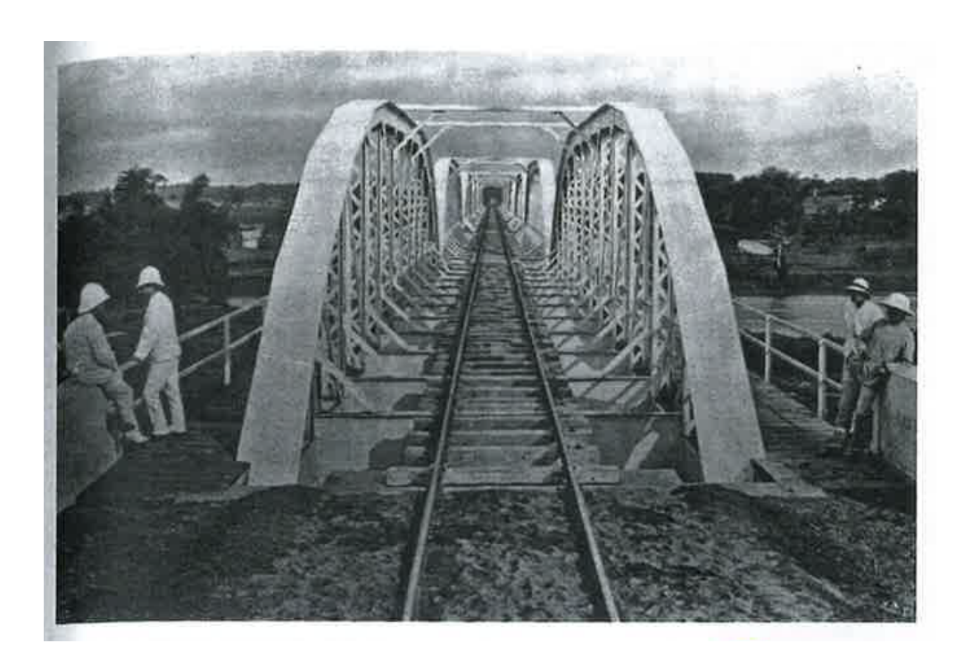
Fig. 44: Dead-Center: A Bridge Near Surakarta, Central Java, c. 1915, without further information. In: Pemberton, 'The Ghost in the Machine', p. 47.