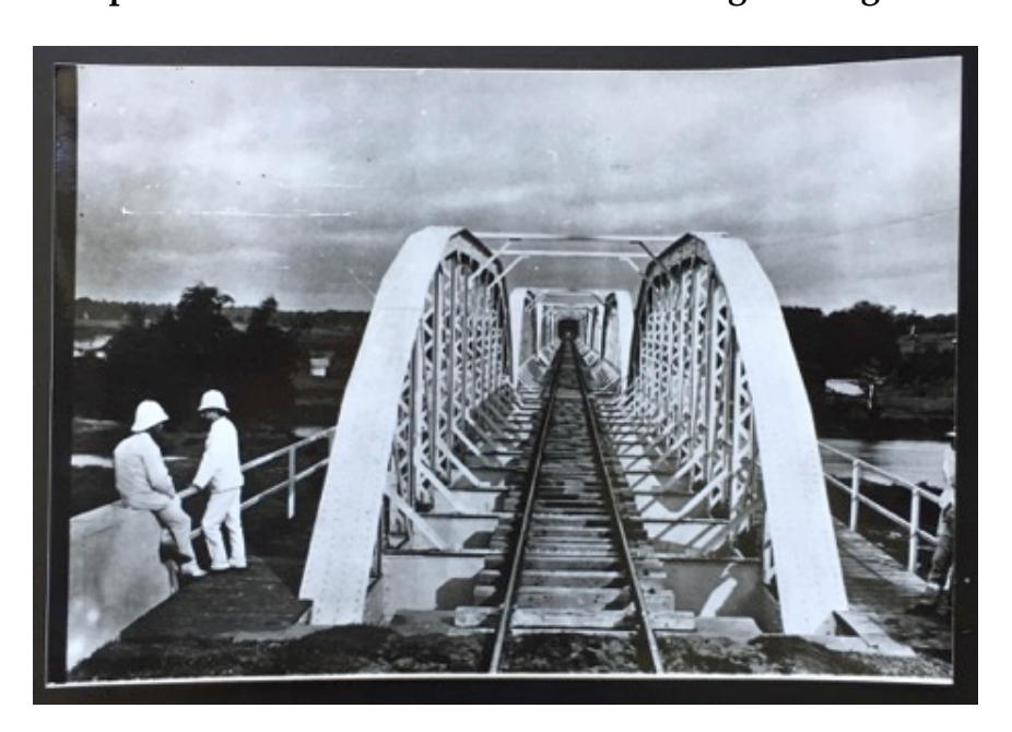
Fig. 43: Photograph in perfume box

Recto: View on Railway and Bridge, b&w photograph, paper, 12.9 \times 8.8 cm, without further information.