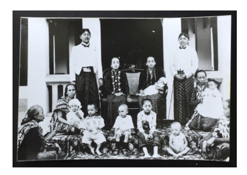
Fig. 39: Photograph from the perfume box

Recto: Outdoor Group Portrait, b&w photograph, paper, 12.8 x 8.8 cm, without further information.