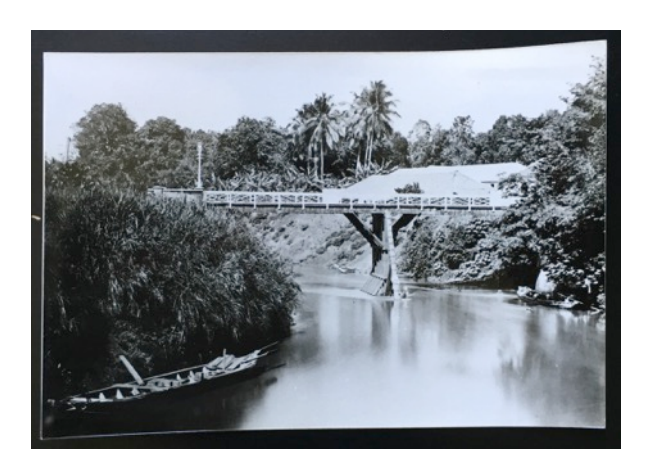
Fig. 47: Recto: View on bridge and river, b&w photograph, paper, 12.9 x 8.8 cm, without further information.

Verso: View on Railway in Landscape, b&w photograph, paper, 12.9 x 8.8 cm, without further information. Descriptive information on the photograph's backside: "Neg. 23/40. Ree te Soekaboemi"