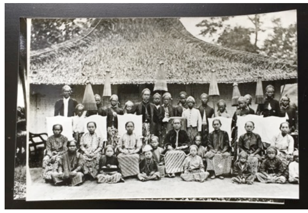
Fig. 14: Recto: Two photographs glued on each other. Both: b&w photographs, papers, 12.9 \times 8.8 cm, without further information.