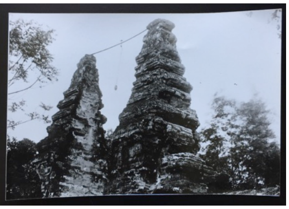
Fig. 21: Recto: View on Temple, b&w photograph, paper, 12.9 x 8.8 cm, without further information.

Verso: on Temple b&w photograph, paper, 12.9