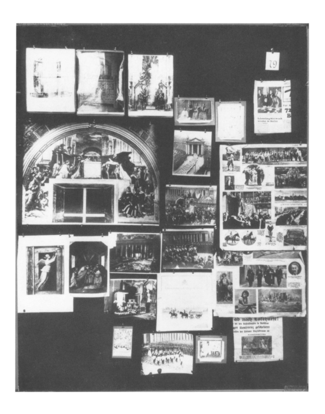
Fig. 30: Aby Warburg, Mnemosyne Atlas, Panel 79, in: Buchloh, 'Gerhard Richter's "Atlas", p. 126.