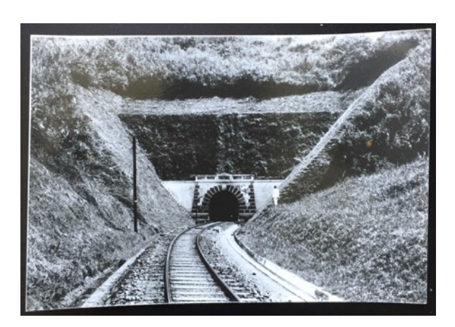
Fig. 45: Recto: Railway, b&w photograph, paper, 12.9 \times 8.8 cm, without further information. Verso: b&w photograph, paper, 12.9 \times 8.8 cm, without further information. Descriptive information on the photograph's backside: "Neg. 23/36. Leer Soekaboemi"