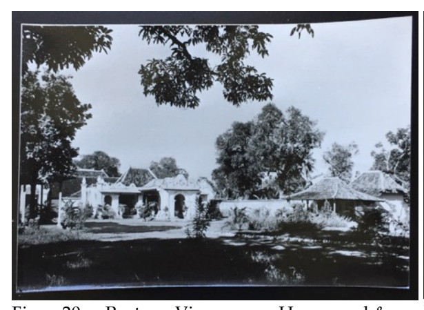
Fig. 20: Recto: View on Houses, b&w photograph, paper, 12.9 \times 8.8 cm, without further information.