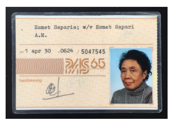
Fig. 53: No function to this card could be identified.