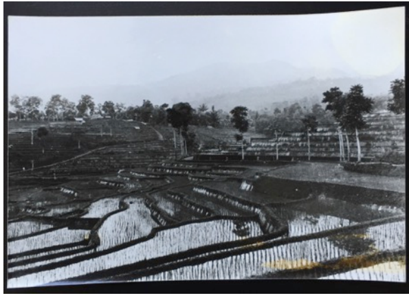
Fig. 19: Recto: Landscape, b&w photograph, paper, 12.9 x 8.8 cm, without further information.