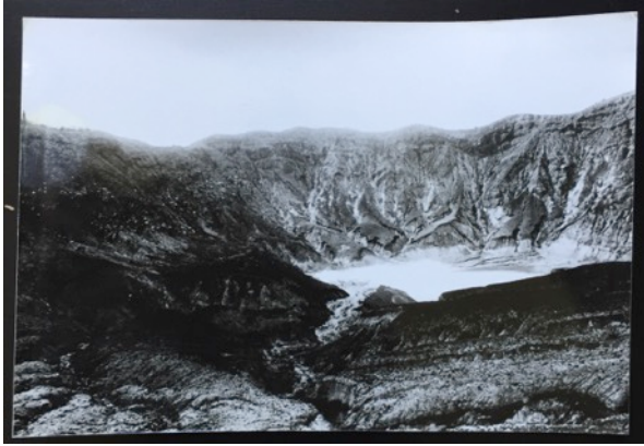
Fig. 22: Recto: View on an entrance? b&w photograph, paper, 12.9 x 8.8 cm, without further information. Verso: View on an entrance? b&w photograph, paper, 12.9 x 8.8 cm, without further information. Descriptive information on the photograph's backside: "Neg. 23/62. Tangerang" (English: Tangerang) >> City in Java (North East)