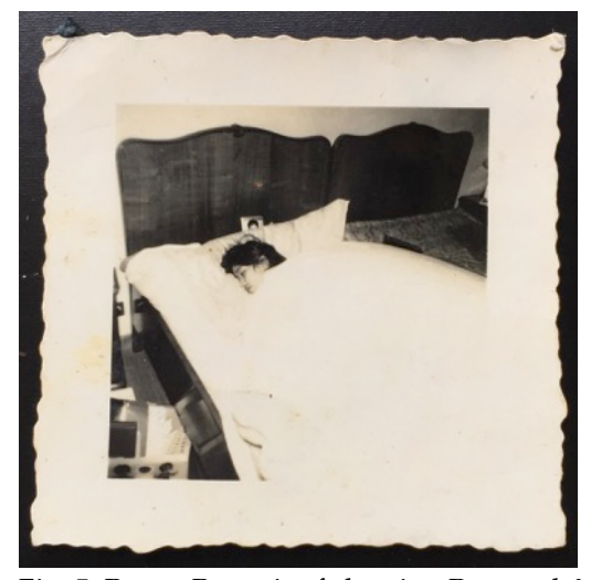
Fig. 5: Recto: Portrait of sleeping Person, b&w photograph, 5.5 x 5.5 cm, without further information.