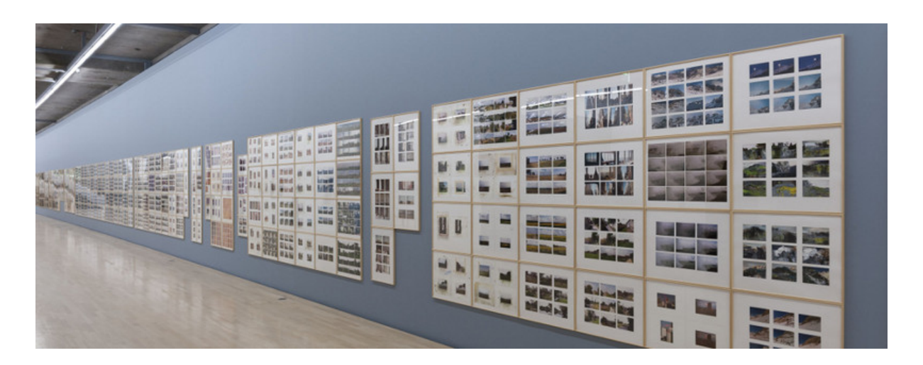
Fig. 27: Gerhard Richter, Atlas , Exhibition View at Lenbachhaus, Munich, Germany, 2013. Source: Lenbachhaus Munich Webstie, https://www.lenbachhaus.de/blog/gerhard-richters-atlas © Gerhard Richter