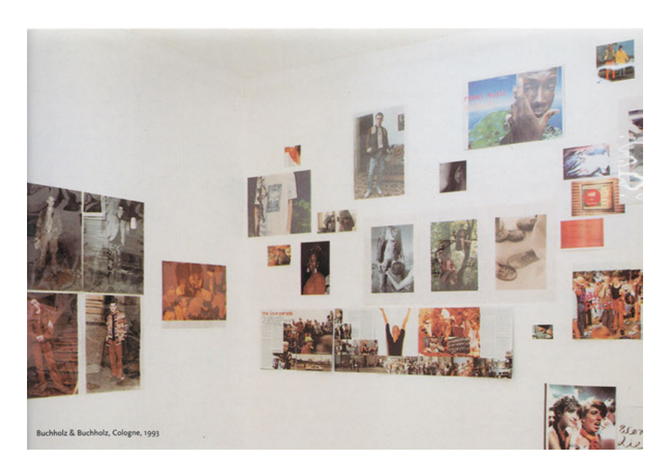
Fig. 32: Wolfgang Tillmans, Installation View Galerie Buchholz + Buchholz, Colonne, Germany, January 1993, In: Zanichelli, Privat - bitte eintreten! Rhetoriken des Privaten in der Kunst der 1990er Jahre , p. 226.