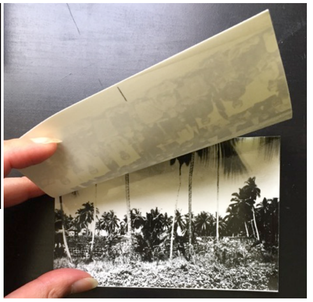
Fig. 15: Verso: Recto: Two photographs glued on each other. Both: b&w photographs, papers, 12.9 \times 8.8 cm, without further information.

Descriptive information on the photographs' backsides: