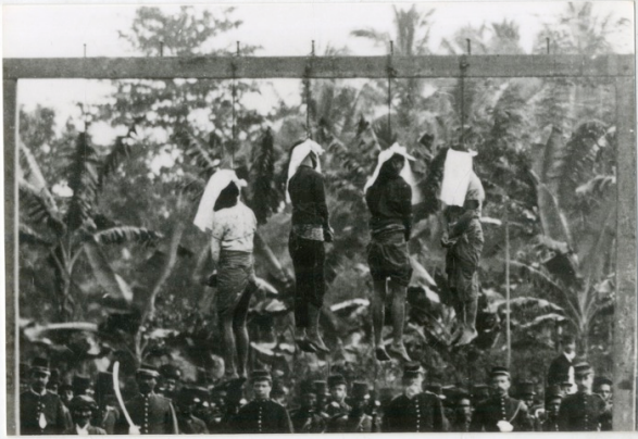
Fig. 25: Image recto, 8.9 x 12.9 cm, b&w photograph. The descriptive information on the back of the photograph says: "Neg. 24/36. Henrechtungs scene van 8 Reballen in Batavia".