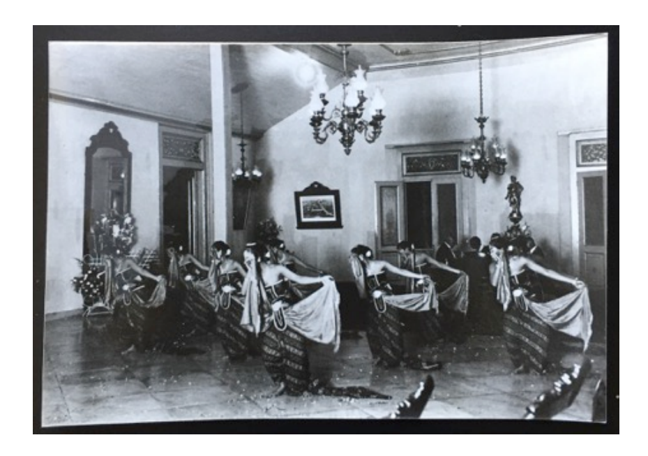
Fig. 37: Photograph from the perfume box

Recto: Indoor Group Portrait of Indonesian Traditional Dance, b&w photograph, paper, 12.9 \times 8.8 cm, without further information.