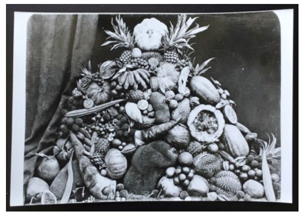
Fig. 18: Recto: Studio Fruit Still Life, b&w photograph, paper, 2.9 x 8.8 cm, without further information.

Descriptive information on the photograph's backside: "Neg. 23/38. Uneleatan Kereta Api di Priangan" (English: ... Railways in Priangan).