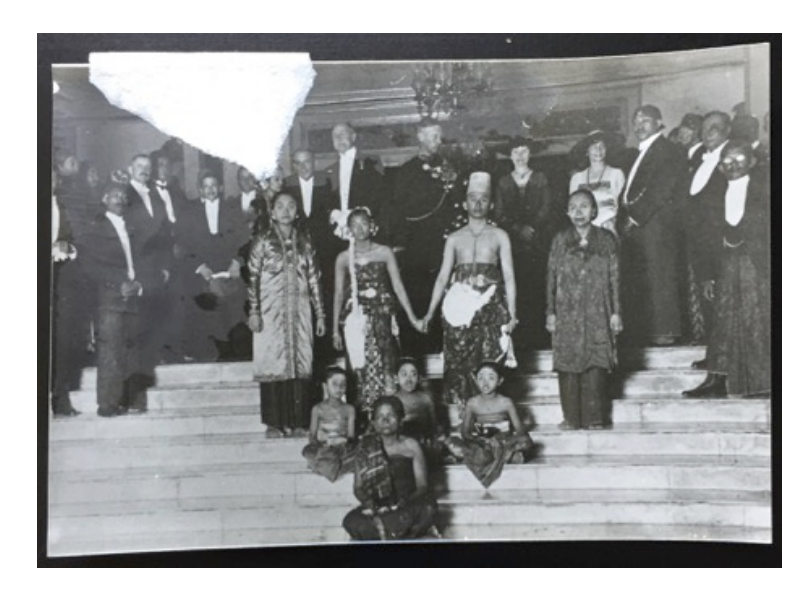
Fig. 35: Photograph from the perfume box Indoor Group Portrait, b&w photograph, paper, 12.9 x 8.8 cm, without further information. Verso: Indoor Group Portrait, b&w photograph, paper, 12.9 x 8.8 cm, without further information. Descriptive information on the photograph's backside: "Neg. 23/76, Perkawinan di" (English: Marriage in Solo).