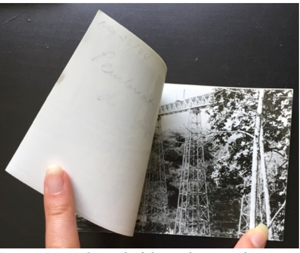
Fig. 17: Recto: Second of three photographs glued on each other. All of them: b&w photographs, paper, 12.9 x 8.8 cm, without further information.

Descriptive information on the photograph's backside: "Neg. 23/74, Pembuatan Batik di Yogya" (English: Batik Making in Yogya).