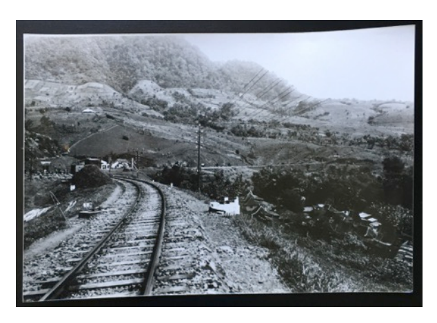
Fig. 46: Recto: View on Railway in Landscape, b&w photograph, paper, 12.9 x 8.8 cm, without further information.

Verso: View on Railway in Landscape, b&w photograph, paper, 12.9 x 8.8 cm, without further information. Descriptive information on the photograph's backside: "Neg. 23/40. Ree te Soekaboemi"