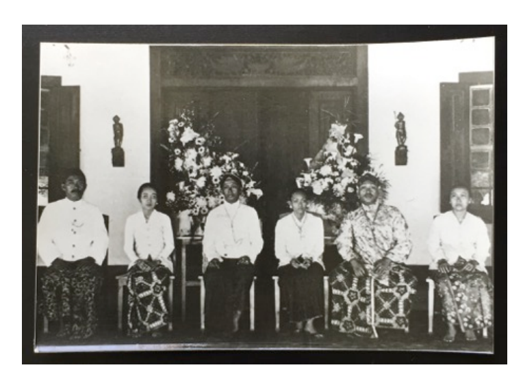
Fig. 33: Photograph from the perfume box

Recto: Indoor Group Portrait, b&w photograph, paper, 12.8 x 8.8 cm, without further information. Verso: Indoor Group Portrait, b&w photograph, paper, 12.8 x 8.8 cm, without further information. Descriptive information on the photograph's backside: "Neg. 23/78, Perkanrinan Mangka Negara" (English: Foreign Marriage).