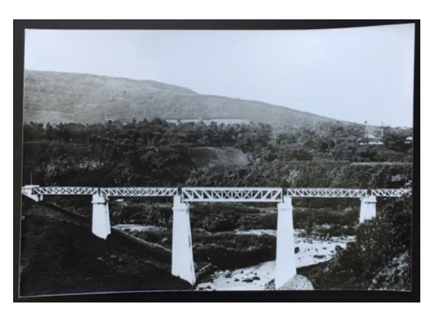
Fig. 48: Recto: Bridge, b&w photograph, paper, 12.9 x 8.8 cm, without further information. Verso: Bridge, b&w photograph, paper, 12.9 x 8.8 cm, without further information. Descriptive information on the photograph's backside: "Neg. 23/8. Eisenbahn bei Soekabomi" (English: Railway in Soekabomi).

Verso: View on bridge and river, b&w photograph, paper, 12.9 x 8.8 cm, without further information. Descriptive information on the photograph's backside: "Neg. 23/2. Jembatan di jatinegara (meester cornelis)" (English: Bridge in Jantinegara (Meester Cornelis).