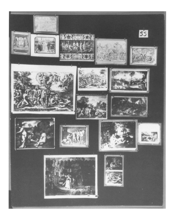
Fig. 29: Aby Warburg, Mnemosyne Atlas , Panel 55, 1928–29, in: Buchloh, 'Gerhard Richter's "Atlas"', p. 123.