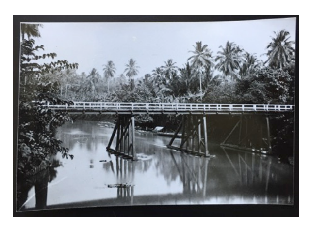
Fig. 49: Recto: Bridge, b&w photograph, paper, 12.9 x 8.8 cm, without further information. Verso: Bridge, b&w photograph, paper, 12.9 x 8.8 cm, without further information. Descriptive information on the photograph's backside: "Neg. 23/4. Bru. Matraman" (English: Bru. Matraman). >>> Bridge in Matraman.