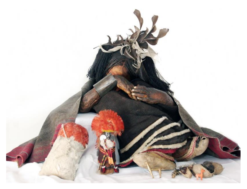
Fig. 6: The mummy of Sinchi Mount El Plomo.