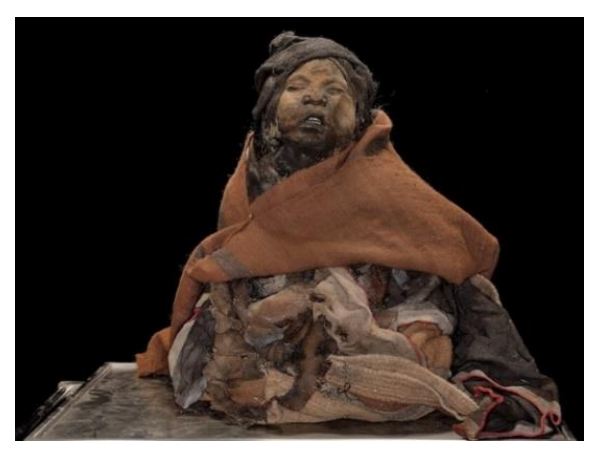
Fig. 2: The mummy of Llipya from mount Llullaillaco.