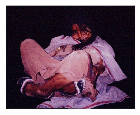
Fig. 3: The mummy of Awaq from mount Llullaillaco. Image by Constanza Ceruti, 2015.