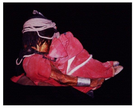
Fig. 1: The mummy of Paqari from mount Llullaillaco. Image by Constanza Ceruti, 2015.

Not much detail is available about the structure and quality of the garments from mount Llullaillaco, but Phipps mentions that they are considered 'fine' textile (Phipps 2004b, 128).