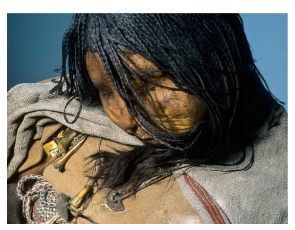
Fig. 4: Detailing of Awaq's Ilyclla, showing the red band with black and yellow detailing.