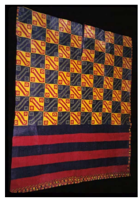
Fig. 5: The tunic associated with the funerary bundle of Awaq.