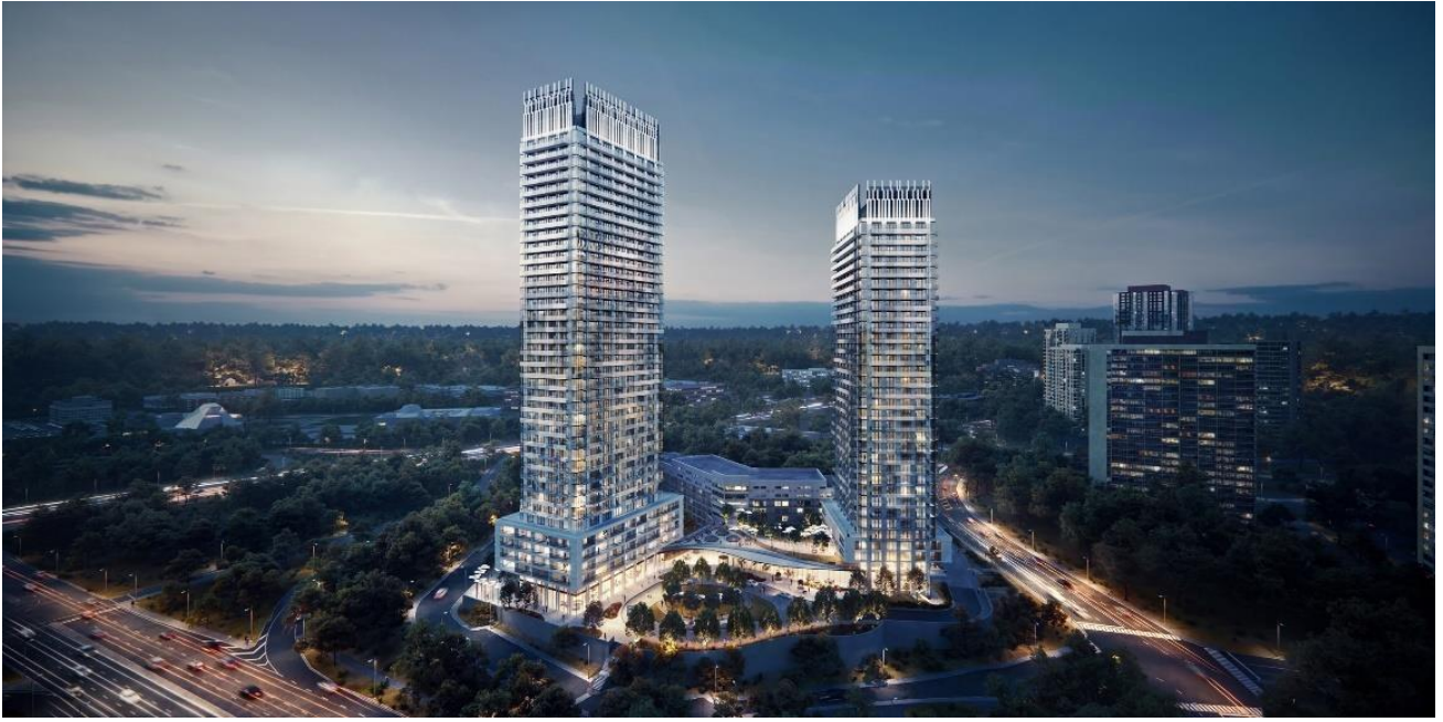
Fig. III. GTA Homes.

Digital rendering used as a marketing image for contemporary housing.