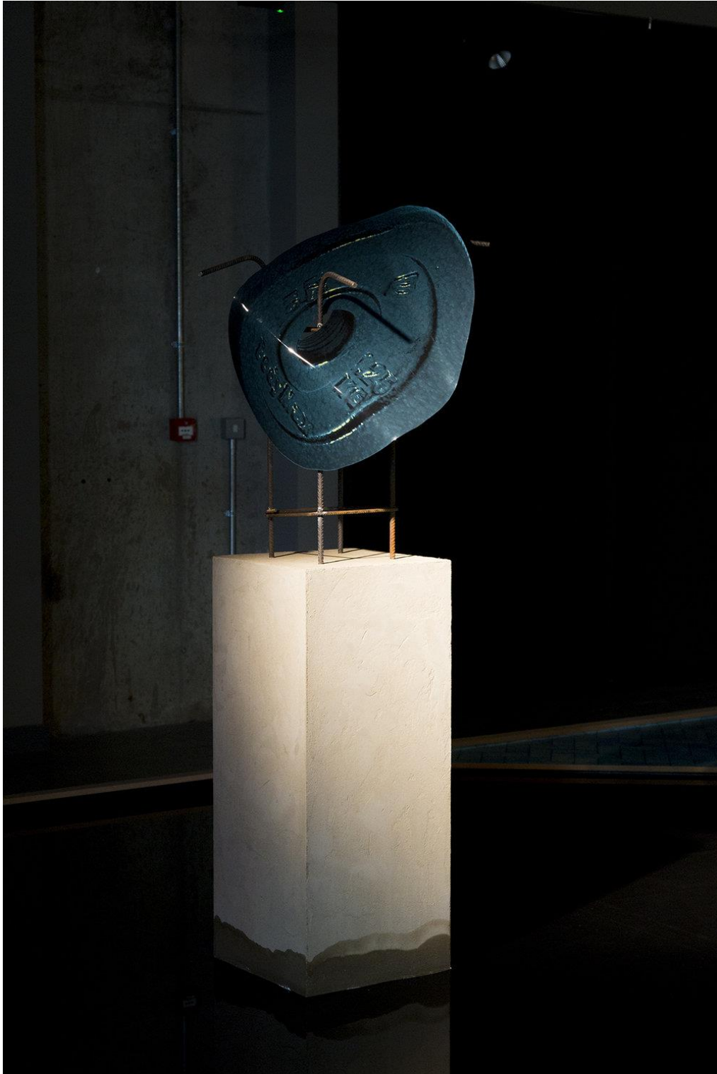
Fig. 7. Felicity Hammond, World Capital (detail), 2019. Ink jet prints on vinyl and dibond, wood, rubber, water, concrete, steel, acrylic.