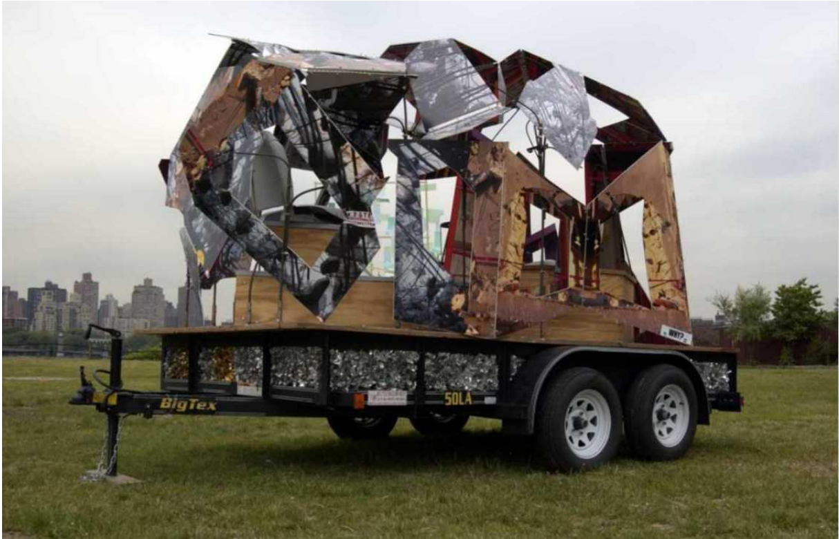
Fig. VI. Katie Grinnan, Rubble Division Interstate at Rhyolite , 2006. Mixed media, approx. 30,5 x 36 x 19 cm. Retrieved from: https://socratessculpturepark.org/artist/katie-grinnan/