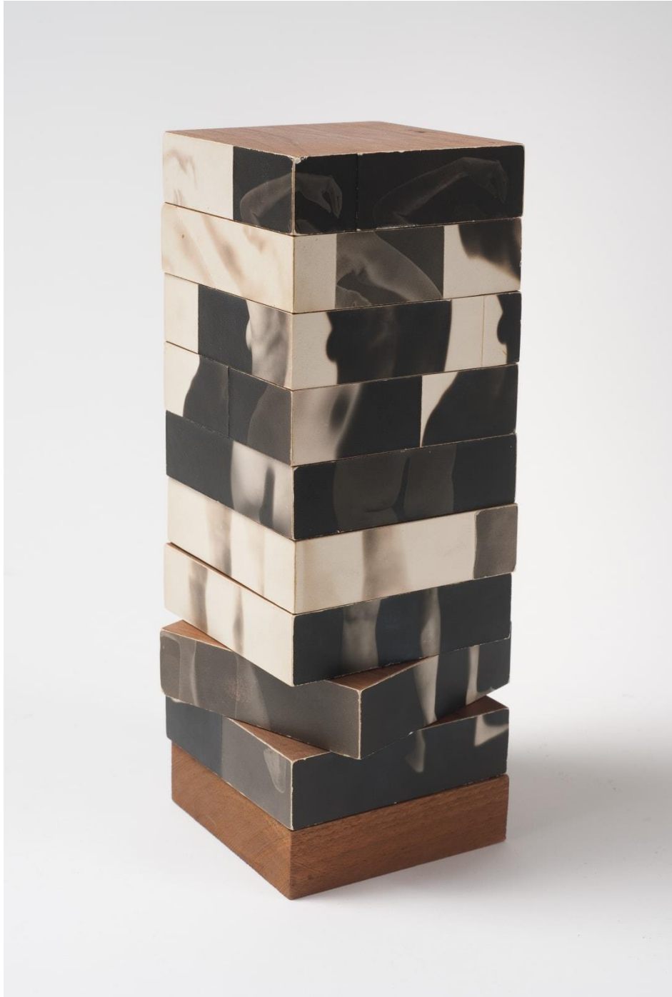
Fig. X. Robert Heinecken, Fractured Figure Sections , 1967. Photographs, wood, approx. 20 x 7.5 x 7.5 cm.