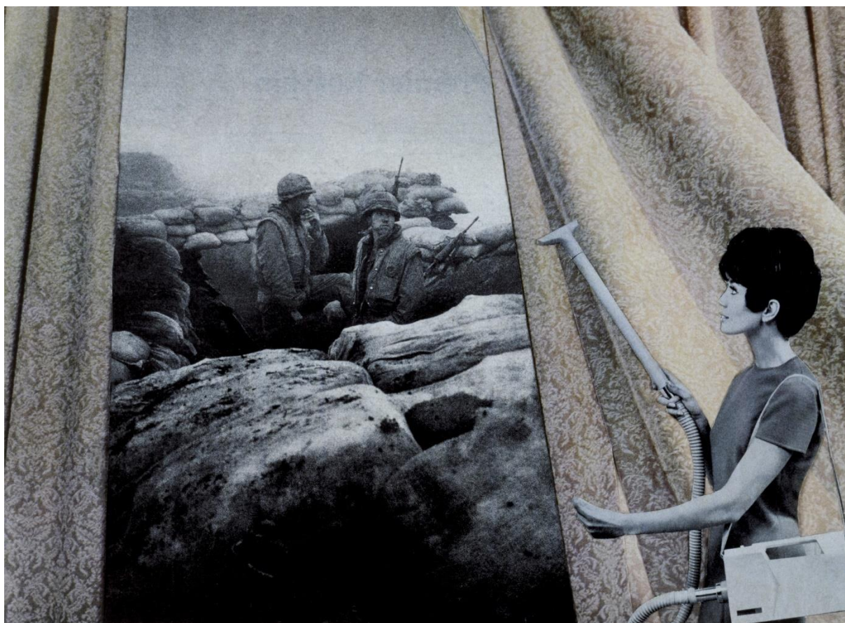
Fig. I. Martha Rosler, Cleaning the Drapes , c. 1967-72. Pigmented inkjet print (photomontage), printed 2011. 44 x 60.3 cm.