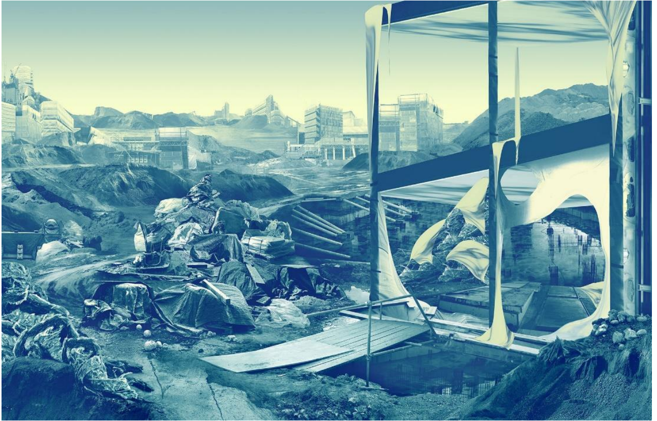
Fig. 2. Felicity Hammond, Unveiling the Facade , 2016.