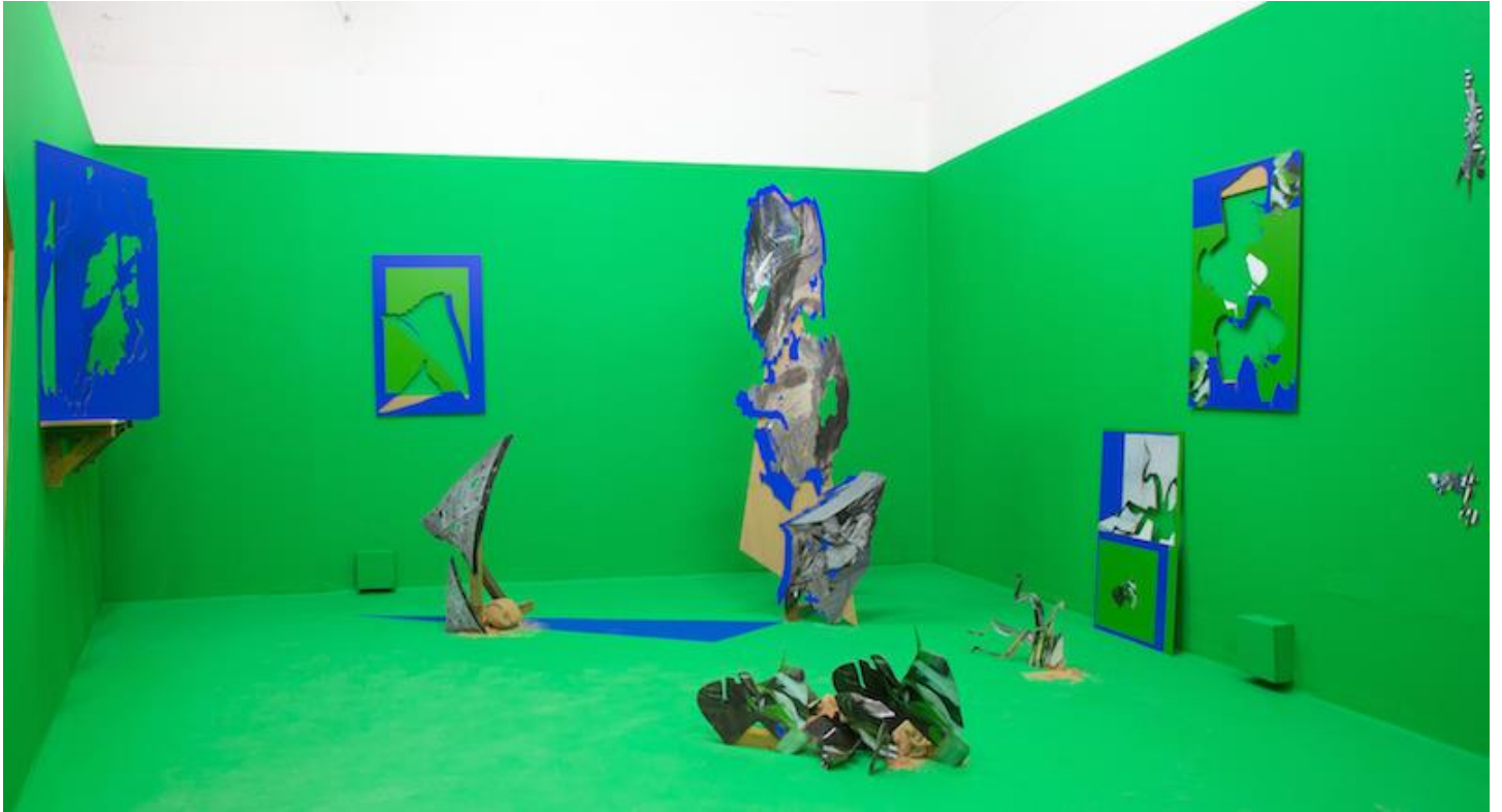
Fig. 15. Felicity Hammond, Remains In Development , 2020.