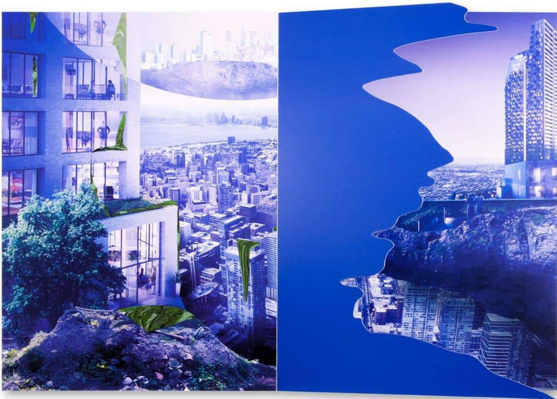
Fig. 4. Felicity Hammond, Property , 2019.