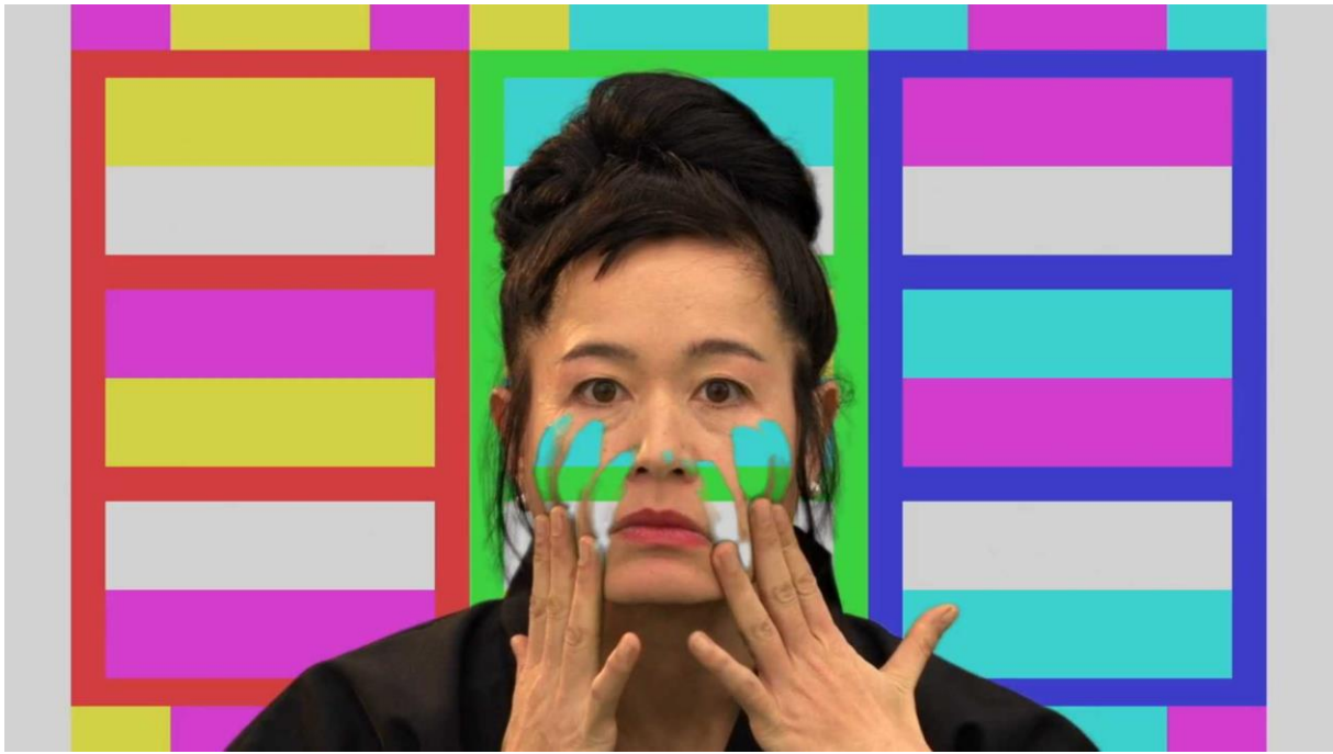
Fig. XI. Hito Steyerl, How Not to be Seen: A Fucking Didactic Educational .MOV File , 2013. Still from video.