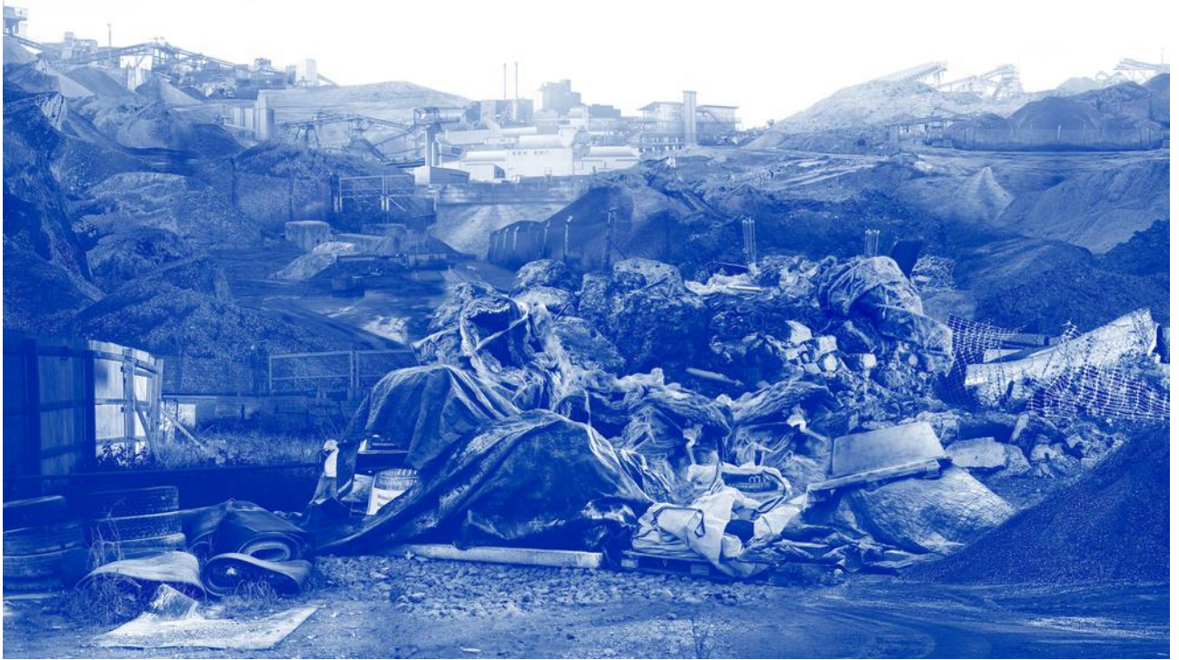
Fig. 3. Felicity Hammond, Restore to Factory Settings , 2014.

C-type print on three Dibond panels, 80 x 130 cm.