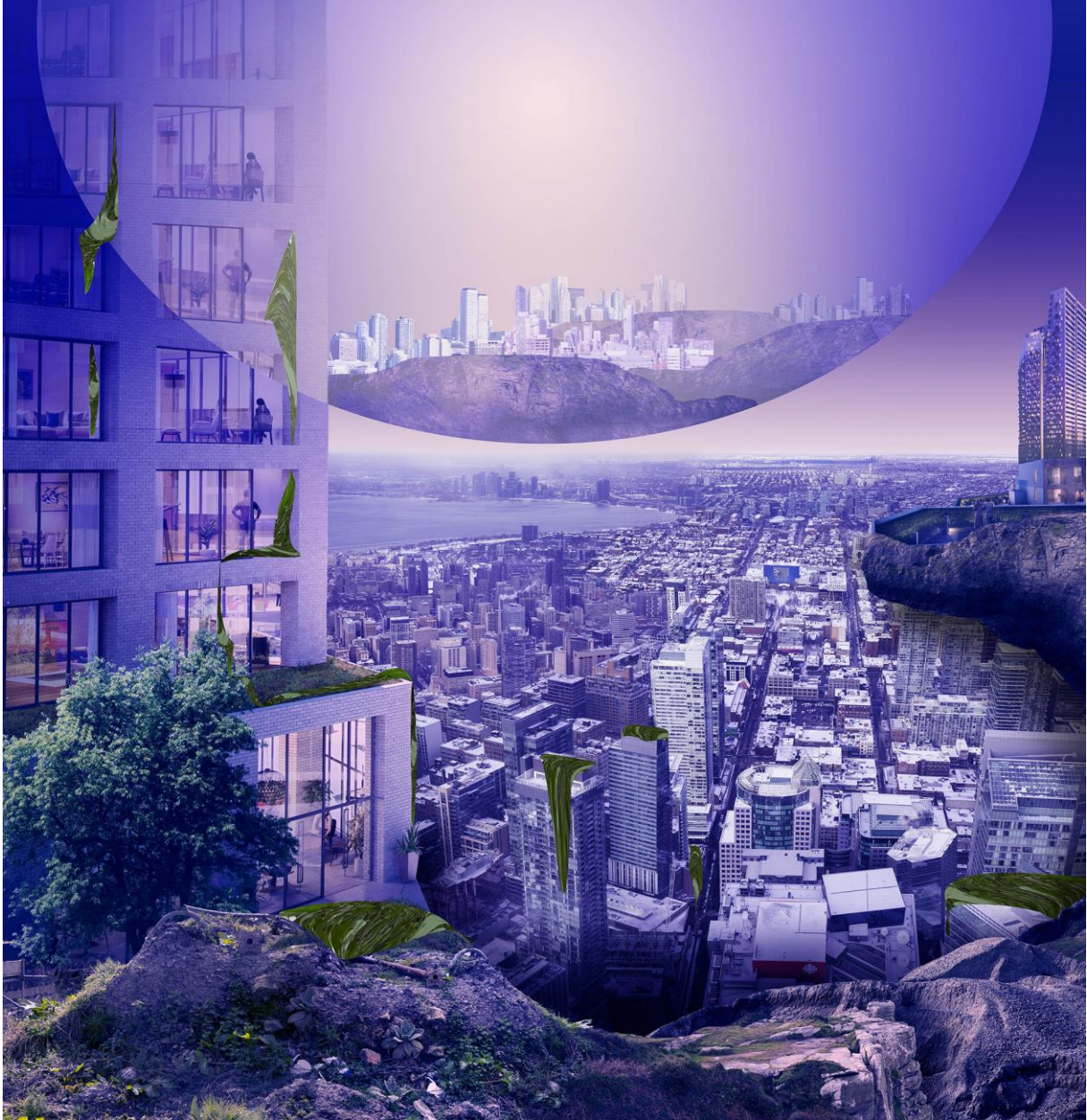
Fig. 1. Felicity Hammond, Post Production , 2018. C-type print on Dibond, 100 x 103 cm.