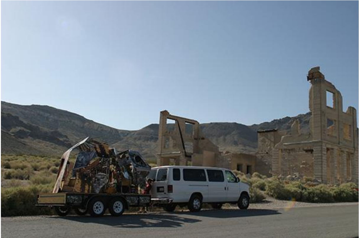
Fig. VII. Katie Grinnan, Rubble Division Interstate at Rhyolite , 2006. Performance still at Rhyolite Nevada.