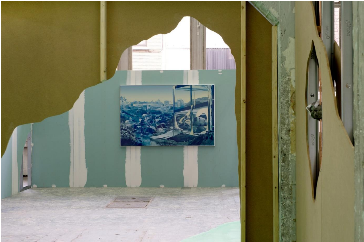
Fig. 9. Felicity Hammond, Remains In Development , 2020.