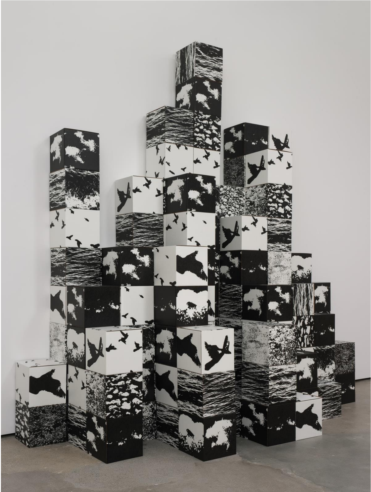
Fig. IX. Michael de Courcy, Untitled , 1970.

100 Photoserigraphs and corrugated cardboard boxes, approx. 30 x 30 x 30 cm, each.