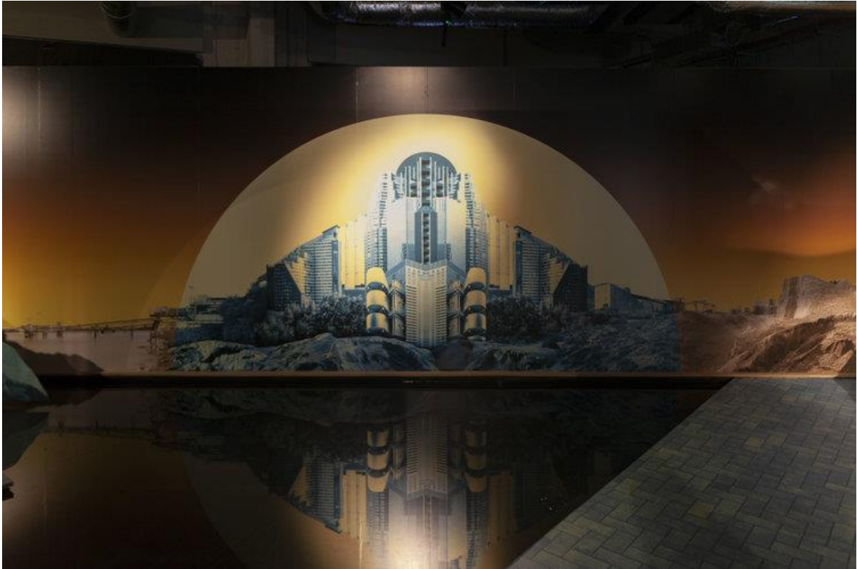
Fig. 12. Felicity Hammond, World Capital , 2019.

Ink jet prints on vinyl and dibond, wood, rubber, water, concrete, steel, acrylic.