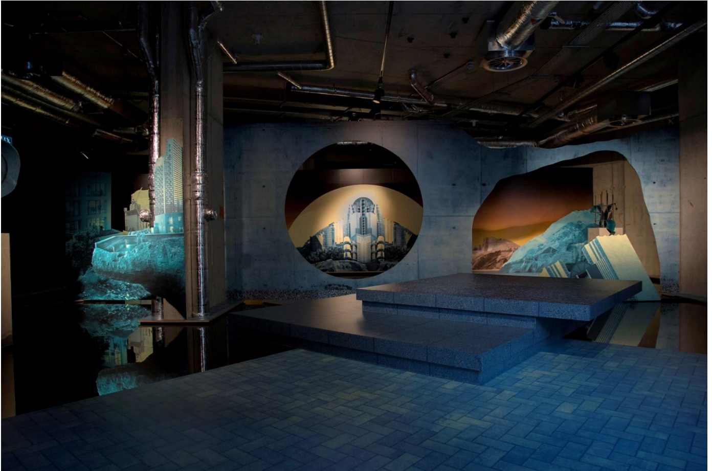
Fig. 14. Felicity Hammond, World Capital (detail), 2019.

Ink jet prints on vinyl and dibond, wood, rubber, water, concrete, steel, acrylic