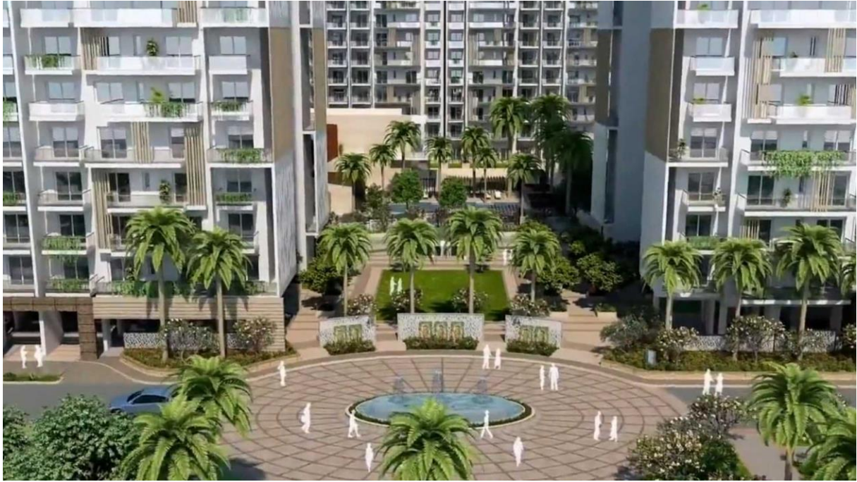
Fig. XIII. Hito Steyerl, How Not to be Seen: A Fucking Didactic Educational .MOV File , 2013. Still from video.