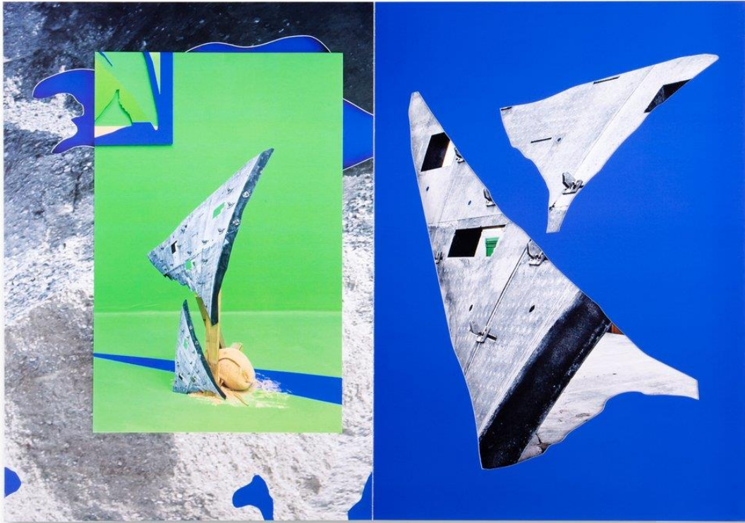
Fig. 5. Felicity Hammond, Property , 2019.