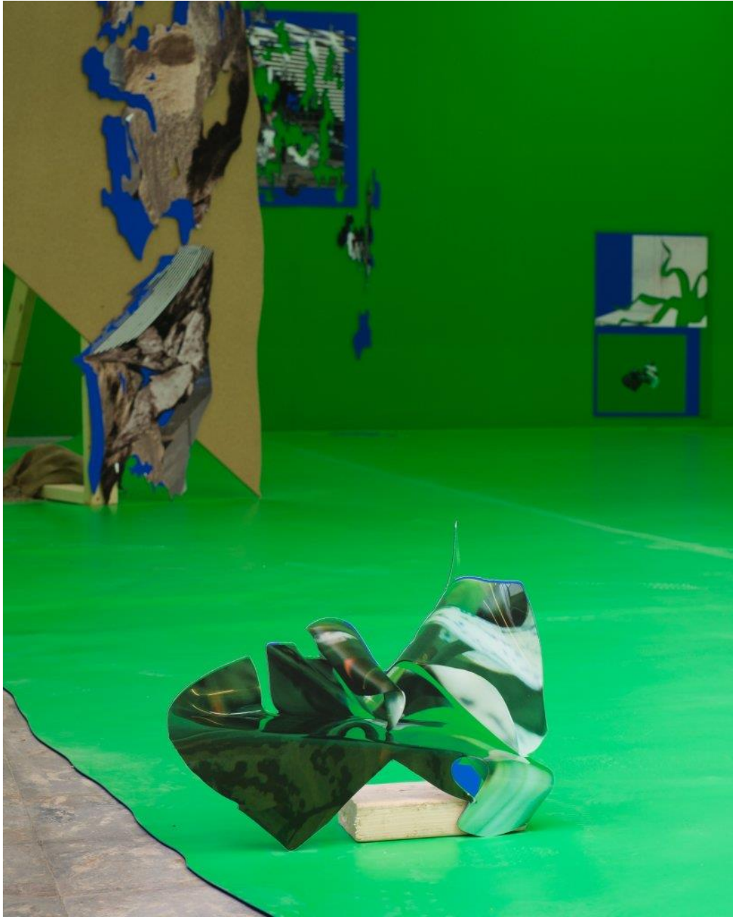
Fig. 8. Felicity Hammond, Remains In Development (detail), 2020. Touring exhibition.