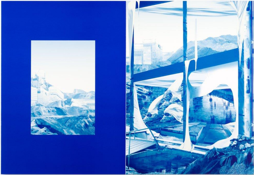
Fig. 6. Felicity Hammond, Property , 2019. Hardcover photo book, 21 x 29 cm.