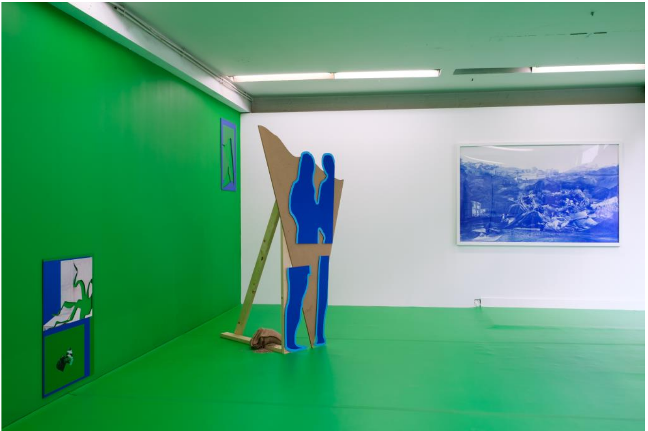
Fig. 10. Felicity Hammond, Remains In Development , 2020.