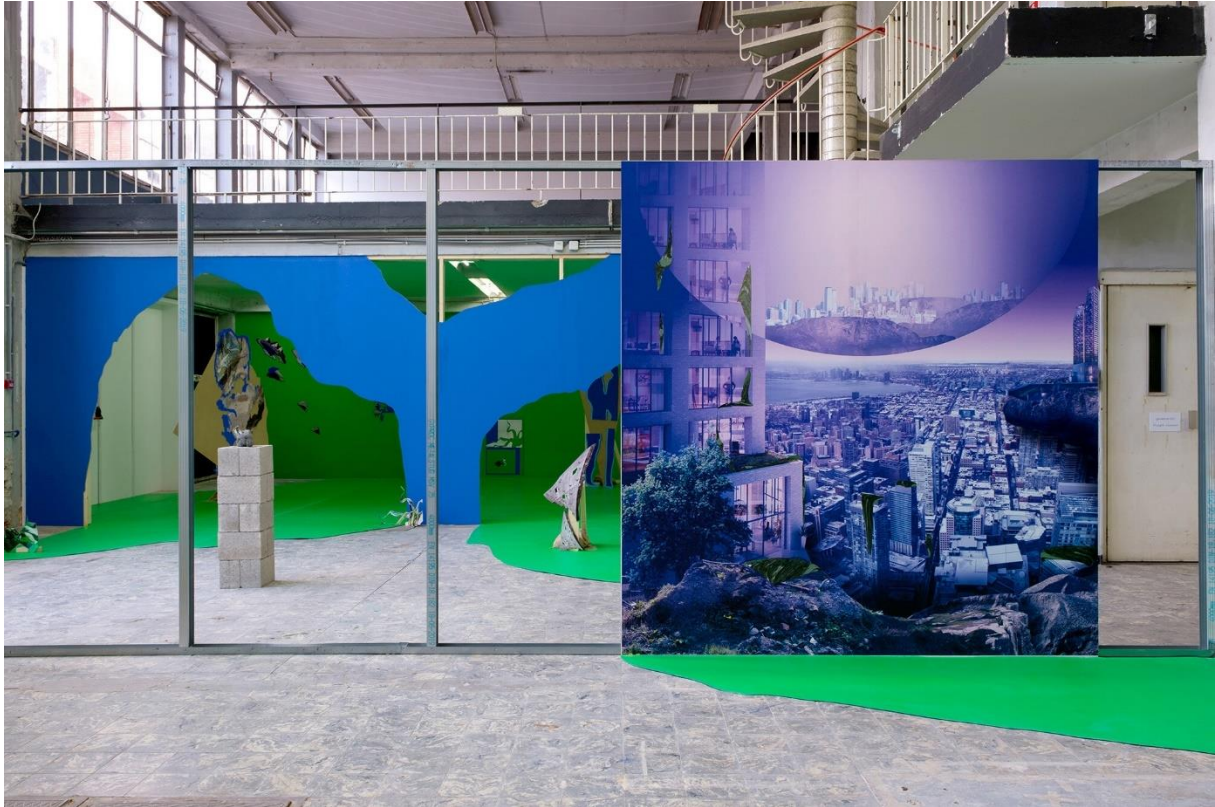
Fig. 11. Felicity Hammond, Remains In Development , 2020.