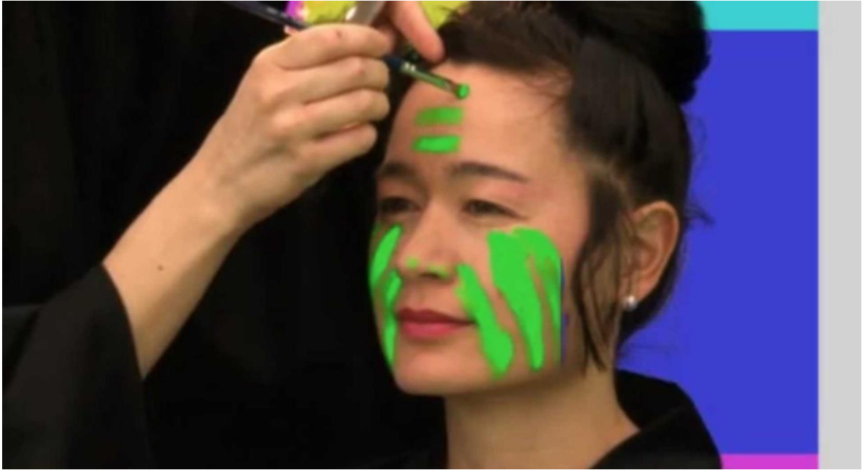
Fig. XII. Hito Steyerl, How Not to be Seen: A Fucking Didactic Educational .MOV File , 2013. Still from video.