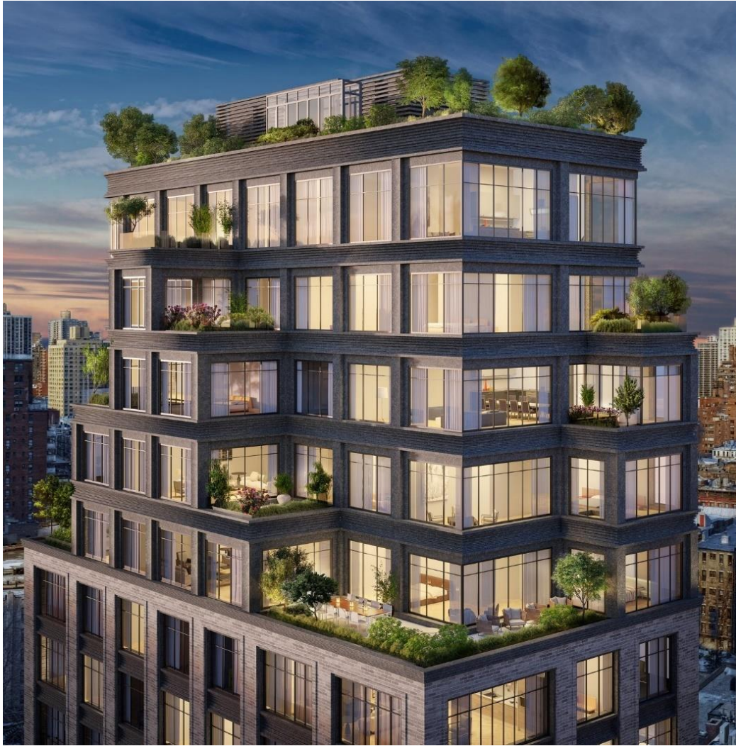
Fig. IV. Kevin Cornelio.

Photo-realistic renderings utilizing 3DS Max and V-Ray, and composited in Photoshop.