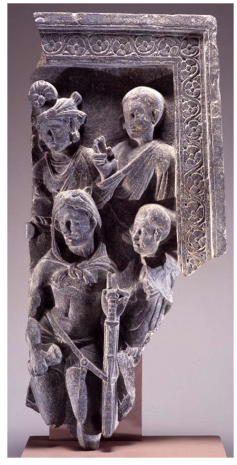
Figure 4. Vajrapani and other attendants. Carved schist panel, fragmented. Gandharan school, 2^{nd} - 3^{rd} Century AD. Currently in British Museum collection. (britishmusem.org)

In Figure 4 we see four figures, two in the foreground and two in the background. The panel is broken and has only two sides showing the decoration on the frame of the relief. The decorations are circular, natural shapes carved in a repeating pattern along the outside of the panel. On the main part of the fragmentary panel, the four figures are crowded together. The figure in the top right corner is covered in a cloth that drapes from their shoulder to the wrist of their hand, which is raised with three fingers up and two down to the palm. The figure in the top left is also draped in similar flowing garments, but has an intricate decoration upon their head, unlike the figure beside it. The figure in the bottom right is fully clothed in yet again the same draping cloth, with no further decoration. The figure in the bottom left, however, stands apart in their state of undress. This figure is clad only in a cloth around the hips, and the pelt of an animal tied across the shoulders. In their right hand, which is resting against their thigh, they