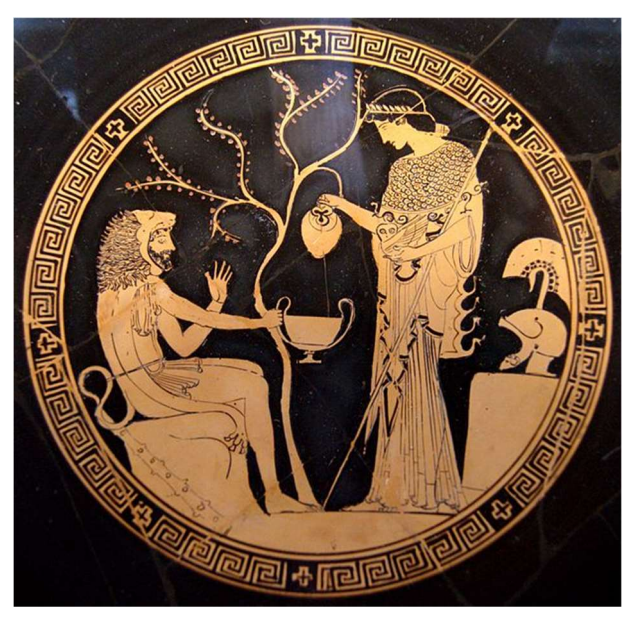
FIGURE 2. HERAKLES AND ATHENA. ATTIC RED-FIGURE KYLIX, 490-470 BC. ATTRIBUTED TO DOURIS (THEOI.COM)

The second Artefact depicts two figures inside of a decorated circle. The circle is decorated with square swirls interspersed with crosses. Inside this circle there are two figures, one seated and the other standing. Behind them is a twisting line that breaks apart into multiple vines with small, circular offshoots. The figure on the right wears short clothing and a cloak, their head appearing from inside the mouth of a lion. The figure is seated, with one hand holding onto a cup,