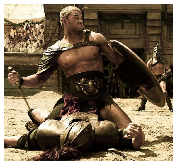
Figure 9. Hercules fights six gladiators. Photograph. 2014.

In the picture to the right we see two main figures, and several people in the background. The colour gradient of the image is very yellow in hue, as is the sand beneath them and the walls behind them. There are two figures in the centre of the image. One figure is lying on the floor, on their back, while the other straddles them over the chest. The figure on the floor is wearing a yellow-brown tinted plating, and the helmet has the same colour. Beside their right hand there is a blade, also a similar colour to the