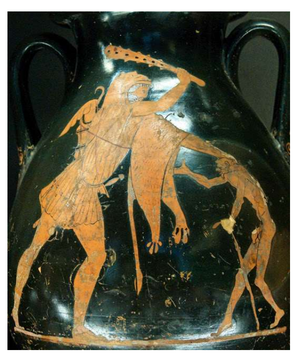
FIGURE 1. HERAKLES FIGHTS GERAS. RED-FIGURE PELIKE, 500-450 BC. NAME VASE OF THE GERAS PAINTER (STAFFORD, 240).

Artefact 1 is a jug depicting two humanoid figures in orange-red colours, as seen in Figure 1. The background is a shiny black. There are only two figures that are depicted here. The figure on the left is taller than the figure on the right, with a more built frame, as the arms and legs are thicker, and they are draped in garments. The figure on the left has a striped garment covering the upper half of their torso and upper thighs, with a cloak made of a feline animal. In the left figure's right hand, they are holding a club with numerous points above their head. Their left hand is