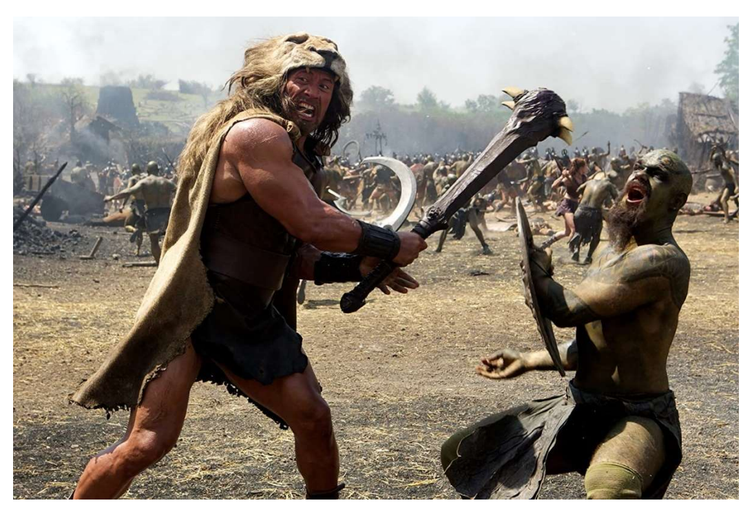
Figure 8. Hercules engaged in combat. Photograph. 2014. By Kerry Brown. Paramount Pictures and Metro-Goldwyn-Mayer Pictures. (imdb.com)

to it, two on either side of the head of the weapon. In the background, there is a mass of people, also fighting, surrounded with dark smoke.