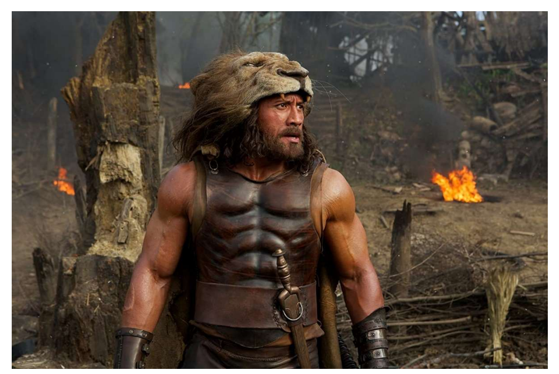
Figure 7. Hercules wearing the lion-skin pelt. Photograph. 2014. By Kerry Brown. Paramount pictures and Metro-Goldwyn-Mayer pictures. (imdb.com)

In the above image we see one central figure, male, standing in front of a background of wood and earth. In the background is smoke and fire, and trees. The figure in the foreground is muscular, dressed in a dark brown item that covers their torso, decorated with a highly defined musculature, a thick belt and a short sword attached to it. The man has brown items around their wrists. He has a beard and wild, shoulder-length hair. The man in the image also has the head of an animal on top of his head – small teeth can be seen coming from the mouth of the animal above the man's eyebrows. The animal skin head has a large, wide nose, and dark fur coming from the side of its head, almost mixing with the hair of the man. In Figure 8 (below), we see the same man, this time engaged in combat. He wears a short loincloth, and the rest of the animal skin is visible. The man stands on a field, battling an opponent that is painted green, also wearing a loincloth that is longer, and holding a shield. In his hands, the man on the left – the same man from Figure 7 – is holding a wooden stick, with a knotted end that has sharp spines attached