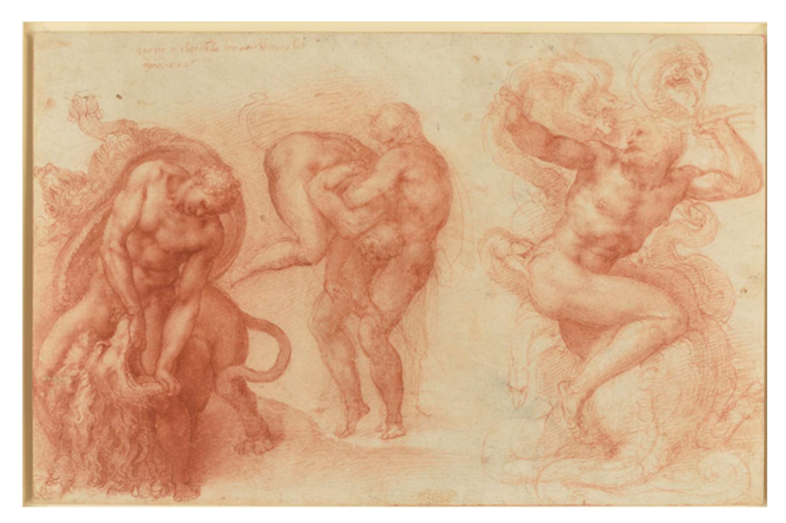
Figure 6. Three Labours of Hercules. Red chalk. Ca. 1530. Michelangelo Buonarroti. The Royal Collection (rct.uk.)