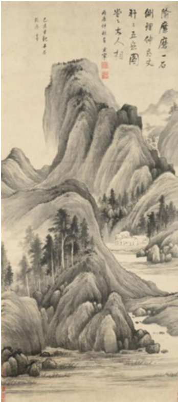
Figure 7. Dong Qichang. Five Sacred Mountains , 1616. Ink on paper, 221 x 99 cm.