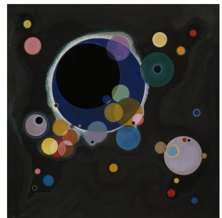
Figure 10. Wassily Kandinsky. Several Circles (Einige Kreise) , 1926. Oil on canvas, 140.7 x 140.3 cm.