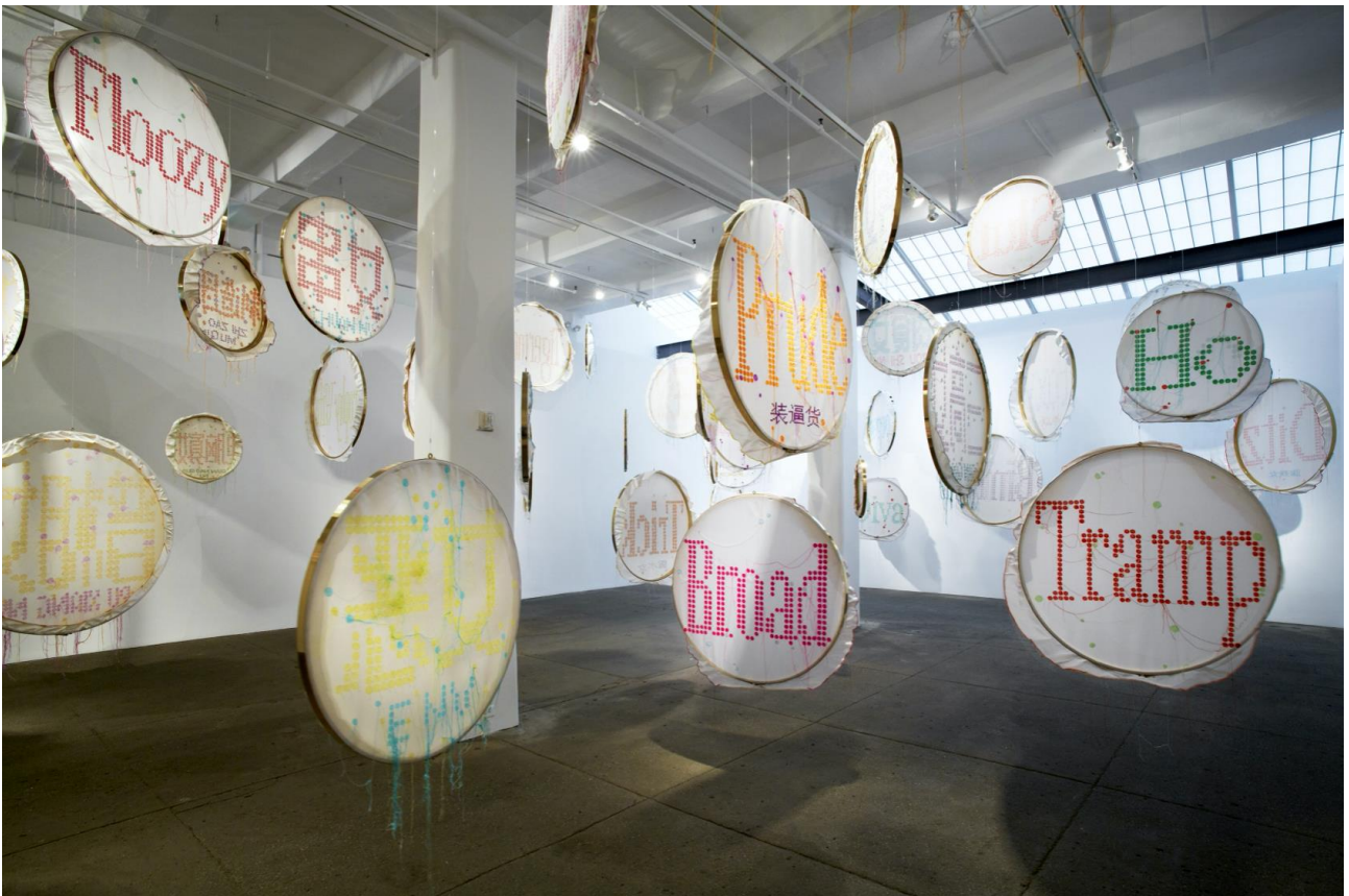
Figure 14. Lin Tianmiao. Badges (installation view at Galerie Lelong & Co., New York), 2012. White silk, coloured silk thread, and painted stainless steel embroidery frame, variable dimensions.

( chuàn nǚ , 串女), which translates to ‘a woman ‘sleeping around.’ 139 For this art work, Lin Tianmiao and her team collected slang words like these that are used to label women. Lin explains: “Today, terminology for women has been and is being rapidly expanded, enriched and changed in a more and more diversified fashion; manifesting the transformation from passive to positive involvement of women in society [...]. Of course, in the present male dominated society, the traditional cognition of women is still the mainstream.” 140 Chinese terms like these can mostly not be found in dictionaries, but exist in the spoken language. Although such terms disappear as easily as they are invented, these raise societal issues, and have a vigorous impact on society. 141 By placing these derogatory terms on enlarged badges in colourful thread, hung throughout the exhibition space with museum visitors walking around them, Lin Tianmiao ridicules these slang words as an accepted, standard language. 142 However, walking through the exhibition room, the artwork can evoke a sense of unease as well, as the oversized badges can be quite confronting.