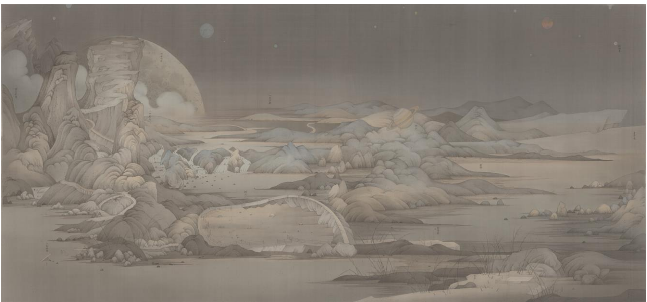
Figure 11. Hao Liang. Eight Views of Xiaoxiang - Relics , 2015-16. Ink on silk, 387 x 184 cm.

In the technique of traditional Chinese landscape painting, there is no use of scientific perspective, shading, or three-dimensional modelling in the painting. 115 However, mountains have three different dimensions, simultaneously existing in landscape paintings. Height, or ‘hither distance,’ is established by looking up to the top from below; depth, or ‘deep distance,’ can be created looking toward the back from the front; and a horizontal dimension, or ‘horizontal stance,’ is initiated by looking across at a mountain from an opposite height. 116 This technique of multiple dimensions is not only visible in Streams and Mountains without End , but also in other artworks of Hao Liang, such as Eight Views of Xiaoxiang - Relics ( Figure 11 ). Eight Views of Xiaoxiang - Relics , just like Streams and Mountains without End , bridges time and space, by combining multiple historical, textual relics from previous landscape painting traditions. Here, Chinese literati traditions from the Jin (265-420) and Tang (618-907) dynasties, and landscape painting traditions of Song-dynasty artists come together in Eight Views of Xiaoxiang - Relics , edited into Hao Liang’s style. 117