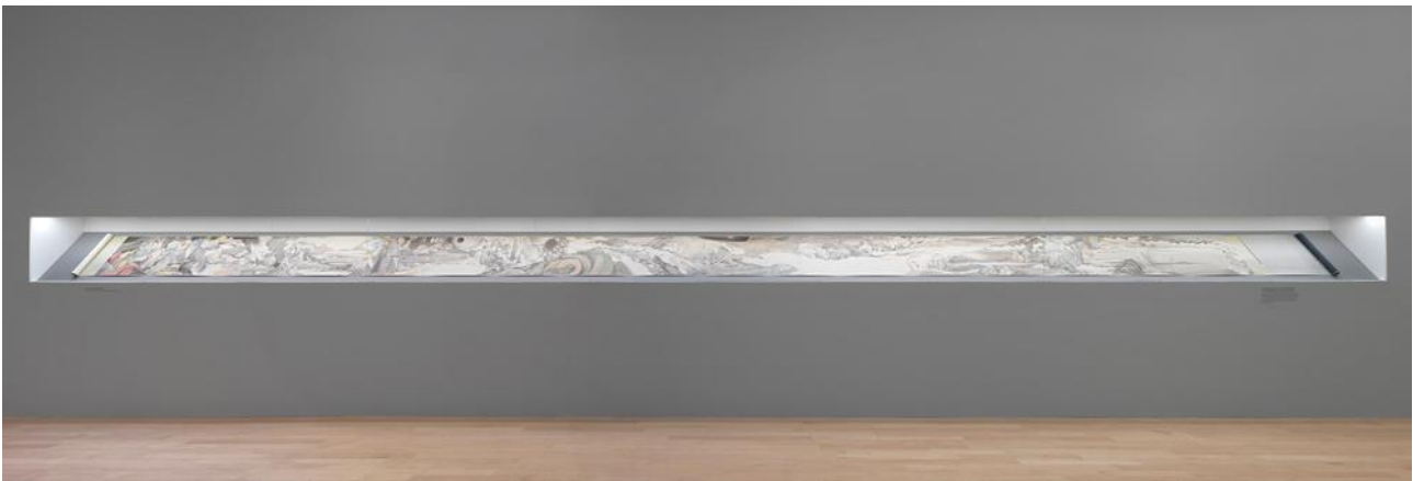
Figure 1. Streams and Mountains without End (installation view at Gagosian Madison Avenue, New York), 2018. Ink and colour on silk, 42,4 x 1.004 cm.

Due to the gap between their labeled identity and how these artists portray themselves, I was intrigued by the idea if this would also be visible in and represented by their artworks. Therefore, I have created a small selection of these artists’ works, made after 2008, with one art piece of each artist as foci. The focus points in my research are Hao Liang’s Streams and Mountains without End ( Figures 1, 2a-b ), Lin Tianmiao’s Badges ( Figures 3a-b ), and Sky Ladder by Cai Guo-Qiang ( Figure 4 ).