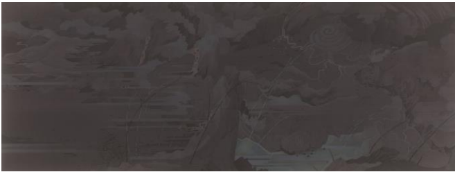
Figure 12a. Hao Liang. Day and Night (Part I) , 2017-18. Ink and colour on silk, 48.5 × 124 cm.

showcasing the exact same landscape, the smaller panel ( Figure 12a ) represents this landscape during nighttime, whereas the large panel ( Figure 12b ) illustrates daytime. In this specific art piece, Hao Liang proves that by applying a contrasting scale, texture, and brightness, it is able to change one's readability and memory. 119