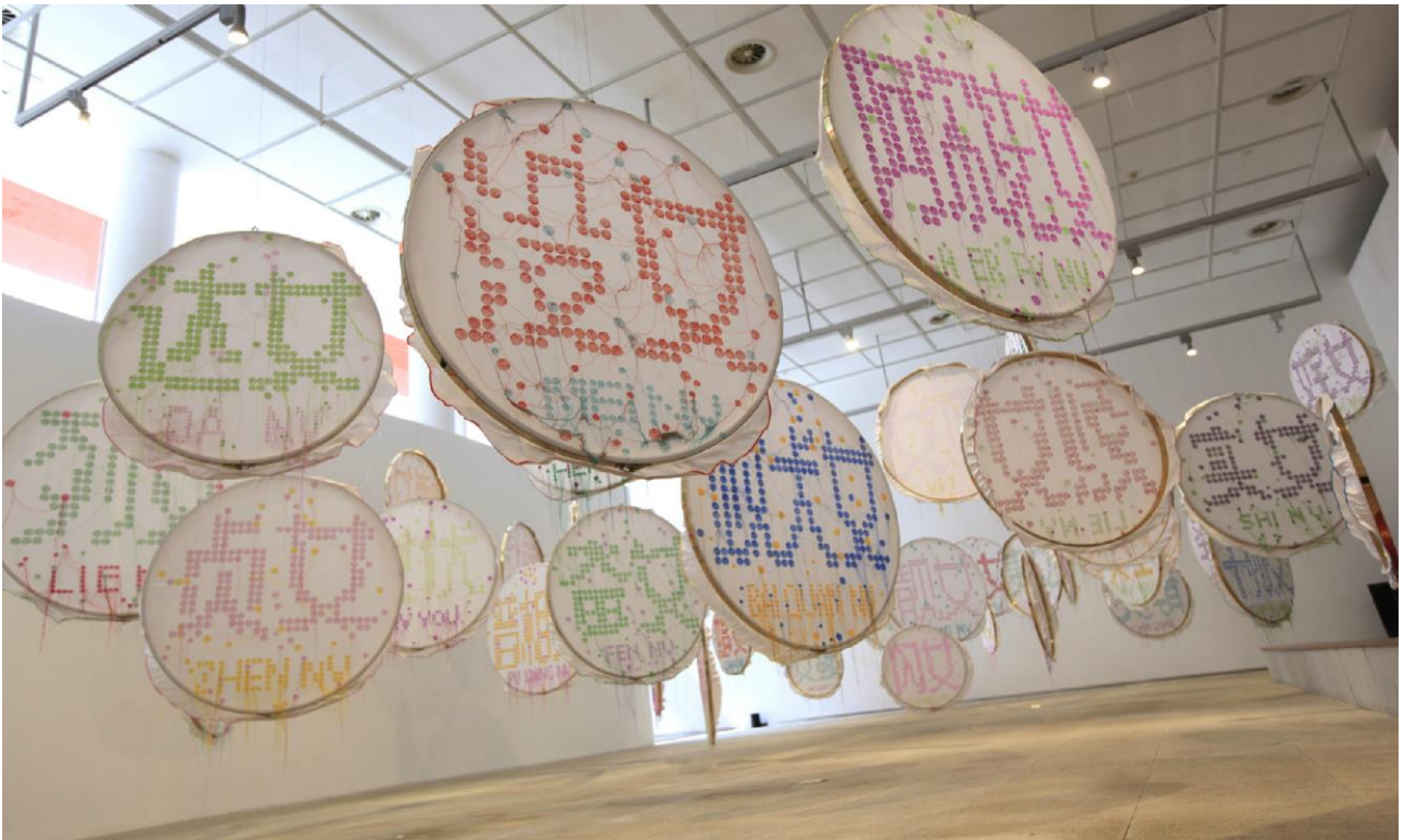
Figure 15. Lin Tianmiao. Gazing Back - Badges (installation view at Shanghai Pujiang OCT, Shanghai), 2009.

'yafengnü' (yáfēngnǚ, 牙縫女), meaning 'beauty with a gap between the front teeth,' is included among many others. 144