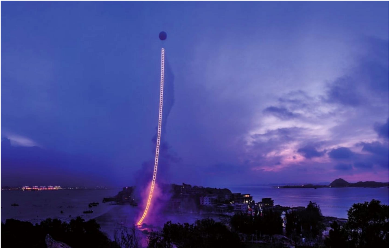
Figure 4. Cai Guo-Qiang. Sky Ladder (realised off Huiyu Island, Quanzhou), 2015. Gunpowder, fuse and helium balloon, 500 x 5,5 m.

These three art works are similar and different in multiple ways. One similarity is that the three art pieces all include a traditional element of China or Chinese art, whether this is in the form of an object, its technique, or material. For Hao Liang, the traditional element in his Streams and Mountains without End not only lies in the traditional object of a hand scroll and the traditional Chinese technique of landscape painting, but also in the use of traditional Chinese materials, here silk and ink. Simultaneously in Badges , Lin Tianmiao also uses silk as the basis for her embroidered text. Cai Guo-Qiang's Sky Ladder uses the traditional Chinese concept of Heaven and earth in his art work, in his attempt to connect the two through his ladder. Cai also uses firework, which is a Chinese invention, to (literally) light his ladder up.