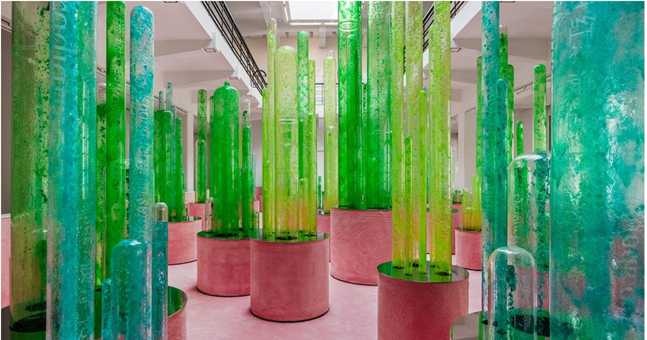
Figure 19. Lin Tianmiao. My Garden (installation view at Rockbund Art Museum, Shanghai), 2018. Aluminium frame, glass, liquid circulation system, carpet, variable dimensions.

vernacular terms. Like so, the Lawsonia inermis plant, in Chinese known as ‘zhijiahua’ ( zhǐjiāhuā , 指甲花), is translated back to ‘nail dye flower.’ 151 By using this retranslation of plant names, Lin Tianmiao highlights the importance of language to the creation of our understanding of the world. 152