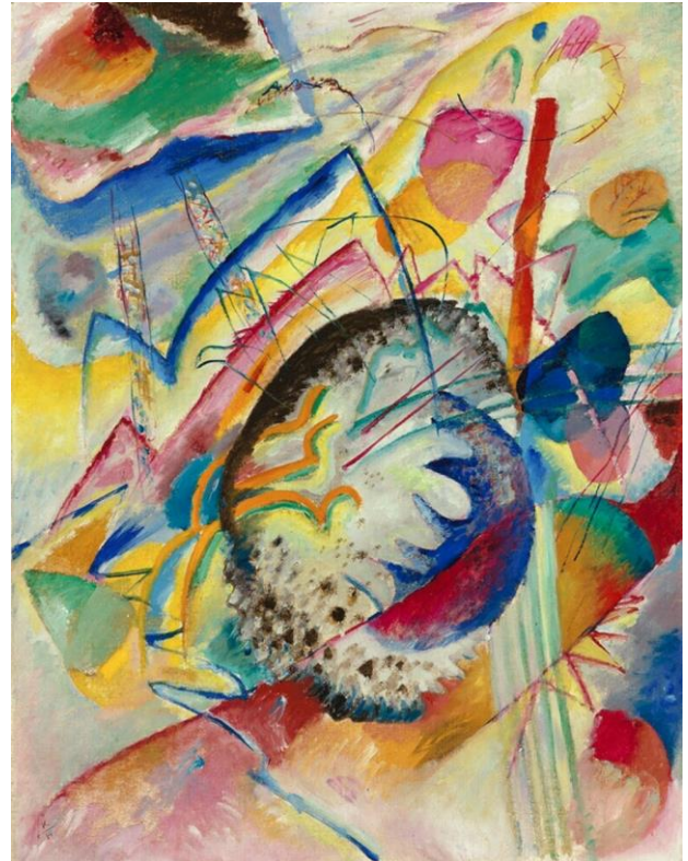
Figure 8. Wassily Kandinsky. Grosse Studie , 1914. Oil on canvas, 79.3 x 101 cm.