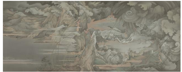
Figure 12b. Hao Liang. Day and Night (Part II) , 2017-18. Ink and colour on silk, 173 × 441 cm.

Hao Liang's approach to art is similar to that of a traditional Chinese painter. By doing extensive visual and textual research and by applying the method of copying, Hao finds himself in the tradition of an educated painter. 120 Hao's implementation of custom-made paint retrieved from plants and materials, creating subdued colours in his artworks, is in line with the traditional practice of ink and wash painting. 121 As in true landscape artist fashion, Hao Liang inscribed his Streams and Mountains without End on the outer far end of the artwork. ( Figure 13 ).