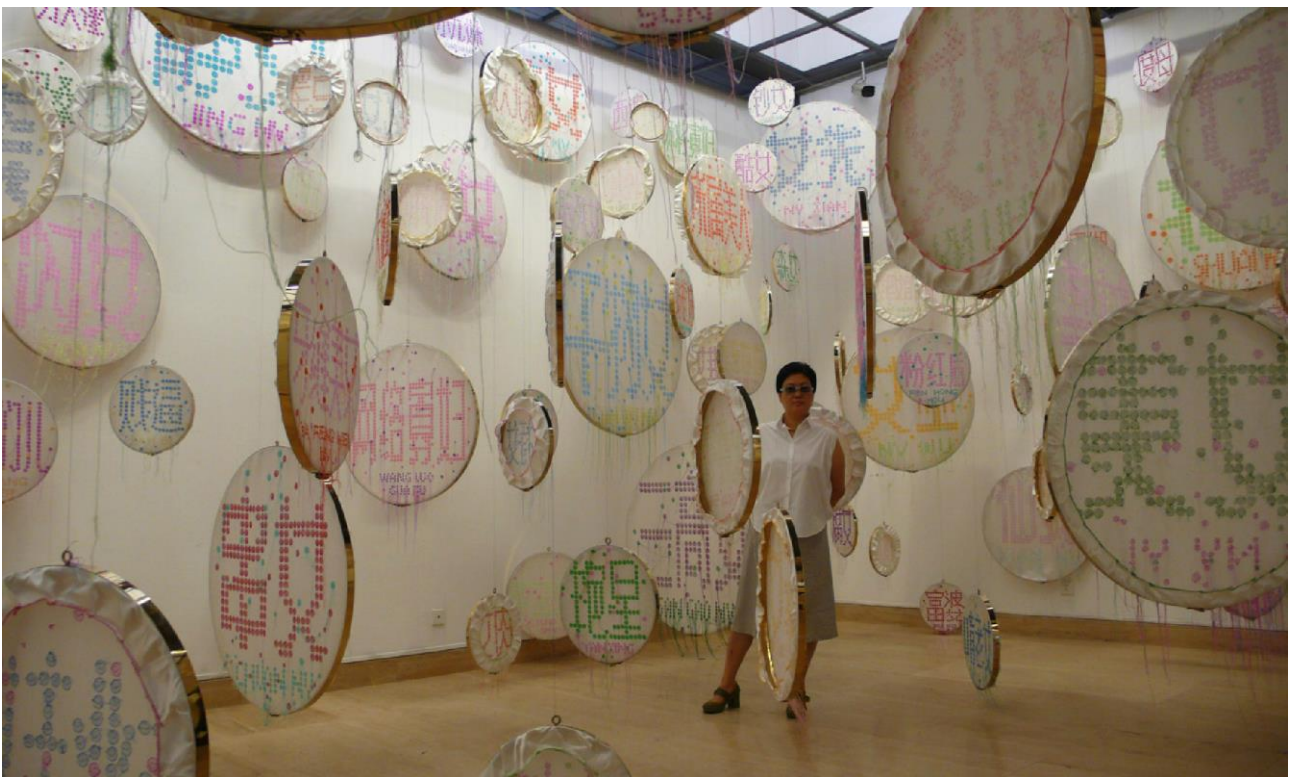
Figure 16. Lin Tianmiao. Constructive Dimension - Badges (installation view at National Art Museum of China, Beijing), 2010.