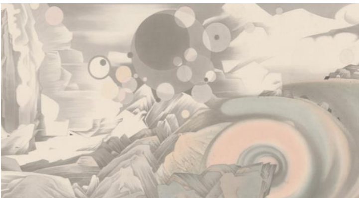
Figure 9. Hao Liang, Streams and Mountains without End (detail).