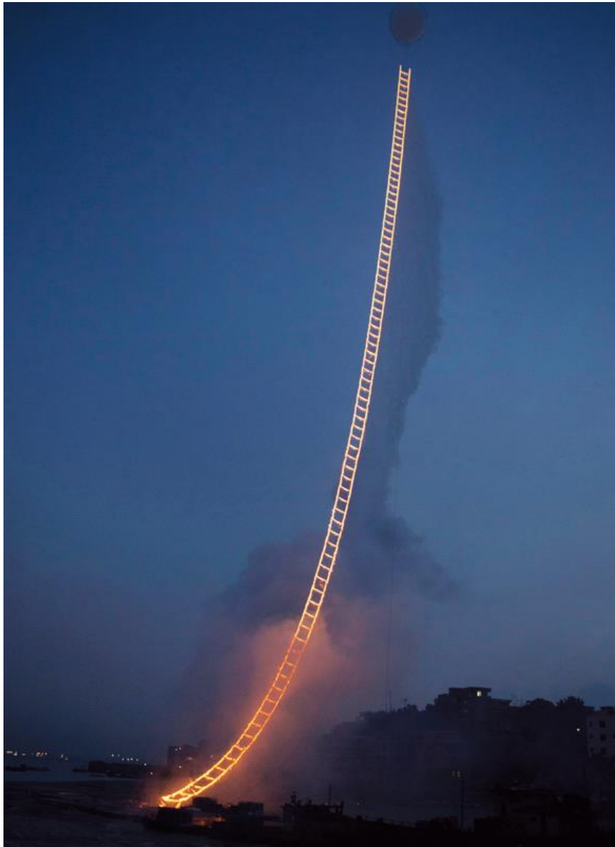
Figure 20. Cai Guo-Qiang. Sky Ladder (realised off Huiyu Island, Quanzhou), 2015. Gunpowder, fuse and helium balloon, 500 x 5,5 m.

painting. This idea to bring people into his paintings, was a concept that arose after Cai moved to New York.