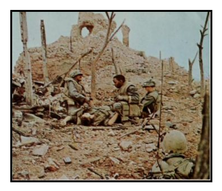
Figure 3: "Three U.S. Marines carry a wounded fellow soldier from the ruins of Huė, South Vietnam." History of a Free People, 1967, page 761

The actual fighting was described as " a dirty, ruthless, wandering war " (765), and the choice of words used in this section offers hints of a balanced view between both sides of the conflict. The Vietcong are described as " using revolting terrorism against civilians ", but the Americans are not described as protectors of freedom and democracy (Bragdon, 1969, 765). The sentence " American bombs and napalm dropped on villages supposedly held by the Vietcong took the lives of thousands of noncombatants " is proof of this, and begins to dig deeper into some of the complex themes associated with the Vietnam War (Bragdon, 1969, 763).