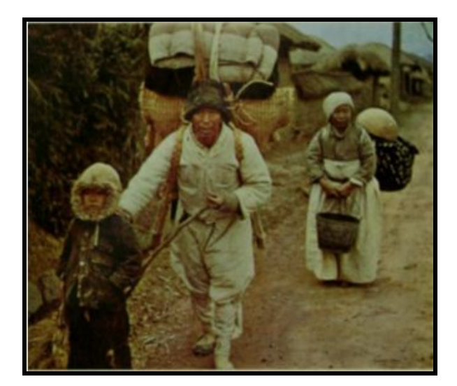
Figure 1: "The Korean War brought great suffering to the inhabitants" History of a Free People, 1967, page 712