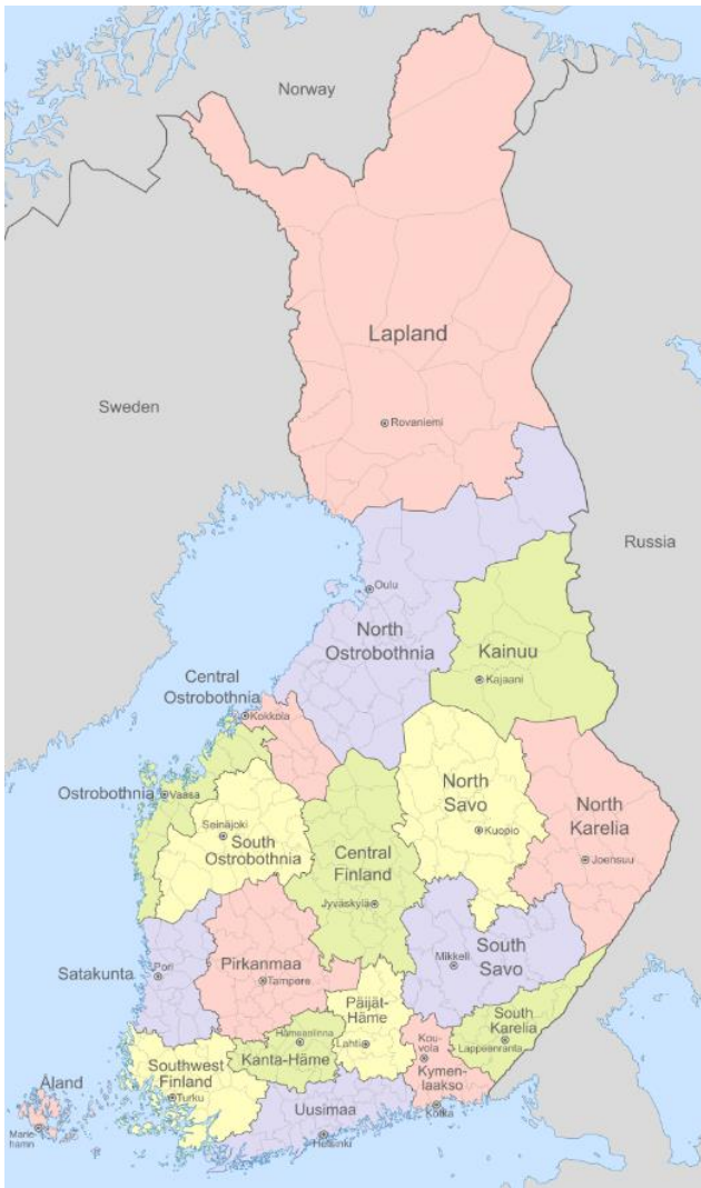
Map 1: English names of the regions of Finland (Fenn-O-ManiC, 2020).

In the following table you can see the place of birth and residence for each participant.