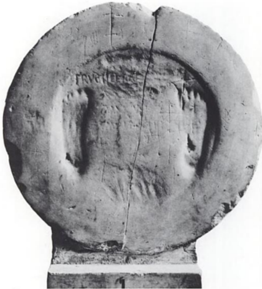
Fig. 8. Marble disc with footprints formerly attributed to Michael the Archangel. Musei Capitolini.