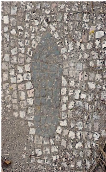
Fig. 5. Mosaic footprint marking the entrance of the so-called planta pedis Mithraeum in Ostia