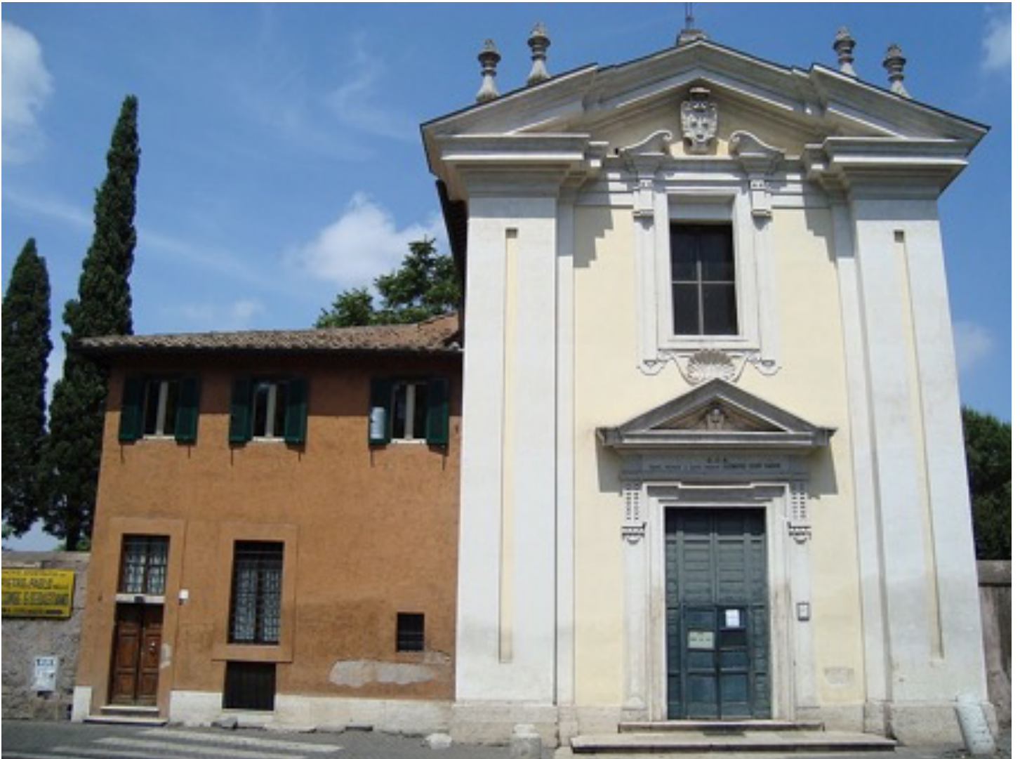
Fig. 1. Chiesa del Domine Quo Vadis on the Via Appia