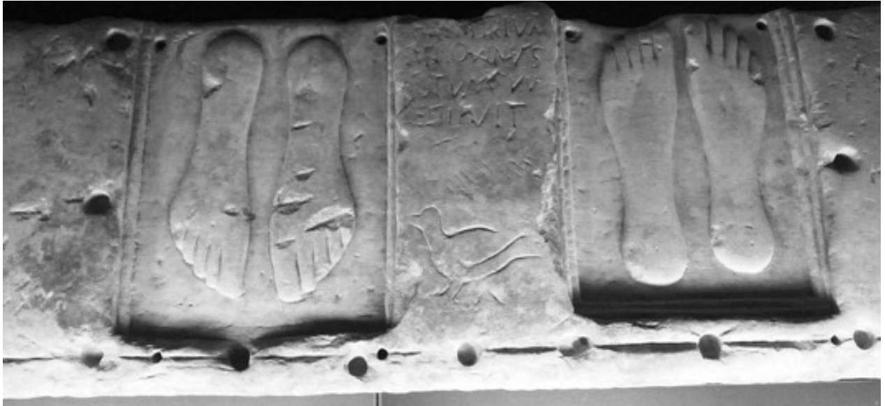
Fig. 6. Votive footsteps dedicated to the goddess Caelestis, Musei Capitolini, Source: Wikimedia Commons.