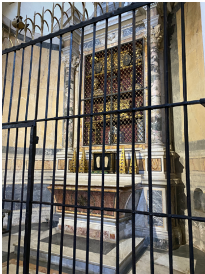
Fig. 7. Display of the original footsteps in a side chapel of the San Sebastiano