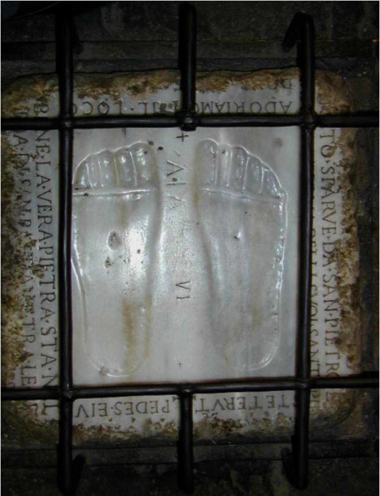
Fig. 2. Copied footsteps in the Chiesa del Domine Quo Vadis