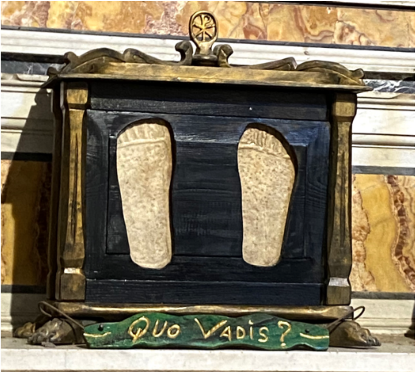
Fig. 3. Original footsteps in the Chiesa di San Sebastiano Fuori le Mura