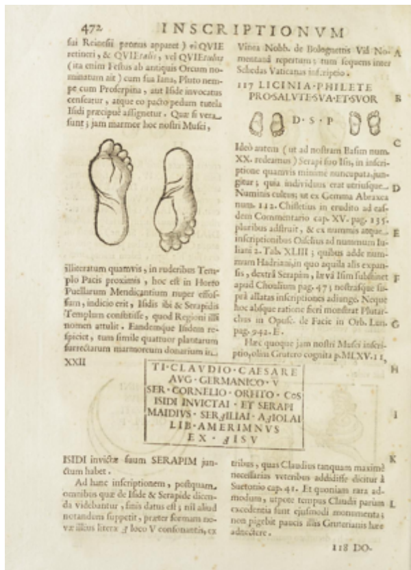
Fig. 4. A page from the reprint of Raffaele Fabretti's Urbinae Inscriptio Antiquarum Quae In Aedibus Paternis Asservantur Explicatio Et Additamentum (Rome, 1702), describing the Licinia Philete slab found on the Via Nomentana in Rome