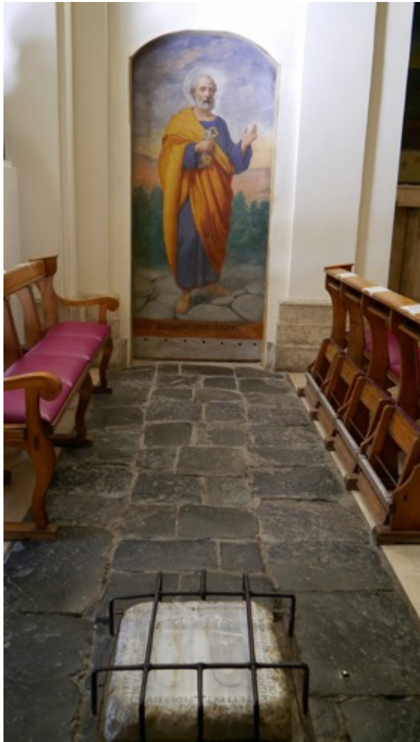
Fig. 10. Impression of the interior and placement of the relic