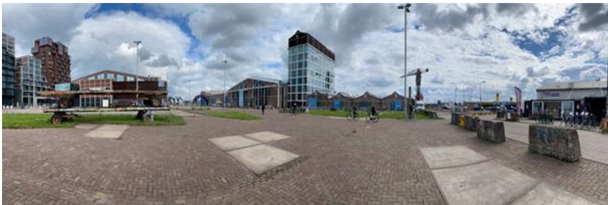
Figure 3: “NDSM site” at Amsterdam.