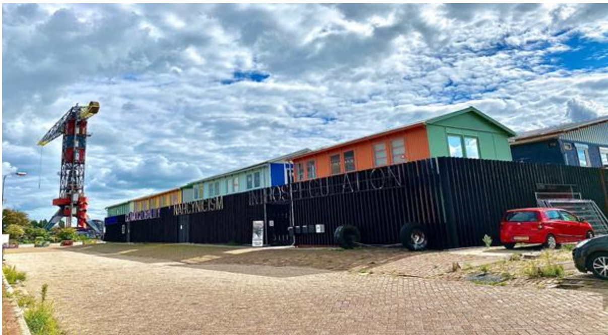
Figure 5: "ELITOPIA, GLAMOGLOBALITY, NARCYNICISM and INTROSPECULATION, artwork by Annaïk Lou Pitteloud" at Treehouse Amsterdam.

Treehouse's aesthetic appearance on the outside is characterized by an artwork of neon words that say "ELITOPIA", "GLAMOGLOBALITY", "NARCYNICISM" and "INTROSPECULATION", made by artist Annaïk Lou Pitteloud 2 . These four words are written in Helvetica, a Swiss font designed for its neutrality and clarity. The words are the artist's vocabulary to describe the present time: a time in which the artist is often seen in terms of branding and the globalized 21st century, which can even be seen as the "century of the self", where the egoistic individual takes cynicism as a guideline over solidarity and the elite form the utopia 3 . As Beech (2006) states: "Here and elsewhere, institutionalization is taken to be a key feature of contemporary art" and this is one of the aspects of this study that I will take along to find out about how this institutionalization is perceived by artists, especially because it used to be a squatter community where individuals experienced more autonomy within the space and place. Therefore, an artwork as such, that reflects such ideas, can help us understand the experiential aspects of human life (MacDougall 2005: 95), in this case, certain ideologies.