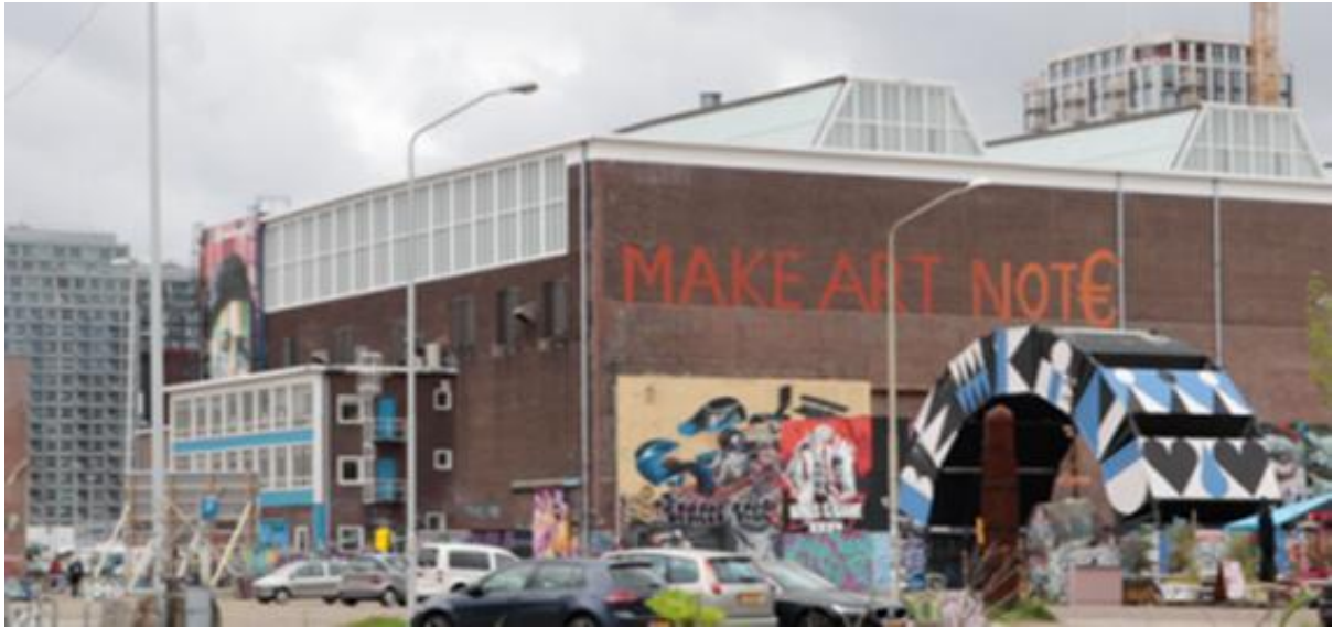
Figure 17: “MAKE ART NOT€” at the NDSM site.