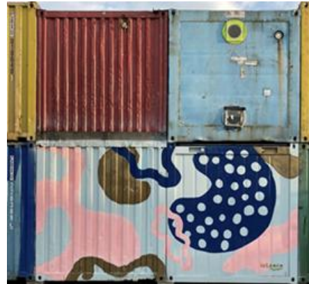
Figure 21: The result of Clothilde's project.