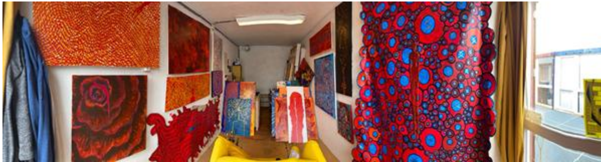
Figure 26: "Rika's Studio" at Treehouse.

experiences. She explained that having her workspace in the back of her studio, away from the window and her other pieces, she is now able to work without breaking up her experiences with the piece she is working on. In addition, the space in the back is also used to store stocks of canvases, paint, and other materials. Rika likes things in her studio labeled, so it is easy for her to find the tools she is looking for quickly. In my film I'm following Rika during the day in her studio.