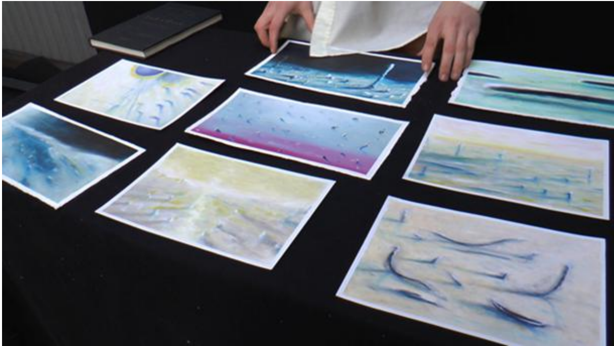
Figure 22: Paolo's artworks are built up with unstructured and liberated forms, which gives the audience the opportunity to create their own narratives. His paintings seem paradoxical at first sight, but it explores the co-existence of observation and perception, according to what Paolo explained to me. From Space For Artistic Practice .