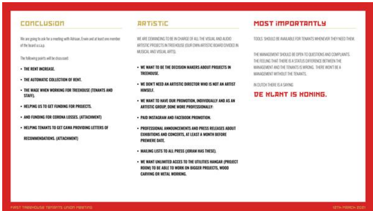
Figure 16: Section from the flyer: “12 March 2021: First Treehouse Tenants Union Meeting”.

Since I have not worked out the role of community so well with the other artists, I will come back to it later in this article, but not in this specific way. In the next section I would like to explore the concepts artistic practice and artistic intentionality and the role of artists.