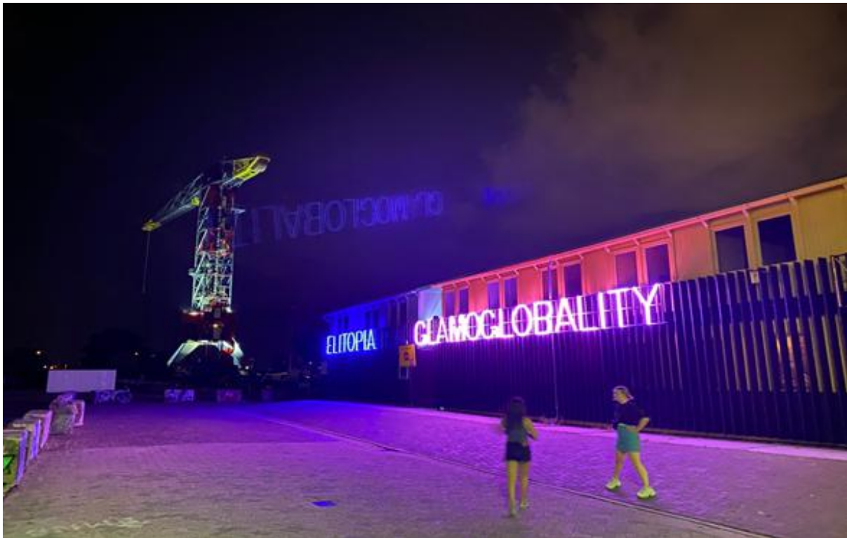
Figure 6: “Treehouse by Night”.