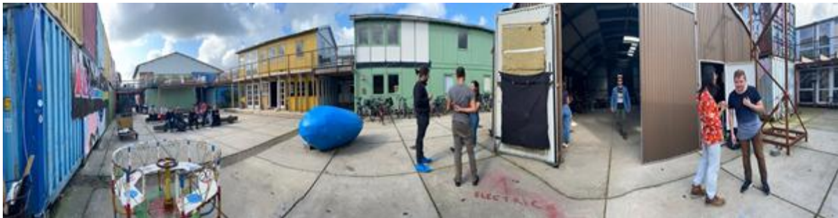
Figure 9: "Party at the Square" at Treehouse. Photograph taken by Dilara Erzeybek.

One of my observations at Treehouse were the formations of smaller communities within the larger community. These sub-communities are not necessarily exclusive. On the contrary, they are more layered, as they are overlapping group formations. Several examples are group formations around initiatives related to music practices, organizing a joint exhibition or a joint project (collaboration). In addition, I was able to observe a small Italian community, whose members were also occasionally present in the other group formations. In this section I discuss the artist in relation to space from the artist's perspective; how the artists relate to policy; and how the artists enter a dialogue to get what they want and what they expect from the space.