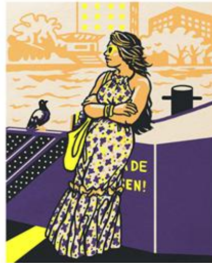
Figure 2: “Flirting With Danger” Summer Illustration, “Faces on the Ferry”. By Rachelle Meyer (Artist at Treehouse).

Cameron Coaffee (2005), argue that the role of culture and capital are key drivers of gentrification and “both art and culture, and gentrification have been extensively used in public policy as instruments of physical and economic regeneration of declining cities, and the two are often associated in a relationship of mutual dependence” (46). One of the goals of Bureau Broedplaatsen is to make at least 10,000 m^2 of new incubators possible every year. Treehouse makes a substantial contribution to this with more than 2,000 m^2 , as the emergence of breeding locations goes hand in hand with gentrification processes in the area. This applies to my research site in such a way that due to gentrification processes, the yard and the parts on the north side of the site had to be cleared according to the municipality. The Treehouse project-initiators proposed to the municipality, to transform the (squatter) Treehouse that they already know about, “which is not official”, into an “official thing, with everything as it should be according to municipality regulations”, allowing many possibilities to organize public events and to just be there.