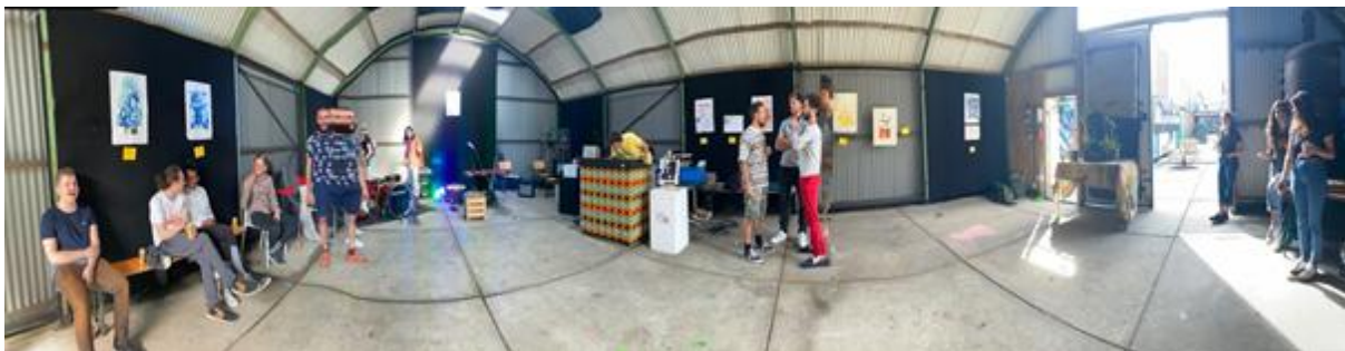
Figure 10: "A party organized by a community member in the communal space/ Gallery" at Treehouse.