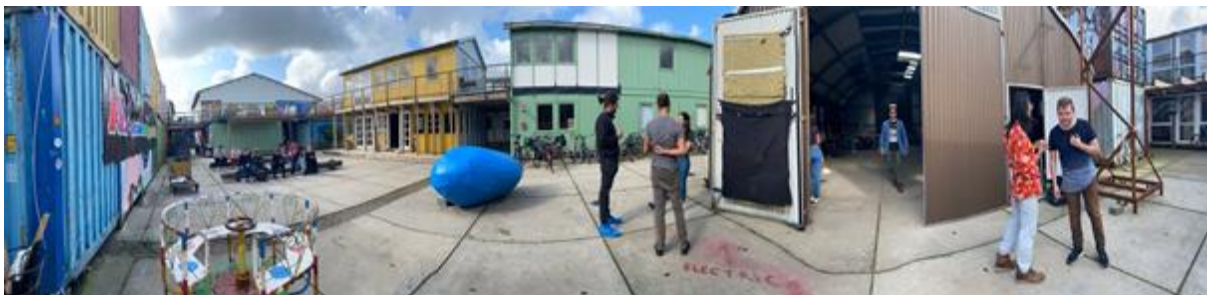
Figure 4: “The square” at NDSM Treehouse Amsterdam.