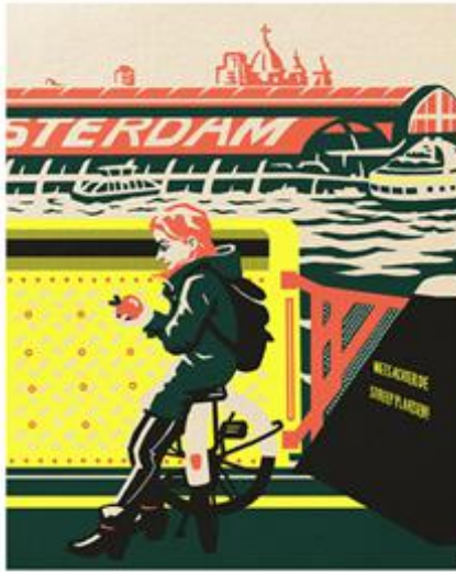
Figure 1: “I am” Autumn Illustration, “Faces on the Ferry”. By Rachelle Meyer (Artist at Treehouse).