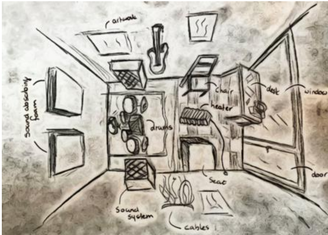
Figure 25: My interpretation of Paulo's workspace.