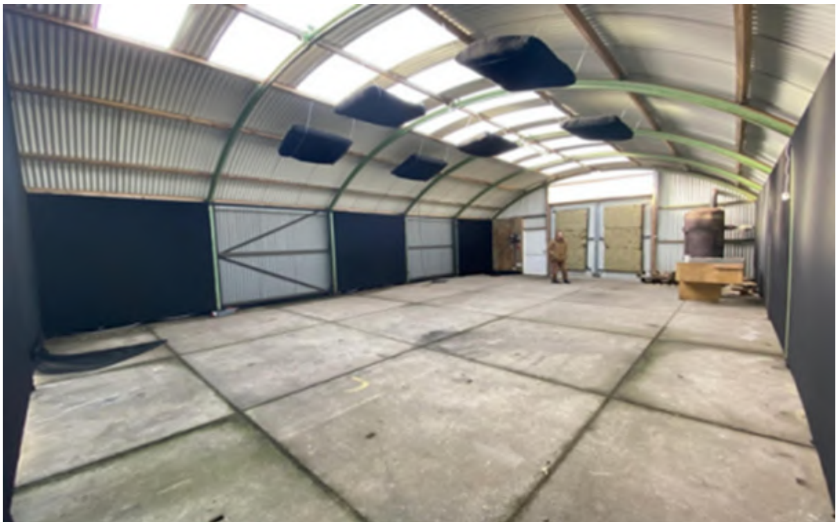
Figure 32: “The Hangar/Gallery”, which is a communal space at Treehouse that artists can use for different purposes.