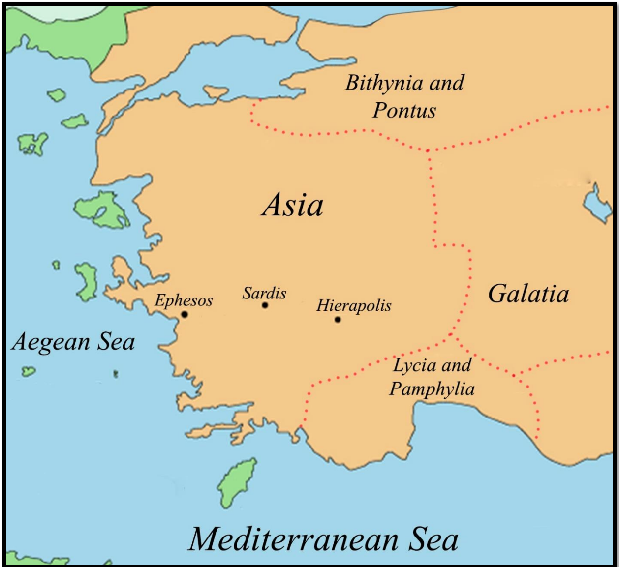
Figure 1: Map of Asia Minor (ca. 2nd cent. A.D.)