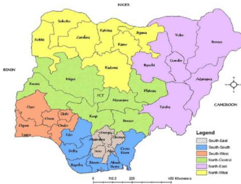
Figure 2. Source: Chukwuonye et al, 2018: Map of Nigeria showing the geopolitical zones of the country.

varying degrees of authority to the male gender. This might be due to the patriarchal dispositions of societies in which these socio-cultural factors emerged (Stroebe, 2015). The estimated 200 million population of Nigeria is almost equally divided by Islamic and Christian religions (Edewor et al., 2014). The nature of the Islamic religion that is widely practised in the Northern part of the country is far more patriarchal than what is practiced in the Christian South.