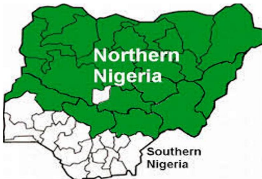
Figure 1. The Map of Nigeria

Title: Lack of access to education for girls in northern Nigeria.