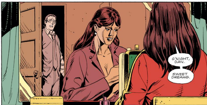
Figure 1.4: Dan and Laurie’s stories are mirrored throughout Chapter V, from: Moore, Alan, and Dave Gibbons. Watchmen . New York: Warner Books, 1987, pp. 154, 163.

bigger testimony to a form of spatial time, which is so characteristically described by McCloud. Entitled “Fearful Symmetry”, Chapter V lives up to its name. Not only is it a reference to the William Blake poem printed at the end of the chapter, but it also hints at the hidden symmetry that can be found throughout the pages. The first page of the chapter is mirrored by the last