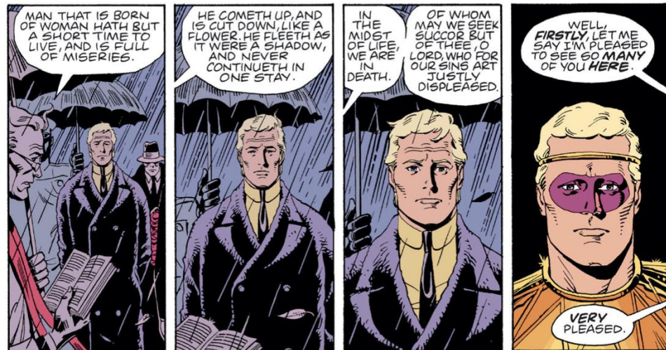
Figure 1.1: Adrian Veidt at Edward Blake's funeral, from: Moore, Alan, and Dave Gibbons. Watchmen . New York: Warner Books, 1987, p. 51.

Through the eyes of both McCloud and Bergson, then, Watchmen is stylistically a true embodiment of time regarded