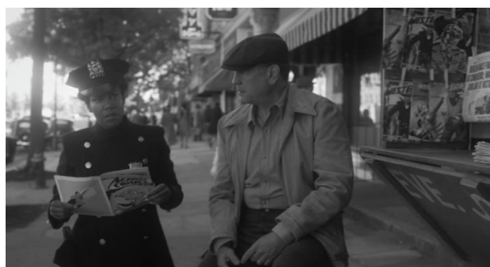
Figure 2.2: Will changes into Angela as the camera turns around, from: “This Extraordinary Being.” Watchmen , written by Cord Jefferson and Damon Lindelof, directed by Stephen Williams, Home Box Office, 2019.