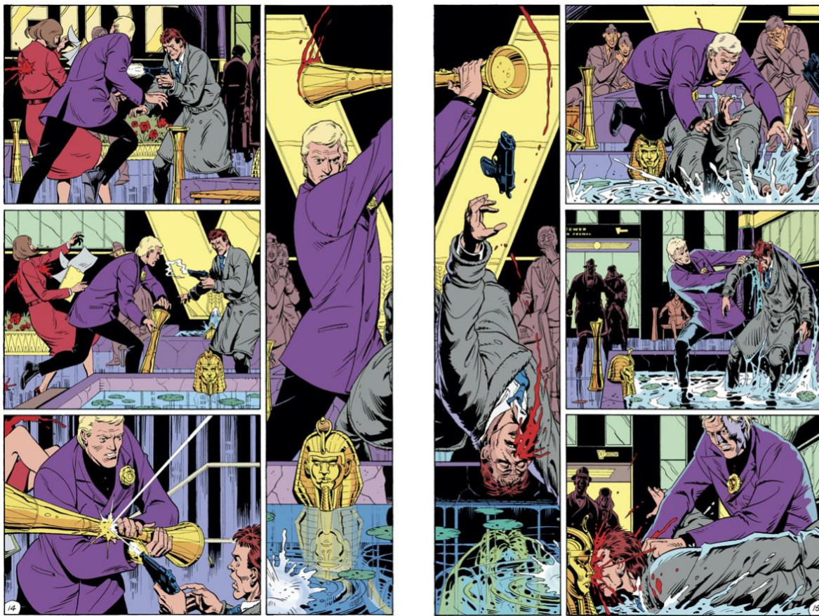
Figure 1.5: The attack on Veidt in the middle of Chapter V is the moment in which the mirroring of the chapter comes together from: Moore, Alan, and Dave Gibbons. Watchmen . New York: Warner Books, 1987, pp. 158-159.

on either side of the page form a whole. Even boundaries between pages are ignored in order to show the coming together of time. Again, time is spatially split up: whilst the reader knows that Veidt's movement is one that takes place in the time span of a few seconds, the intercutting of the two panels across the pages reminds them that time is almost subservient to space. Bergson's desire to perceive time in a durational form is seemingly absent, as the inevitability of such spatial time is not only stylistically evident, but narratively as well.