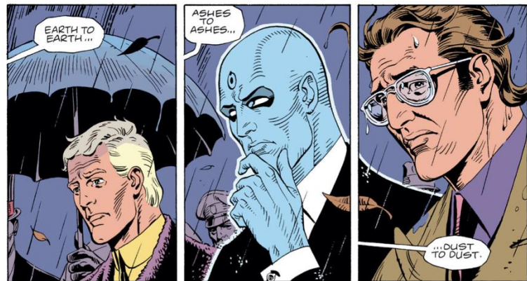
Figure 1.3: Adrian Veidt, Dr. Manhattan and Dan Dreiberg at Blake's funeral, from: Moore, Alan, and Dave Gibbons. Watchmen . New York: Warner Books, 1987, p. 58.

But not only the past gets highlighted and divided up. Figure 1.3 shows that the present can be intersected as well. These panels are an example of what McCloud described as seeing everything all at once when glancing at a comic. Different