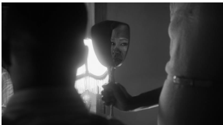
Figure 2.3: Will's reflection in the mirror shows Angela's face, from "This Extraordinary Being." Watchmen , written by Cord Jefferson and Damon Lindelof, directed by Stephen Williams, Home Box Office, 2019.

swallowed her grandfather Will Reeves' nostalgia pills. These pills function as bottled-up memories, and taking them causes someone to relive their happiest moments: because, as Laurie states, "who wants to live in the moment when you can live in the past?" ("This Extraordinary Being" 04:52) But since Angela took someone else's pills, something that is strictly advised against, she almost overdoses, and experiences how Will became Hooded Justice who was one of the first Minutemen. The entire episode consists of memories in the form of flashbacks, and the colors have been toned down to black and white. Because Angela is experiencing the memories, the episode plays with time. This feverish dream eventually starts to blur the lines between the subject and the observer. In figure 2.2, Will talks to a man reading a comic, when suddenly he gets thumped by the man that he just thought he put away in jail. There is a long one-shot in this instance, in which the camera is firstly focused on Will. When the man walks past and touches Will's shoulder, the camera follows him in order to show his face. However, when the camera returns to show Will's surprised face, where he was standing, Angela has now taken his place, carrying his uniform and baffled look. Reminiscent of the cleverness used in the comic as well, this illustrates how both persons are slowly becoming one (which will be discussed further later in the chapter), with Angela processing