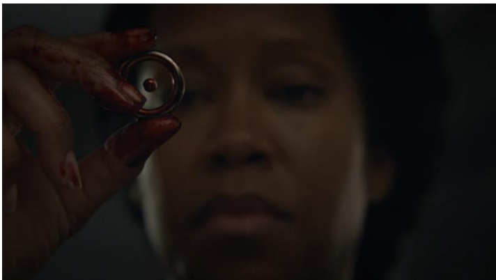
Figure 2.1: Angela inserting and retrieving the device that made Dr. Manhattan forget who he was, from: “A God Walks into Abar.” Watchmen , written by Jeff Jensen and Damon Lindelof, directed by Nicole Kassell, Home Box Office, 2019.

are given that these scenes do not match up with the Tulsa timeline, but the expectation is created that Veidt's search for freedom is happening at the same time as Angela's storyline plays out. Another example of a confusion within the discourse narrative can be seen in the eighth episode, which centers around the romantic relationship that Angela has, or has had, with Dr. Manhattan. In this episode, it is revealed that Angela's husband Cal has been Dr. Manhattan all along, hiding in plain sight on