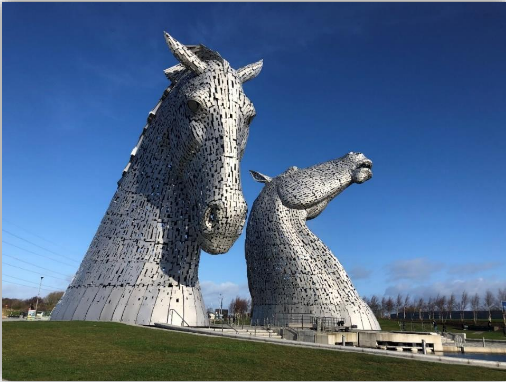
Fig. 3: “The Kelpies” in Falkirk, Scotland, 23 March 2019

David notices a change in his own sense of Scottish identity and sense of place in the concluding part of the narrative. In the final passage, David is back in Edinburgh after he has at last successfully claimed his inheritance. Just as in the beginning of the novel, the capital city is depicted as industrial and vibrant, but David now senses a shift in his appreciation of this environment: