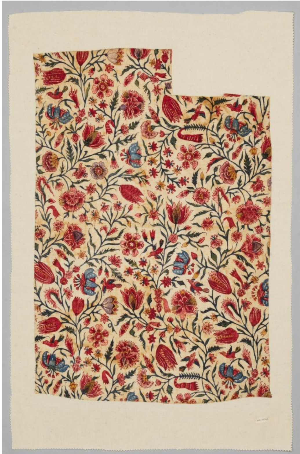
Figure 1- An example of Chintz with large flowers, circa 1750. 146