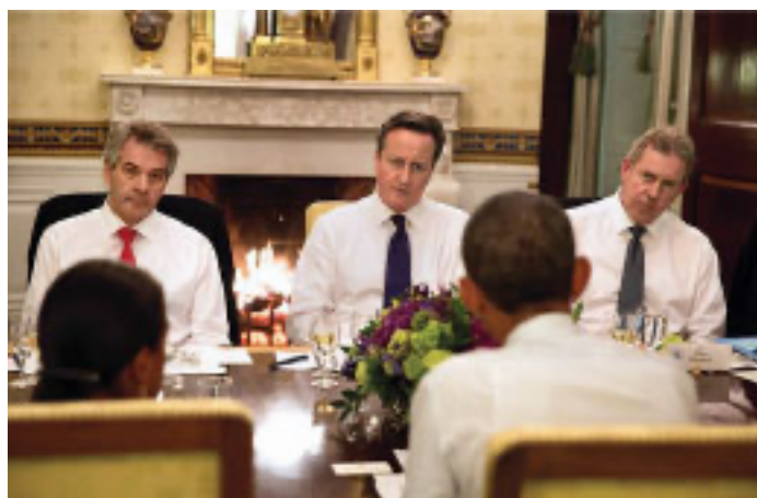
British Prime Minister David Cameron, flanked by U.K. officials, attends dinner at the White House in January 2015.

Many of his advisers did not grasp the depth of the president's misgivings; his Cabinet and his allies were certainly unaware of them. But his doubts were growing. Late on Friday afternoon, Obama determined that he was simply not prepared to authorize a strike. He asked McDonough, his chief of staff, to take a walk with him on the South Lawn of the White House. Obama did not choose McDonough randomly: He is the Obama aide most averse to U.S. military intervention, and someone who, in the words of one of his colleagues, "thinks in terms of traps." Obama, ordinarily a preternaturally confident man, was looking for validation, and trying to devise ways to explain his change of heart, both to his own aides and to the public. He and McDonough stayed outside for an hour. Obama told him he was worried that Assad would place civilians as "human shields" around obvious targets. He also pointed out an underlying flaw in the proposed strike: U.S. missiles would not be fired at chemical-weapons depots, for fear of sending plumes of poison into the air. A strike would target military units that had delivered these weapons, but not the weapons themselves.