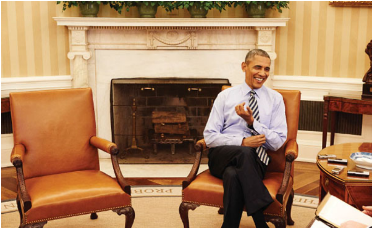
Obama in the Oval Office, where, two and a half years ago, he shocked national-security aides by calling off air strikes on Syria

The current U.S. ambassador to the United Nations, Samantha Power, who is the most dispositionally interventionist among Obama's senior advisers, had argued early for arming Syria's rebels. Power, who during this period served on the National Security Council staff, is the author of a celebrated book excoriating a succession of U.S. presidents for their failures to prevent genocide. The book, A Problem From Hell , published in 2002, drew Obama to Power while he was in the U.S. Senate, though the two were not an obvious ideological match. Power is a partisan of the doctrine known as "responsibility to protect," which holds that sovereignty should not be considered inviolate when a country is slaughtering its own citizens. She lobbied him to endorse this doctrine in the speech he delivered when he accepted the Nobel Peace Prize in 2009, but he declined. Obama generally does not believe a president should place American soldiers at great risk in order to prevent humanitarian disasters, unless those disasters pose a direct security threat to the United States.