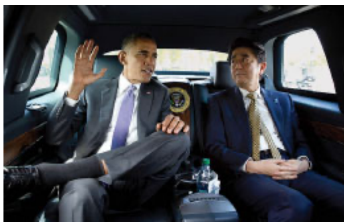
Obama and Japa-nese Prime Minister Shinzo Abe in Washington, D.C., April 2015.

“It is literally in my DNA to be suspicious of tribalism,” he told me. “I understand the tribal impulse, and acknowledge the power of tribal division. I’ve been navigating tribal divisions my whole life. In the end, it’s the source of a lot of destructive acts.”