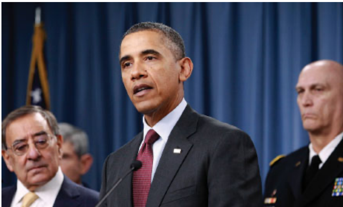
Leon Panetta (left) attends a press briefing on military strategy in January 2012. Panetta, then Obama’s secretary of defense, has criti-cized the president’s failure to enforce the Syrian red line.

Kerry, in his remarks on August 30, 2013, suggested that Assad should be punished in part because the “credibility and the future interests of the United States of America and our allies” were at stake. “It is directly related to our credibility and whether countries still believe the United States when it says something. They are watching to see if Syria can get away with it, because then maybe they too can put the world at greater risk.”