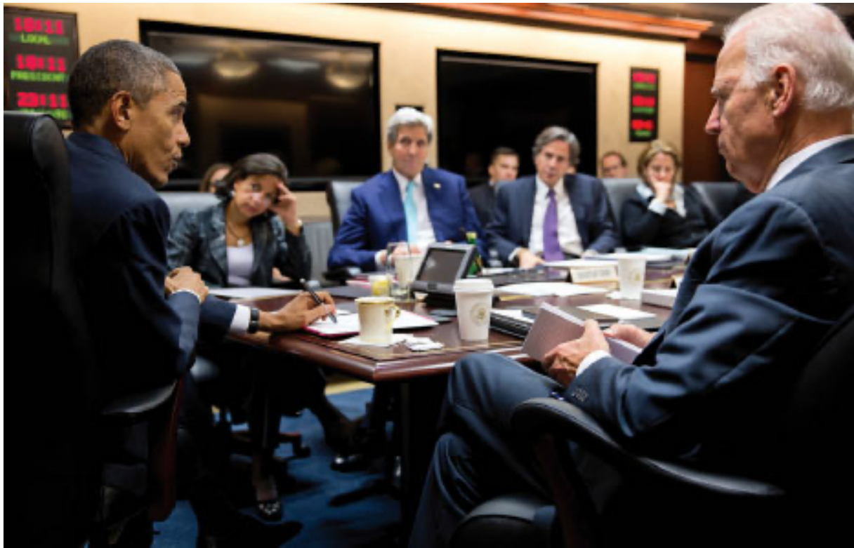
Obama and Vice President Joe Biden meet with members of the National Security Council, including Susan Rice and John Kerry (second and third from left), in December 2014.

Obama flipped this plea on its head. “When you have a professional army,” he once told me, “that is well armed and sponsored by two large states”—Iran and Russia—“who have huge stakes in this, and they are fighting against a farmer, a carpenter, an engineer who started out as protesters and suddenly now see themselves in the midst of a civil con-flict . . .” He paused. “The notion that we could have—in a clean way that didn’t commit U.S. military forces—changed the equation on the ground there was never true.” The message Obama telegraphed in speeches and interviews was clear: He would not end up like the second President Bush—a president who became tragically overextended in the Middle East, whose decisions filled the wards of Walter Reed with grievously wounded soldiers, who was helpless to stop the obliteration of his reputation, even when he recalibrated his policies in his second term. Obama would say privately that the first task of an American president in the post-Bush international arena was “Don’t do stupid shit.”