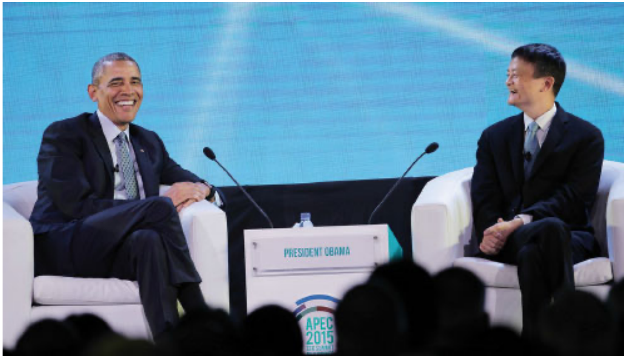
Obama with Jack Ma, the chairman of Alibaba, at the APEC summit in the Philippines last November—days after ISIS killed 130 people in Paris

“No,” he said. “Do I think that had we not invaded Iraq and were we not still involved in sending billions of dollars and a number of military trainers and advisers into Afghanistan, would I potentially have thought about taking on some additional risk to help try to shape the Syria situation? I don’t know.”