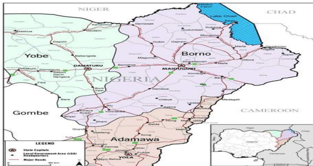
Figure 1: A Map depicting the territorial landscape of North-eastern, Nigeria.