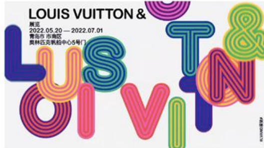
Louis Vuitton's 4th analysed post on Weibo.