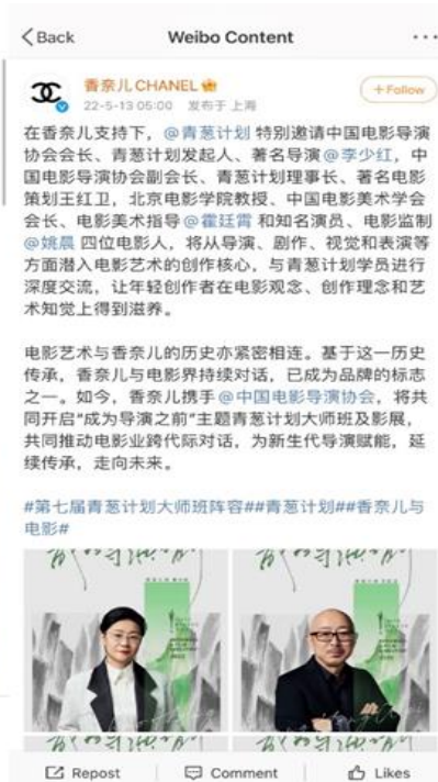
Chanel's 8 th analysed post on Weibo. (Source: Weibo account of Chanel, https://weibo.com/u/1892475055 , 13/05/2022, accessed on 01/06/2022).

Louis Vuitton, on the other hand, is also promoting consumer education, but in this case through the institution of a temporary exhibition about the brand in different Chinese cities, which is clearly aimed at creating brand awareness among the Chinese consumer base. In fact, in the post description it is underlined “路易威登联袂各界艺术家，展陈百年来绚丽缤纷的艺术合作。邀您漫步展览空间，跨时空邂逅经典佳作，畅享灵感妙境” [Louis Vuitton has partnered with artists from all circles to showcase the magnificent and diverse artistic cooperation over the past century. You are invited to stroll around the exhibition space, encounter classic masterpieces, and enjoy the wonderful world of inspiration] (Louis Vuitton's 4th analysed post on Weibo, Weibo account of Louis Vuitton, https://weibo.com/louisvuitton , 19/05/2022, accessed on 03/06/2022). This example shows explicitly that adaptation characteristic regarding the factor of creating brand awareness that is the institution of exhibitions and events that educate consumers and receivers about the concept, history and/or artistic inspiration of the brand.