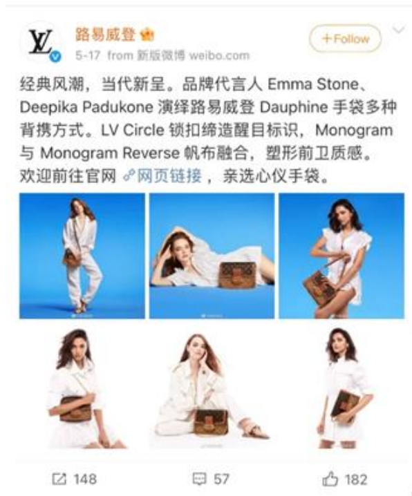
Louis Vuitton's 11th analysed post on Weibo. (Source: Weibo account of Louis Vuitton, https://weibo.com/louisvuitton , 17/05/2022, accessed on 03/06/2022).

enhances group-conformity and social status-conferring benefits, as this actress(es) represents the group of people she belongs to (one with high social status position) and endorses the use of Louis Vuitton products as being associated with this same group.