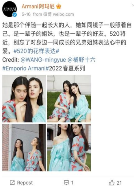
Armani's 19th analysed post on Weibo.

Still with regards to traditional cultural values, there is one example that is worth bringing: once again on the Armani Weibo account, we can notice one post that might be referring indirectly to the value of harmony. This post is also about the 520 festivity, but this time it brings the voice of a Chinese celebrity who is talking about love, and in the description of the post we can find a quote from this same person which states “坦然与自我和解，勇敢与世界碰面，都将升华成一个人爱与被爱的能力” [Being calm, reconciling with oneself and meeting the world bravely will be sublimated into one’s ability to love and be loved] (Armani’s 5 th post on Weibo, Weibo account of Armani, https://weibo.com/armani , 20/05/2022, accessed on 04/06/2022). We could consider this as implicitly referring to the value of harmony because people with high-harmony consciousness give great importance to the idea of finding inner peace and living in harmony with the rest of the world, through the reconciliation and perfect equilibrium between various different and opposing forces. As we can see from the image below, this post was greatly appreciated within the Weibo followers of the Armani account.