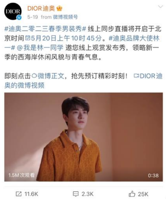
Dior's 16th analysed post on Weibo. (Source: Weibo account of Dior, https://weibo.com/u/2130860695 , 19/05/2022, accessed on 04/06/2022).

values per se, but it shows that Chinese consumers are really happy to see Chinese celebrities appear in their social media, and they show a lot of appreciation for it. In a way, such celebrities represent the concept of “miànzi” in the sense that they are part of a social group that is identified as one with high levels of miànzi: as a consequence, buying or wearing products of the same brand that these celebrities are endorsing implies gaining the same degree of miànzi.