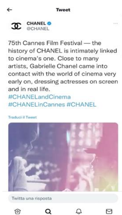
Chanel's 7 th analysed post on Twitter. (Source: Twitter account of Chanel, https://twitter.com/CHANEL , 18/05/2022, accessed 01/06/2022).

approach: in fact, the engagement rate for this post is 0,03%, which is higher than the overall average found on Weibo for the Chanel account (amounting to 0,007%).