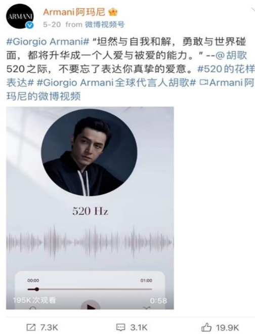
Armani's 5th analysed post on Weibo.