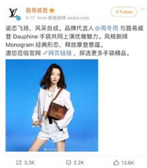
Louis Vuitton's 12th analysed post on Weibo.

Apart from this subtle referral, we can say that the political ideology factor was left aside from brands and almost never included in their Weibo posts when trying an adaptation approach.