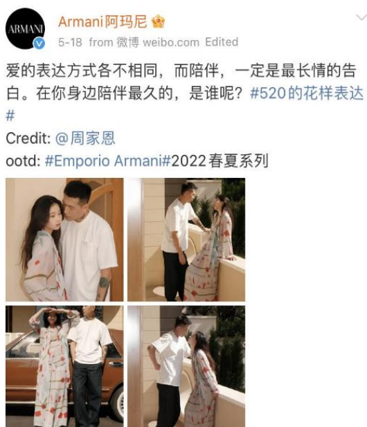
Armani's 14th analysed post on Weibo. (Source: Weibo account of Armani, https://weibo.com/armani , 18/05/2022, accessed on 04/06/2022).

17/05/2022, accessed on 04/06/2022); the third one, instead, refers to friendship and compares this kind of relationship to that of brotherhood or sisterhood by stating “她是那个伴随一起长大的人，她如同镜子一般照着自己。是一辈子的姐妹，也是一辈子的好友。520 将近，别忘了对身边一同成长的兄弟姐妹表达心中的爱” [She was the one who grew up with her, and she looked at herself just like in a mirror. A lifelong sister and friend. 520 is approaching, don't forget to express your love to brothers and sisters that you grew up with] (Armani's 19 th analysed post, Weibo account of Armani, https://weibo.com/armani , 16/05/2022, accessed on 04/06/2022). These three posts seem to refer to relationship in three different ways but always by underlining the importance such relationships should have in one's life. Although more than half of the brands analysed referred to 520 in some way, Armani was the only one who explicitly referred to relationships in a way that we could connect to the traditional cultural value of “guānxi”.