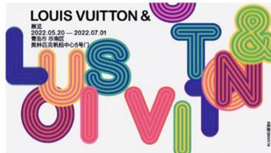
Louis Vuitton's 4th analysed post on Weibo. (Source: Weibo account of Louis Vuitton, https://weibo.com/louisvuitton , 19/05/2022, accessed on 03/06/2022).