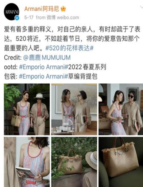
Armani's 17th analysed post on Weibo.