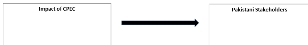
Figure 1 : Concept Model RQ1

The concept models below illustrate the interaction of variables within RQ1 and RQ2. I created these models manually to better represent the interactions between the dependent and independent variables.