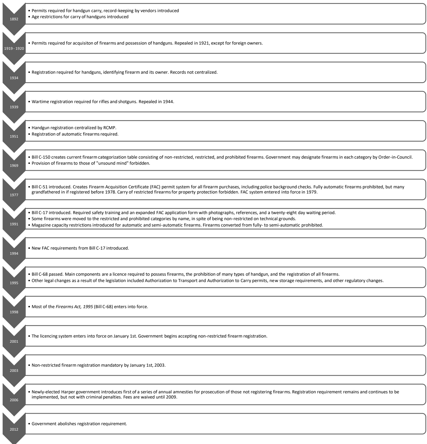
Figure 1: Timeline of Major Firearm Legislation from 1867 to Present