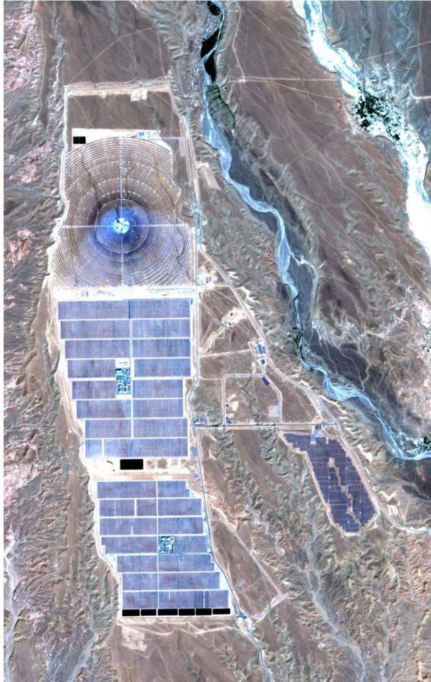
*Quarzazate Solar Power Station Phase I, II, and III from the bottom up, and Phase IV on the right side