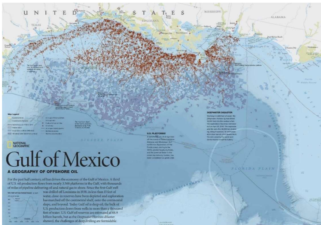
* Map of the sprawling offshore oil drilling in the Gulf of Mexico