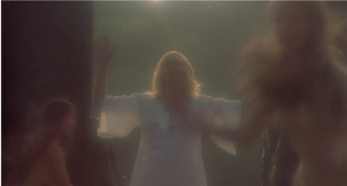
The glow effect during Holy Communion and the Parthenogenesis ritual