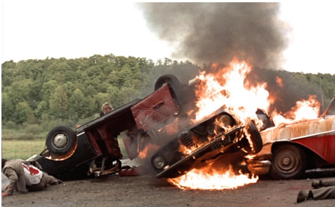
“My Hermes handbag!”

How does Godard achieve this? He does not simply show us a possible scenario, a possible route to take; instead he shows that society is already regressive. The reason that we did not see this was that the entire image or the entire truth was covered up by our prejudices. Godard shows us the entire “big club sandwich,” the civilized and the bestial in one immediate mixed-up moment (Godard Introduction 319).