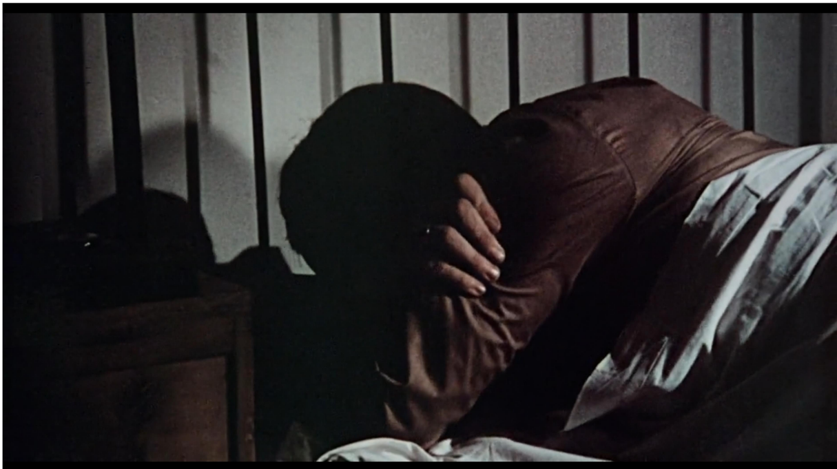
The disconnect between Howie's "duty to God," and his need to comfort himself. There is diegetic sound of poetry, song, and Willow and Ash making love.