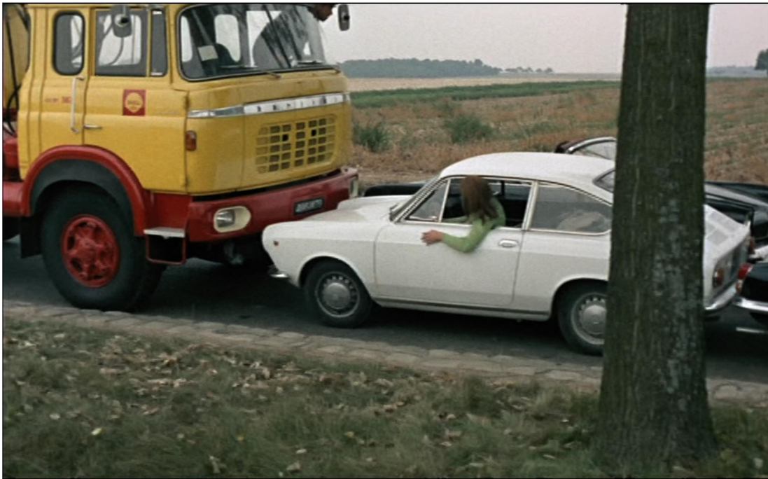
Shell versus citizen, one of the many political symbols in Week-end