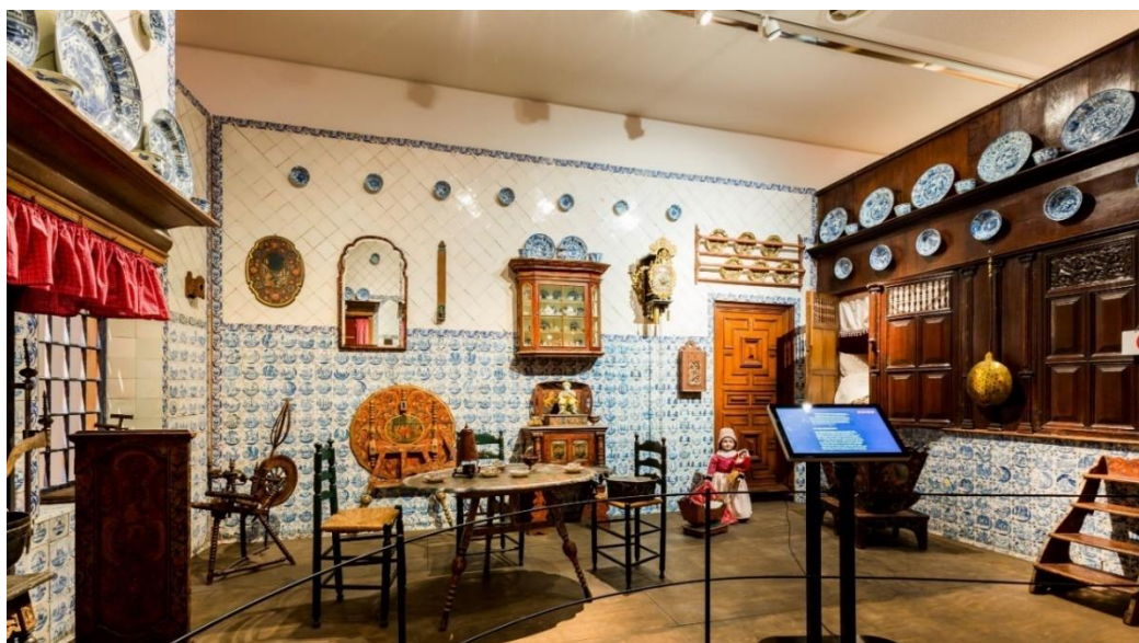
Fig. 13 Hindelooper Room, Fries Museum, Leeuwarden

The information about Chinese porcelain that is provided by the digital screen is focused on the Dutch-Chinese trade from the seventeenth century and its impact on the Hindelooper style. The narrative is focused on how Chinese porcelain was used and incorporated into local traditions without providing information about the material's original context. Since Chinese porcelain is used to represent Dutch culture rather than Chinese culture, it can be concluded that the museum presents a Western-centric narrative.