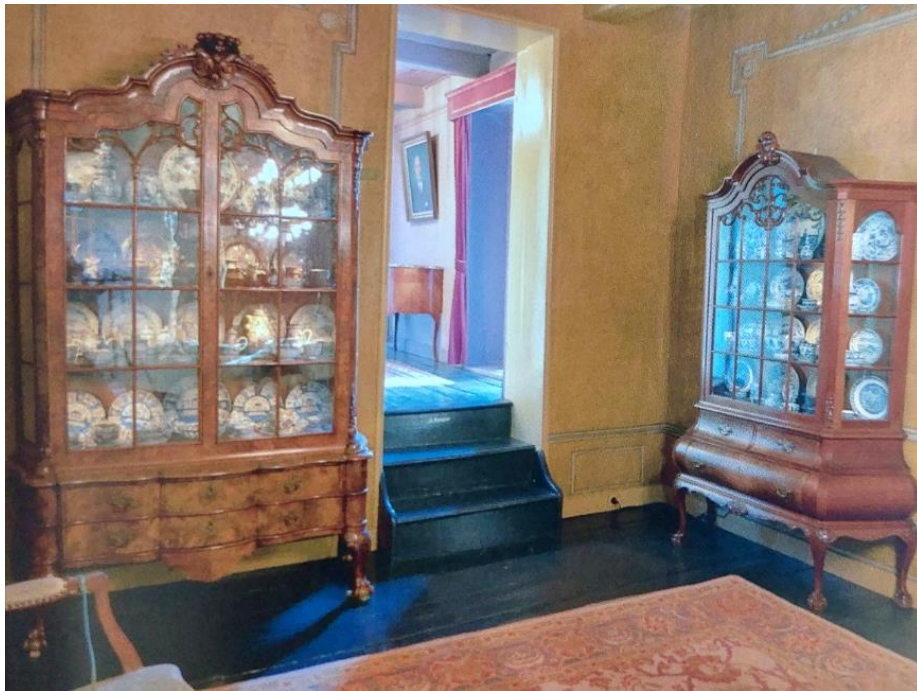
Fig. 16 Porcelain cabinets, Fraeylemaborg, Slochteren