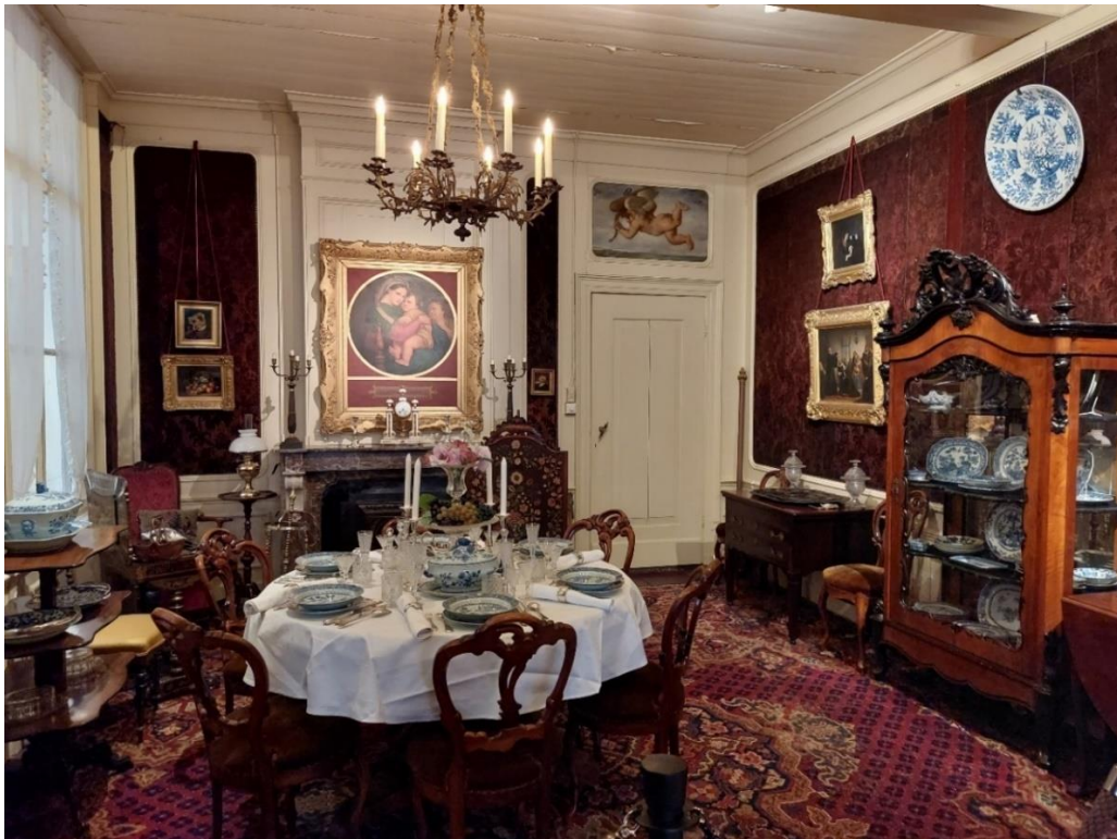
Fig. 11 Dining Room, Museum Paul Tetar van Elven, Delft (27-01-23)