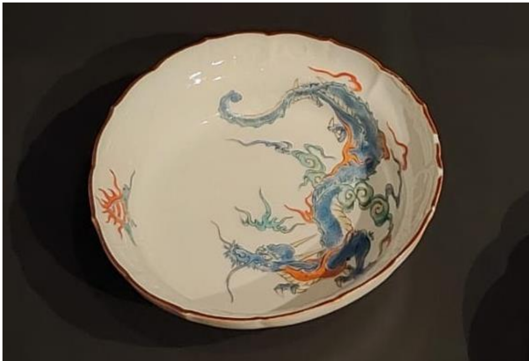
Fig. 20 Chinese porcelain bowl from the collection of Maartje Draak (bottom shelf, second from the left) (28-05-22)