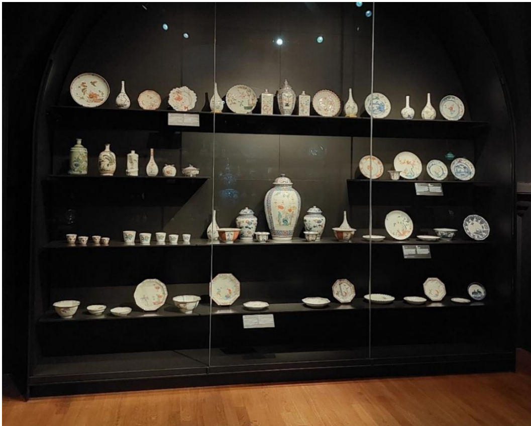
Fig. 19 Special Collections, Rijksmuseum, Amsterdam (28-05-22)