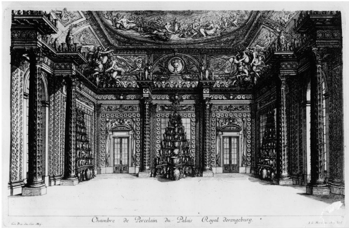
Fig. 5 The Porcelain Chamber at Oranienburg Palace, Jean Baptiste Broebes, folio 14, from: Vues des Palais et Maisons de Plaisance de Sa Majeste le Roy de Prusse , Ausburg, 1733, GK II (1) 14432