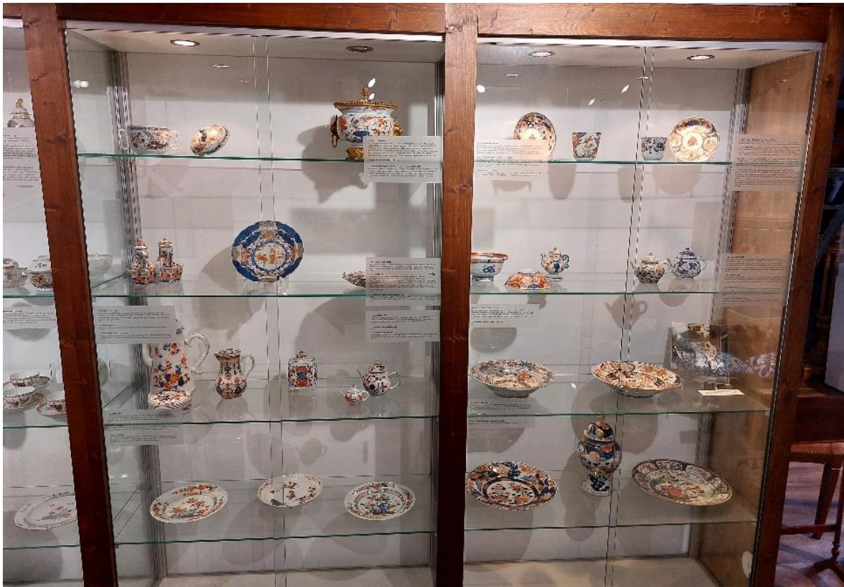
Fig. 12 Display in the attic, Museum Paul Teta van Elven, Delft (27-01-23)

Inside the attic, a different display approach is used. The porcelain has been taken out of its historic interior setting and has been put into a space where it is stripped from its context. The porcelain is placed inside modern glass display cases accompanied by object labels. (Fig. 12) The labels highlight the cultural exchanges that took place through the medium of porcelain and how this influences its shapes and styles. The labels discuss both the Chinese, Japanese and Dutch contexts that impacted the existence of the porcelain object, framing the porcelain as a transcultural object rather than just Chinese or Dutch.