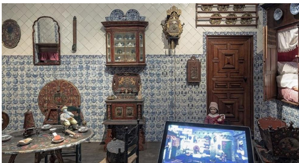
Fig. 14 Detail of the Hindelooper Room, Fries Museum, Leeuwarden