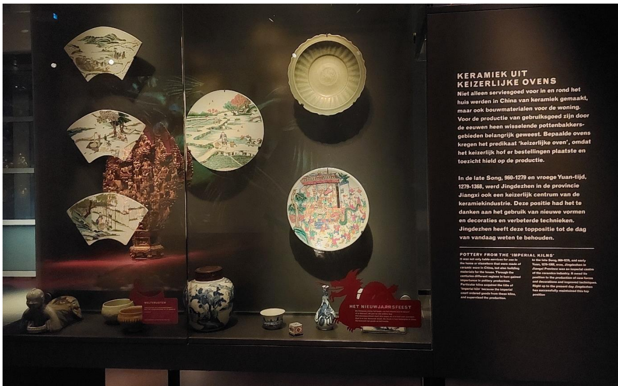
Fig. 27 China display, Museum Volkenkunde, Leiden (23-02-23)