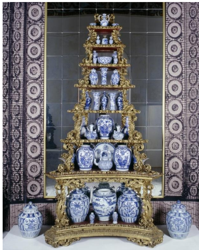
Fig. 6 Etagere in the Porcelain Chamber, Oranienburg Palace Museum