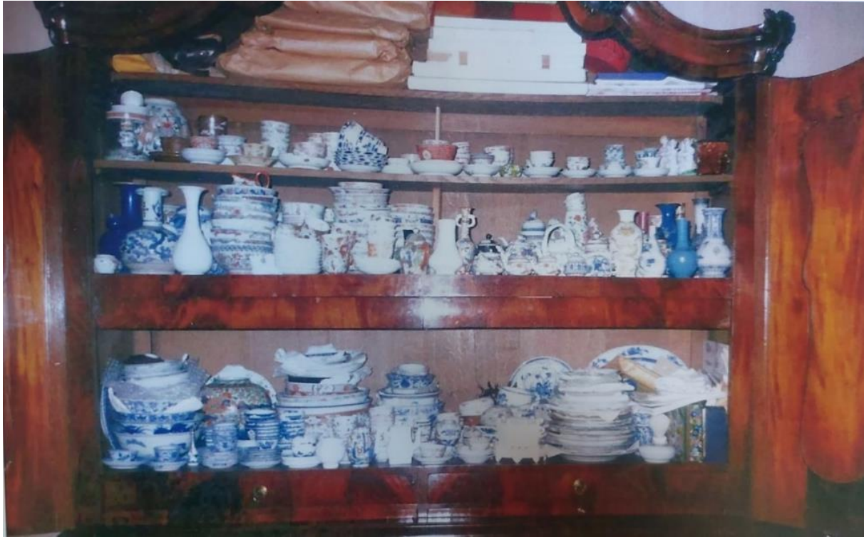
Fig. 7 Cabinet stacked with Asian porcelain inside the bedroom of Jan Menze van Diepen, 1992

Both Ottema and Van Diepen collected Chinese porcelain alongside the cultural heritage of the region where they lived. However, it seems that the different subjects formed separate collections and were not combined to form a shared narrative. Whether there are connections needs to be researched further.