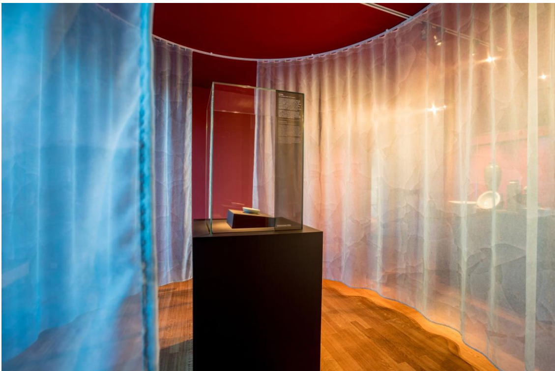
Fig. 25 Ru ware, Keramiek Museum Princessehof, Leeuwarden