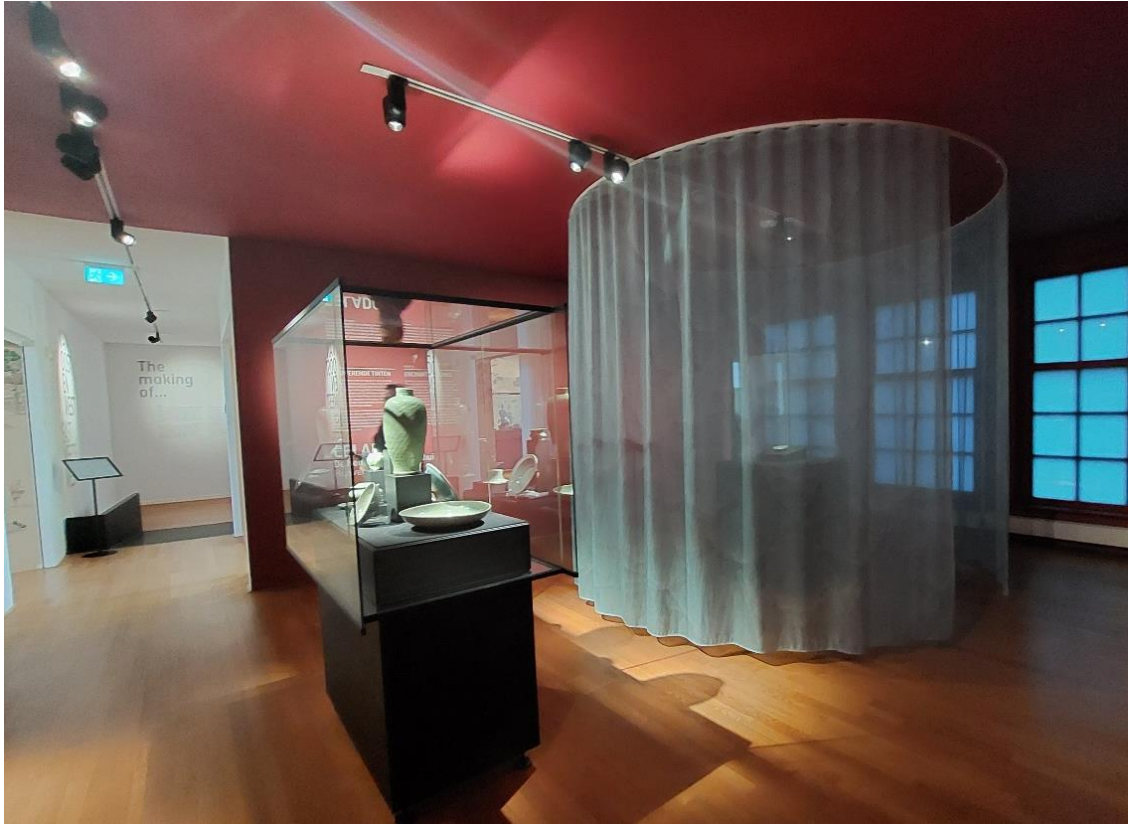
Fig. 24 Ru ware, Keramiek Museum Princessehof, Leeuwarden (08-04-23)