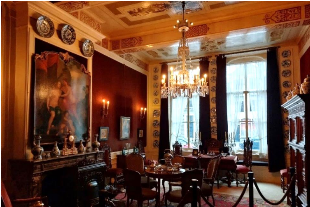
Fig. 10 Living Room, Museum Paul Tetar van Elven, Delft (27-01-23)