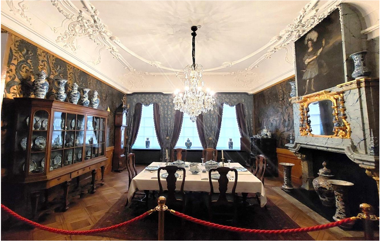
Fig. 8 The Nassau Dining Room, Keramiek Museum Princessehof, Leeuwarden (08-04-23)