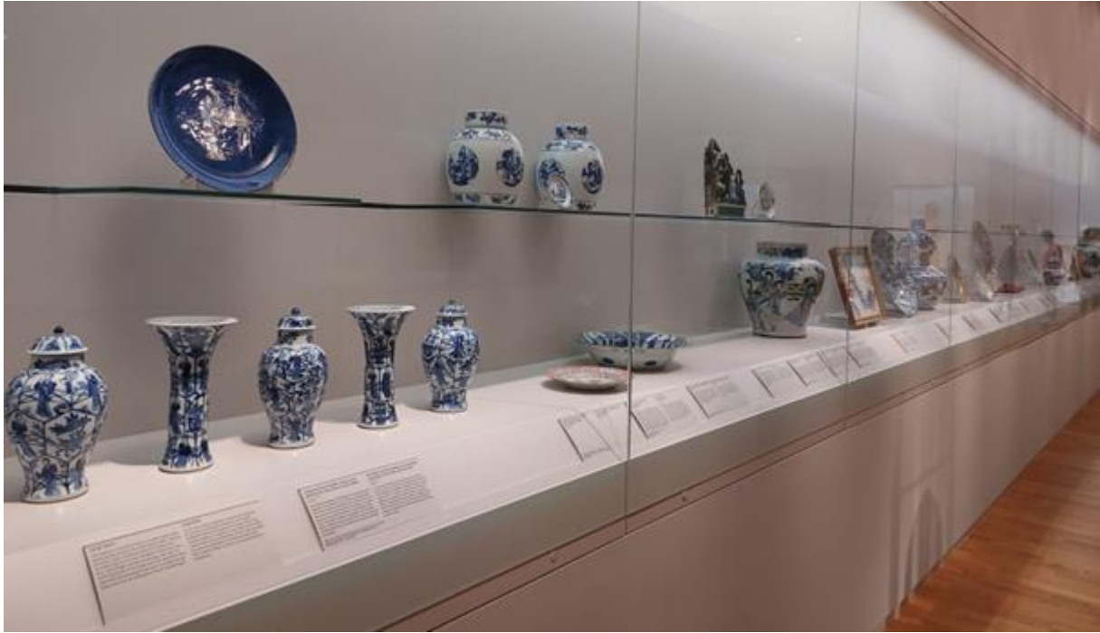
Fig. 26 Asian Pavilion, Rijksmuseum, Amsterdam (28-05-22)