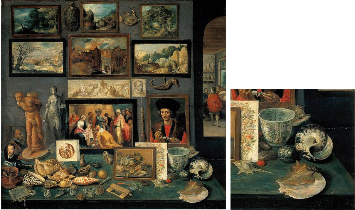
Fig. 1 Cabinet of Curiosity by Frans Francken (II), 1636, Kunsthistorisches Museum, 1048