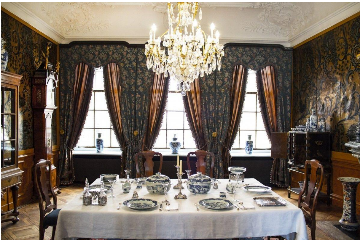
Fig. 9 Detail of the set table in the Nassau Dining Room of Keramiek Museum Princessehof, Leeuwarden