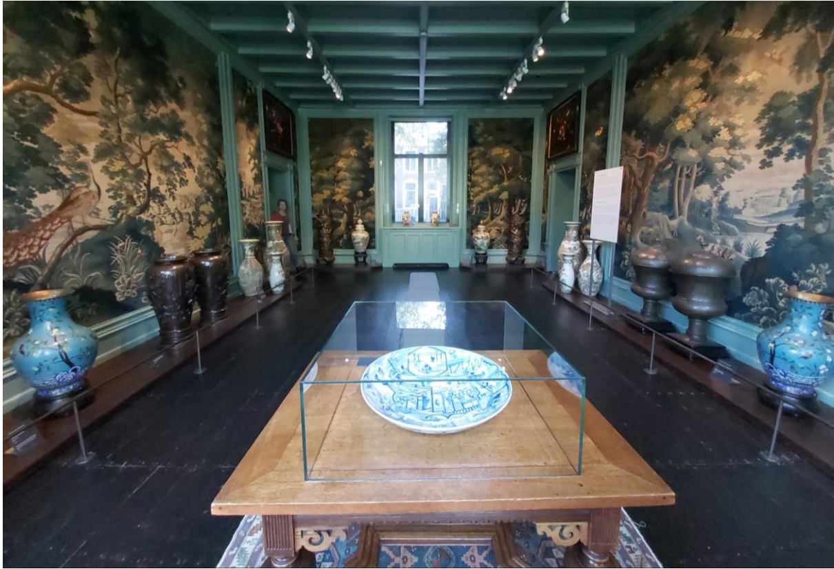
Fig. 22 Japanese Room, The Mesdag Museum, Den Haag (01-05-22)