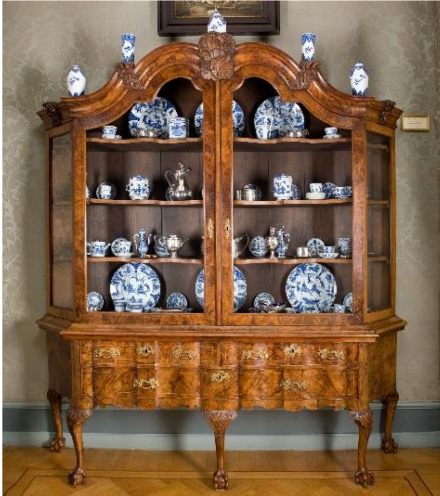
Fig. 15 Porcelain cabinet, Museum Bredius, Den Haag