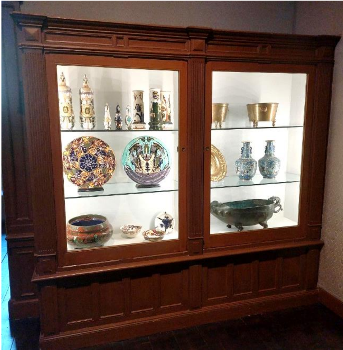
Fig. 21 Display case of Asian arts and crafts items and ceramics by Colenbrander, first floor hallway of The Mesdag Museum, The Hague (01-05-22)