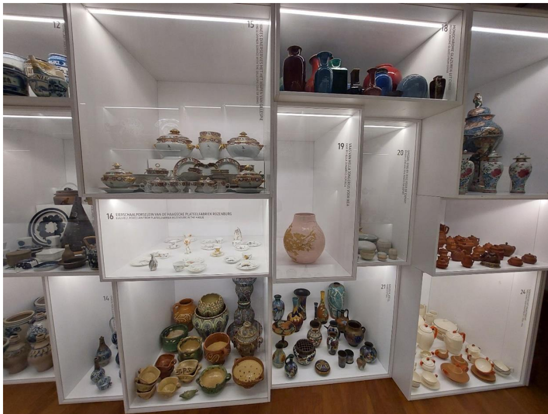
Fig. 17 and 18 Keramiek Museum Prinsessehof, Leeuwarden (08-04-23)