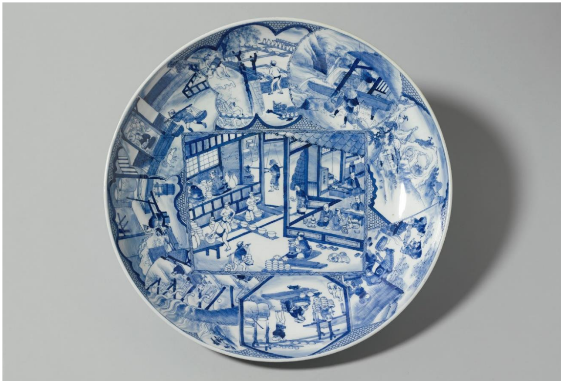
Fig. 23 Bowl with scenes depicting a porcelain factory, Arita porcelain, 1850-1875, The Mesdag Collection, The Hague (hwm0453)